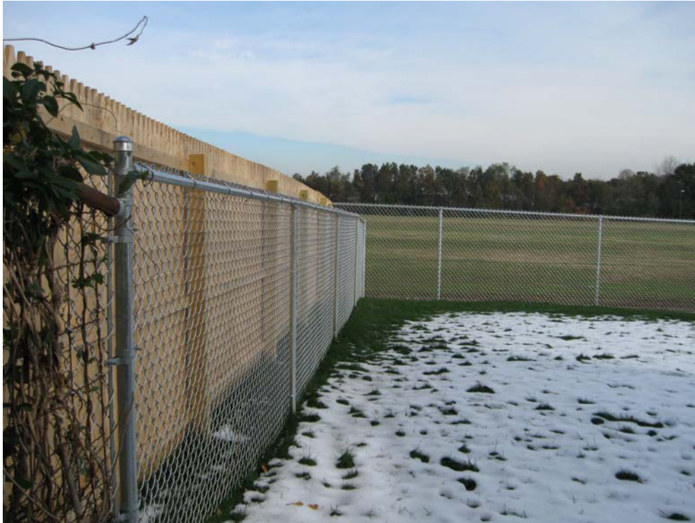
View looking North at restored back yard