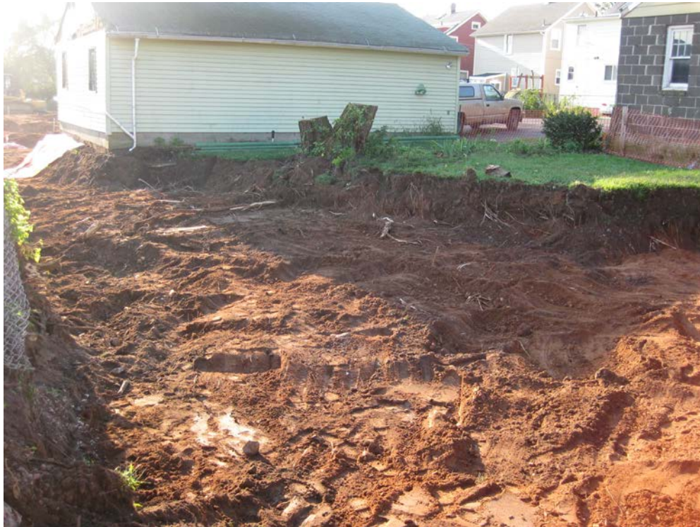
View looking Southeast at excavation of back yard