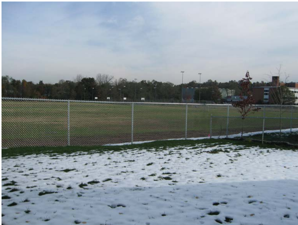
View looking Northeast at restored back yard