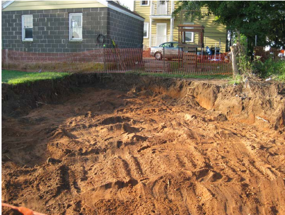
View looking South at excavation of back yard