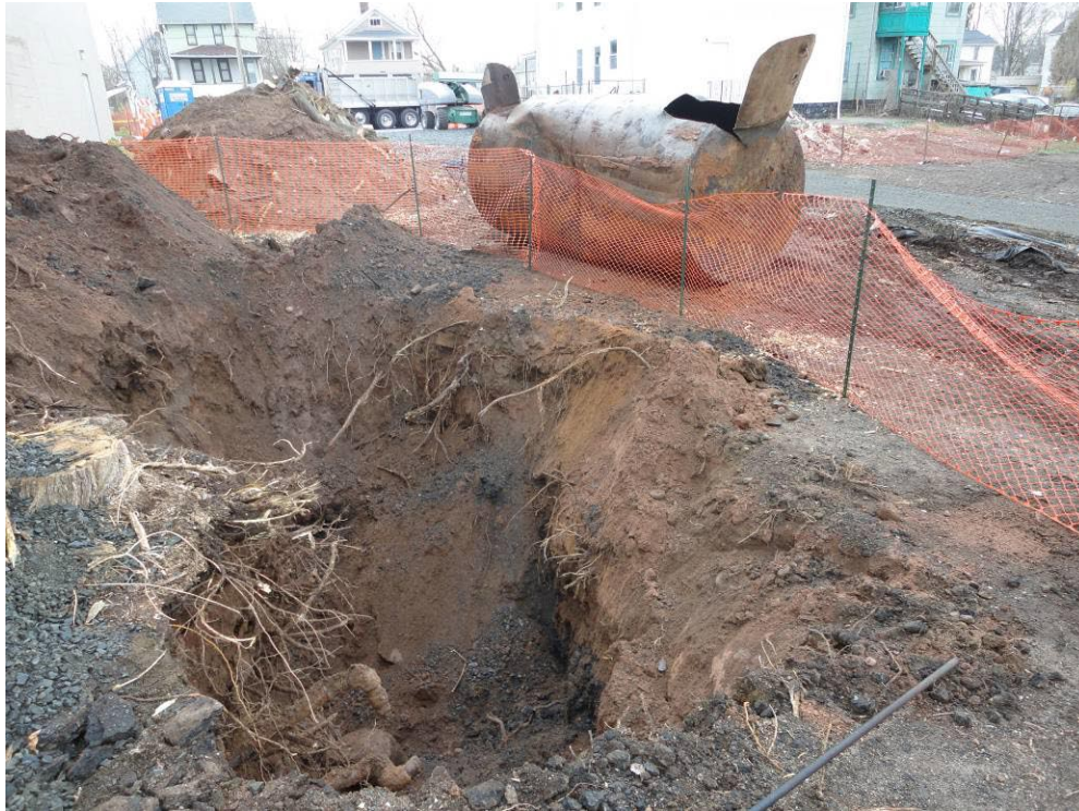
View looking East at inactive UST removed from south side of building