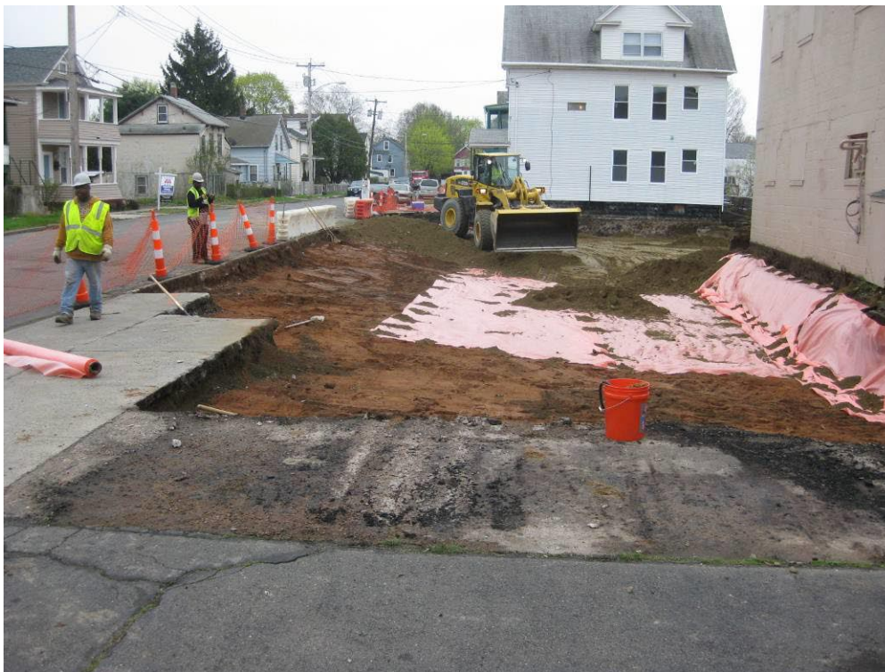
View looking North at excavated property following placement of marker barrier