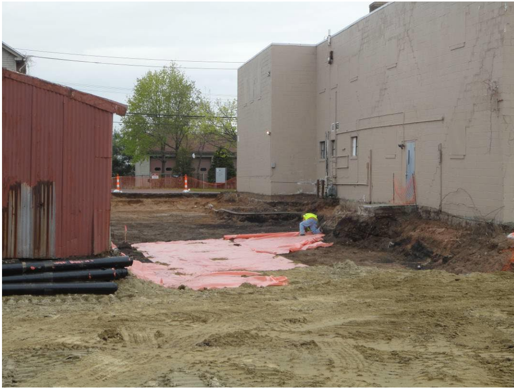
View looking West at partially backfilled area west of the building