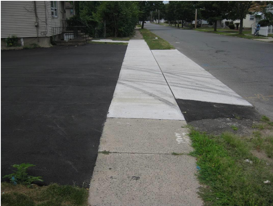
View looking South at restored driveway and sidewalk along Morse Street