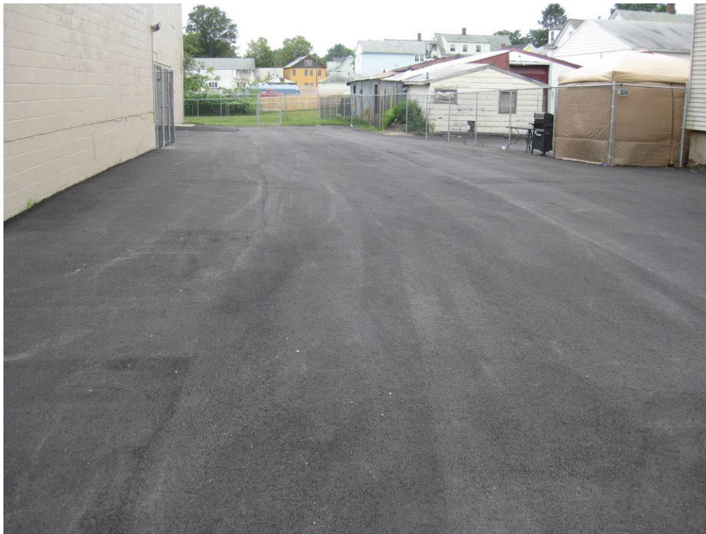
View looking North at restored parking area west of the building