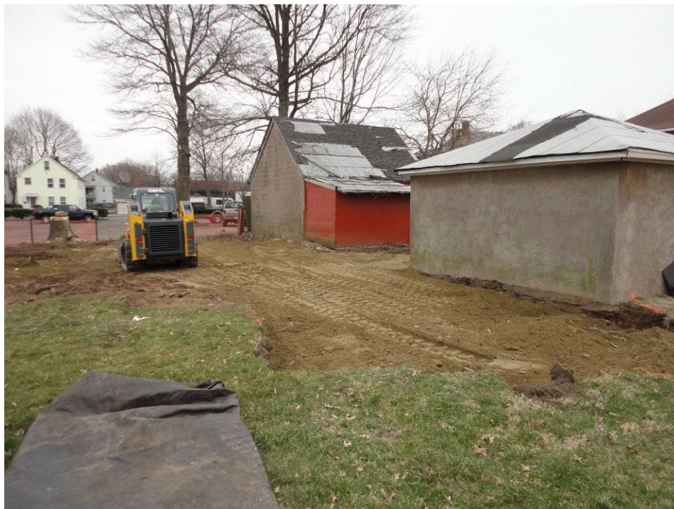
View looking Southwest at backfilled area