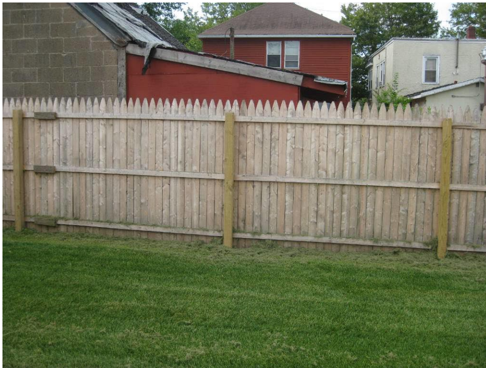
View looking South at restored fence