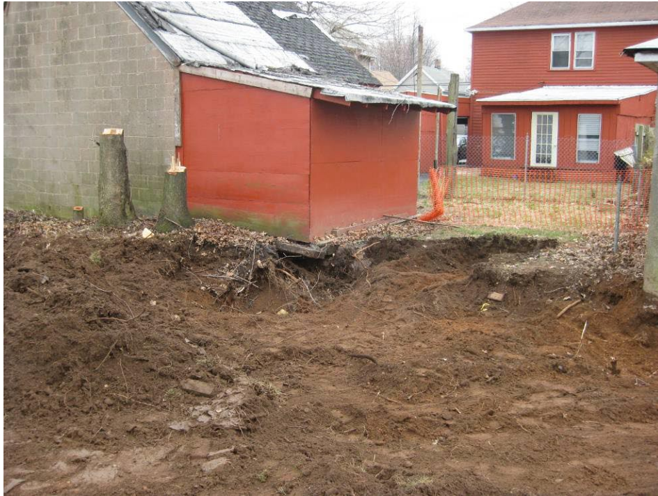
View looking Southwest at excavated yard