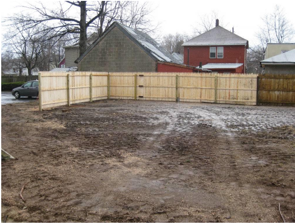
View looking south at partially restored property