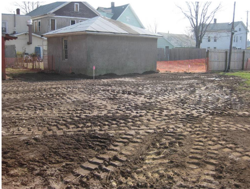
View looking Southwest at backfilled area