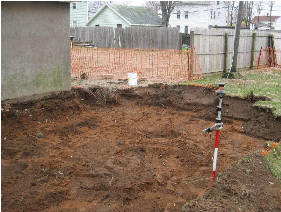
View looking Southwest at excavated yard