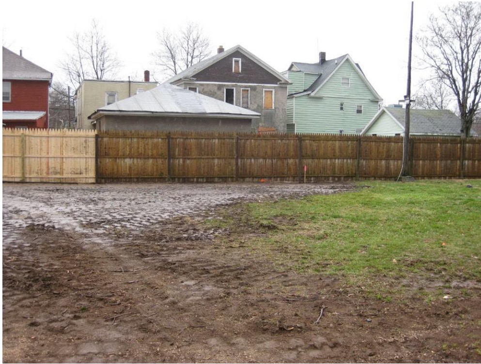
View looking South at partially restored yard