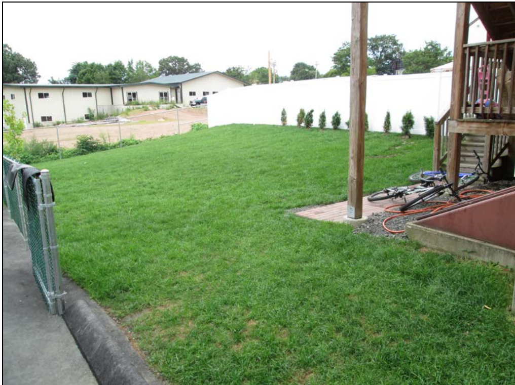
View looking northeast at restored back yard.