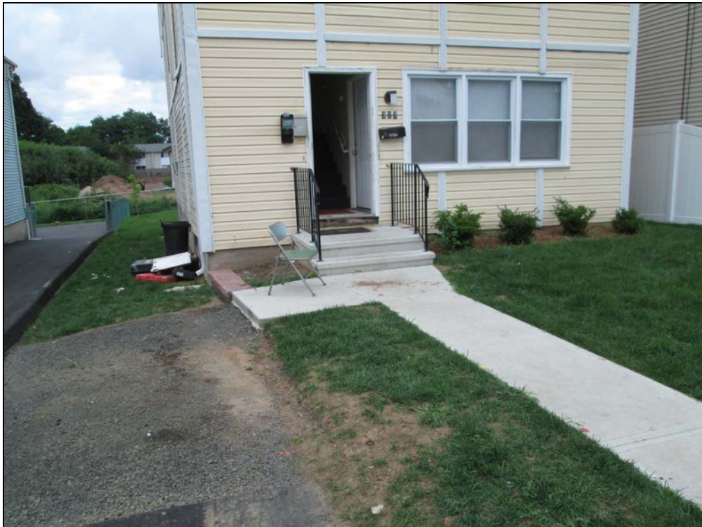
View looking north at restored front yard.