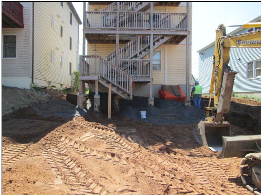
View looking south at excavated back yard. Deck was braced to allow excavation of fill beneath the footprint of the three-story deck.