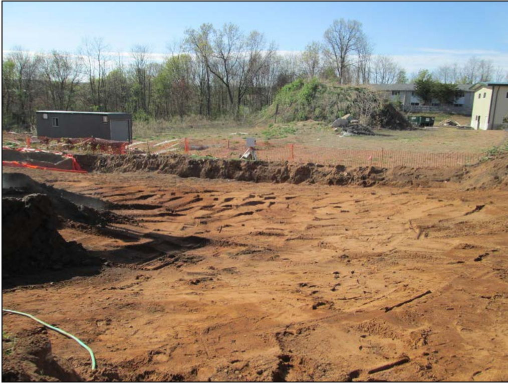
View looking north at excavated back yard.