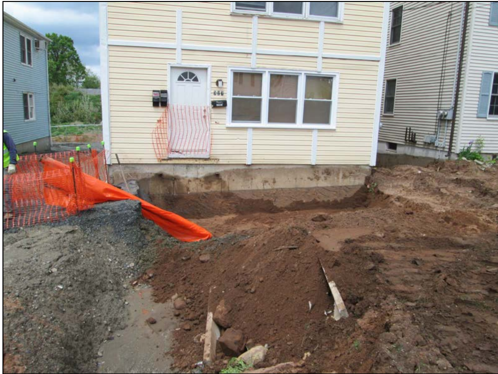
View looking north at partially excavated front yard.