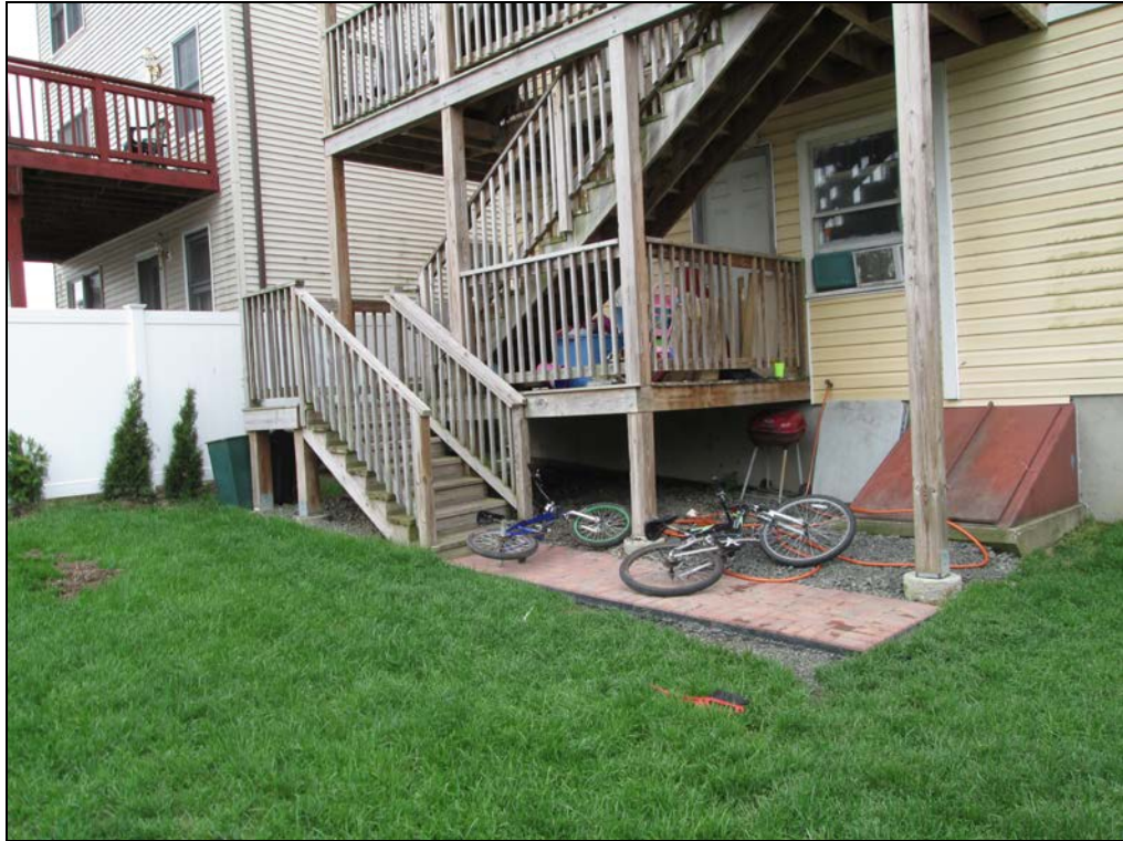
View looking southeast at restored back of house.