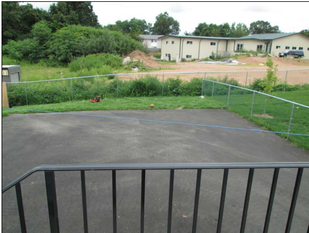
View looking north at restored back yard.