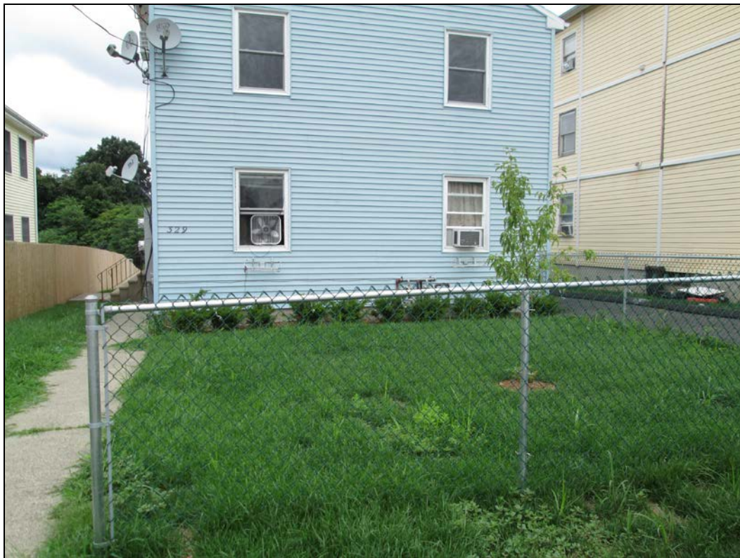
View looking north at restored front yard and driveway.