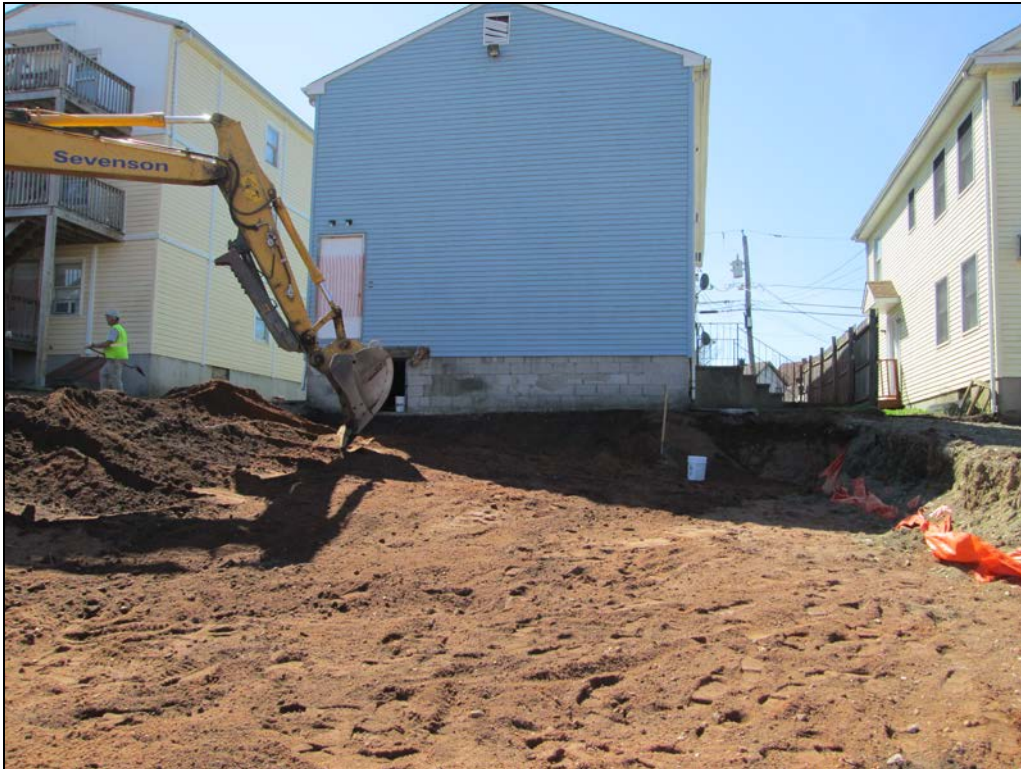
View looking south at excavated back yard.