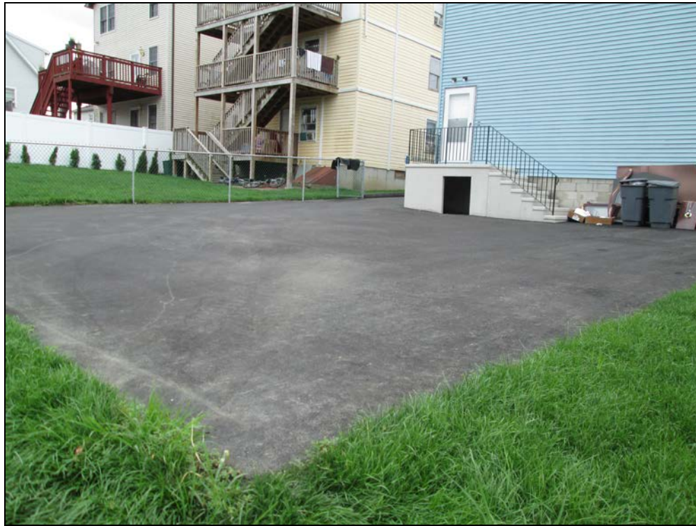
View looking southeast at restored back yard.