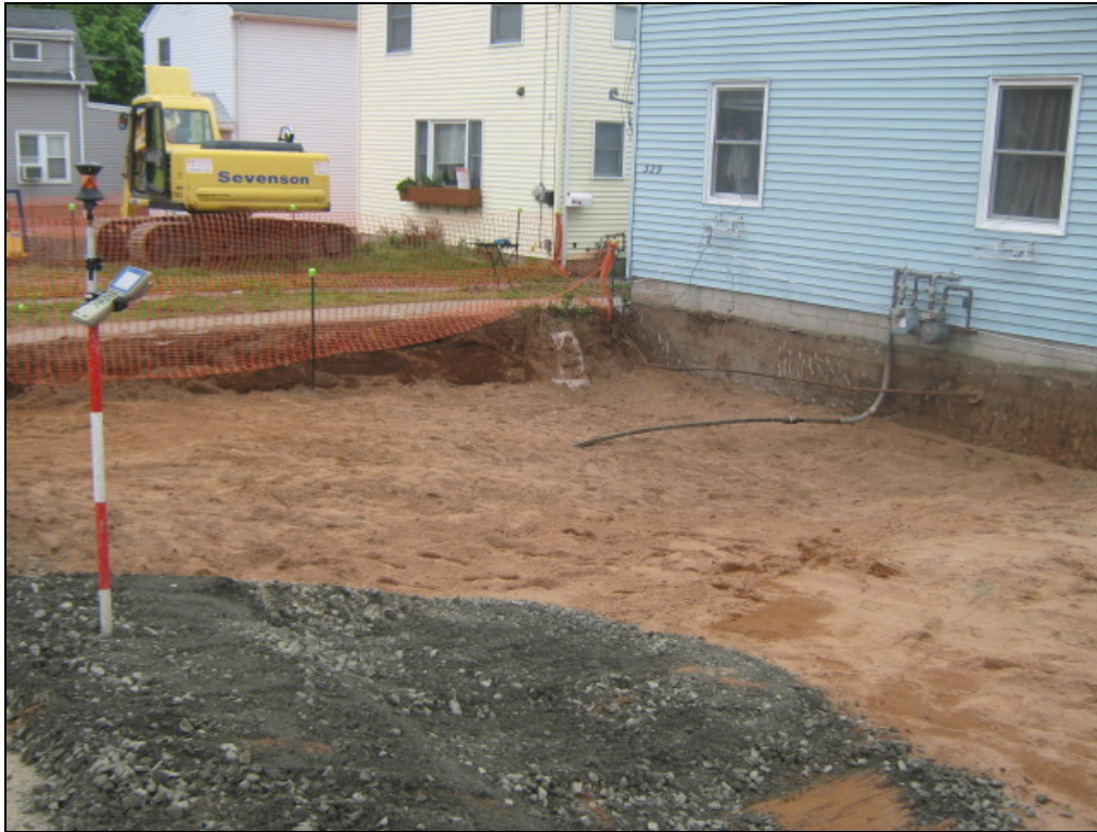
View looking northwest at excavated front yard.