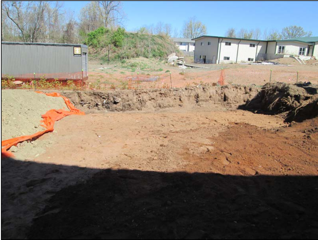
View looking north at excavated back yard.