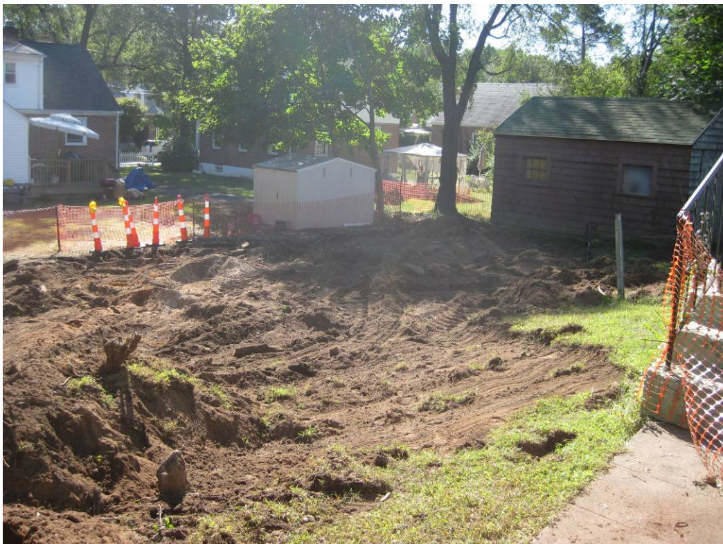
View looking southeast from backyard of 979-981 Winchester Avenue showing extent of excavation.