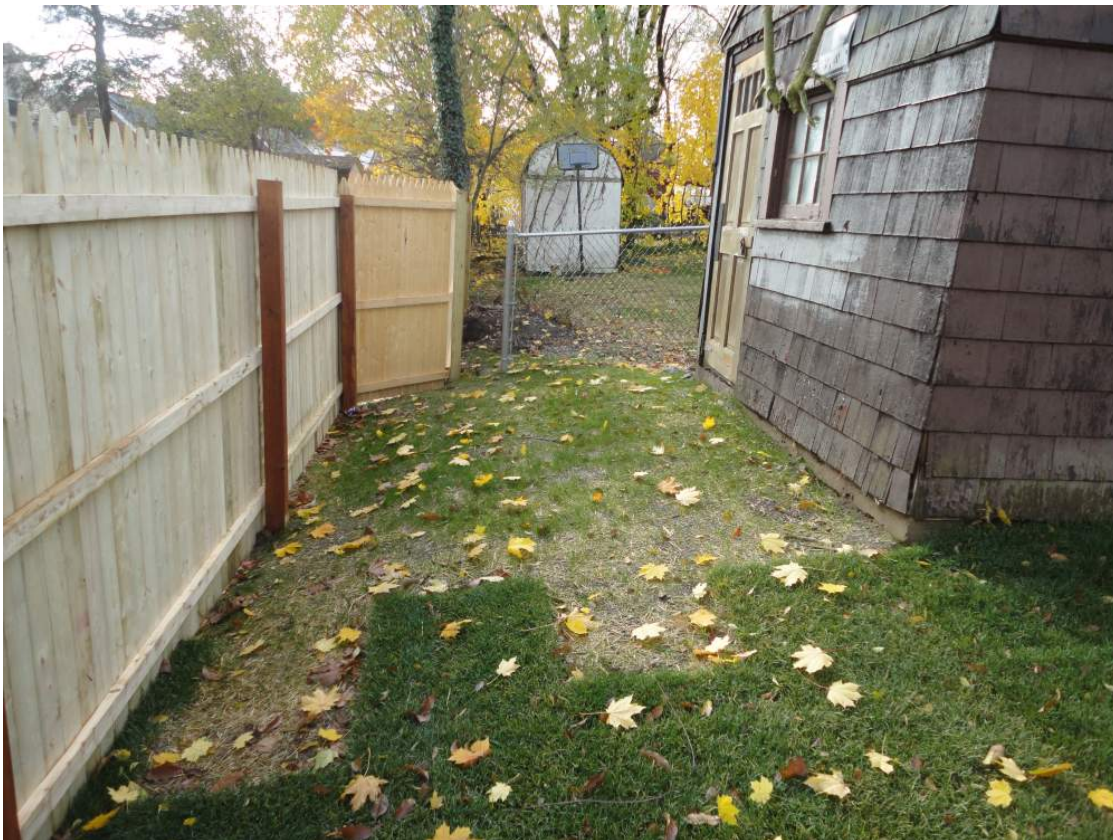
View looking south from backyard of 979-981 Winchester Avenue at newly installed fencing along boundary with 32 North Sheffield Street.