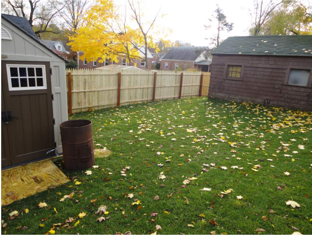
View looking southeast at newly installed fencing along boundary with 32 North Sheffield Street.