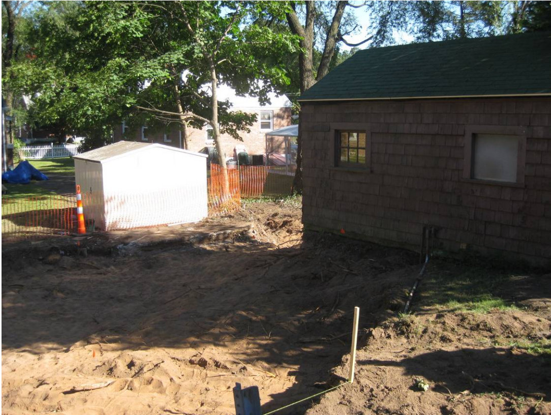
View looking southeast from backyard of 979-981 Winchester Avenue. Excavation on 32 North Sheffield Street was limited to area surrounded by orange fencing between shed and garage on adjacent properties.