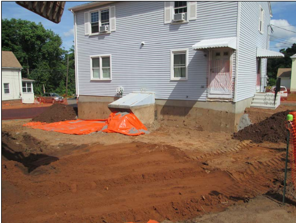
View looking northwest at excavated back yard during placement of marker barrier.