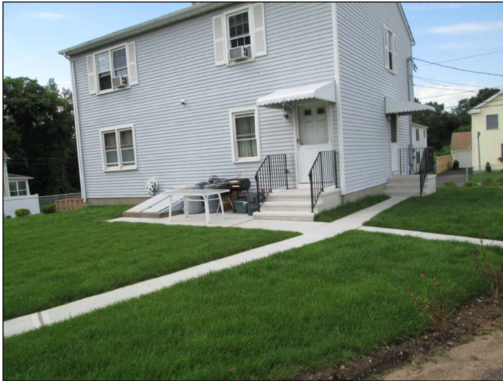
View looking north at partially restored back yard.