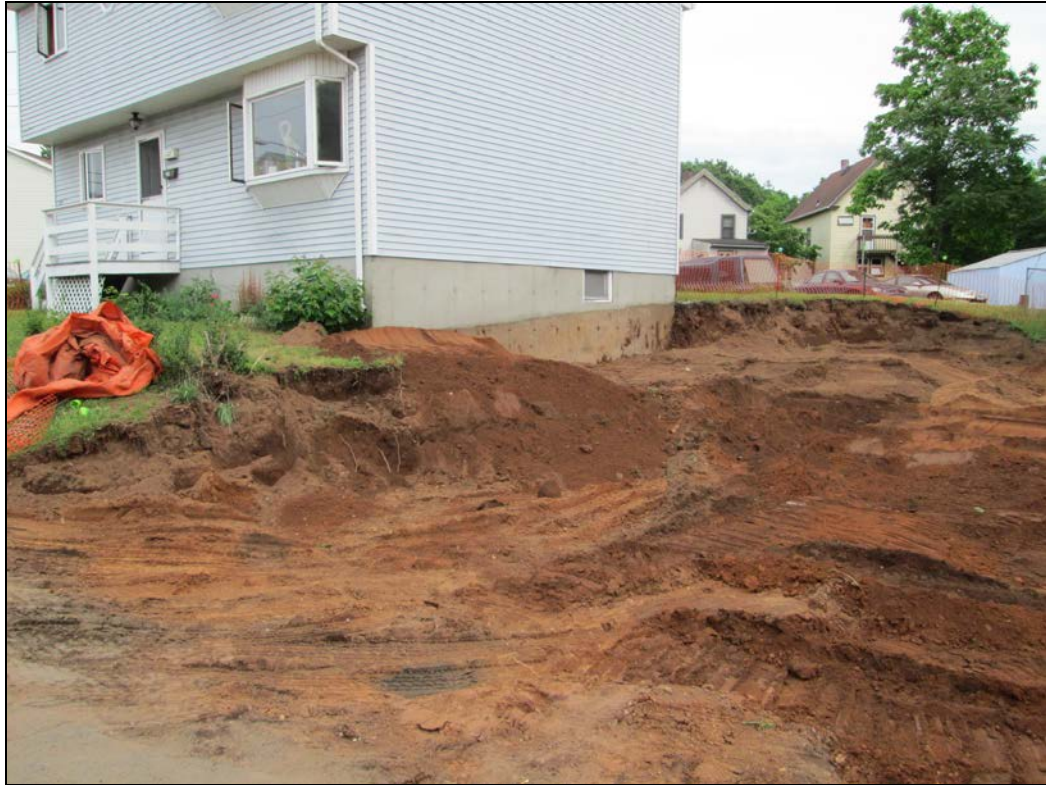
View looking southeast at excavated side yard.