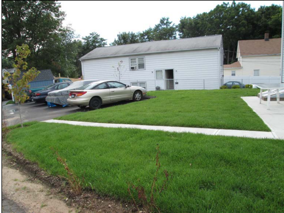
View looking southwest at restored back yard and parking area.