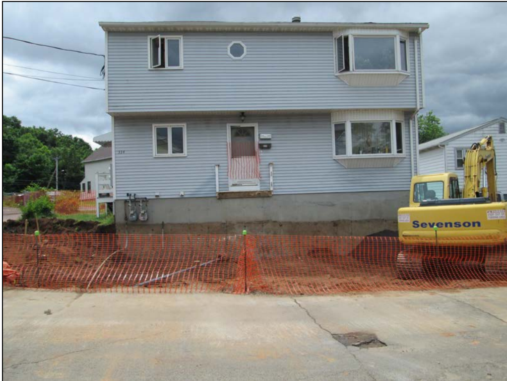
View looking south at excavated front yard.