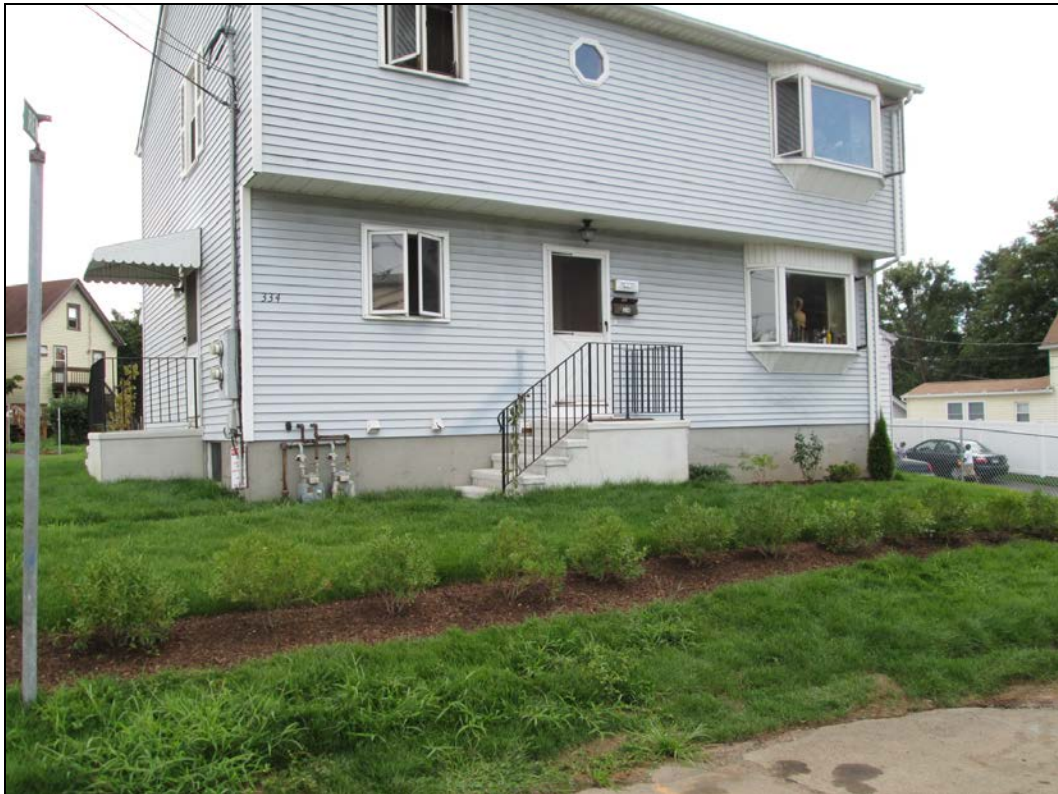
View looking south at restored front yard.