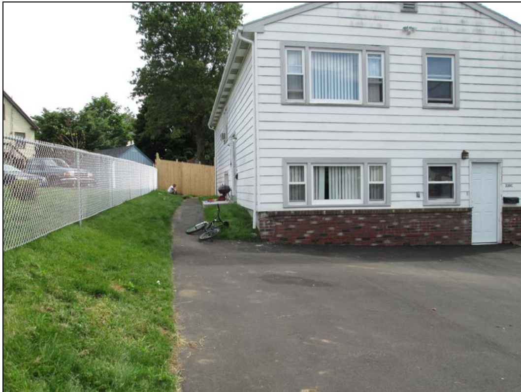
View looking south at restored front yard and parking area.