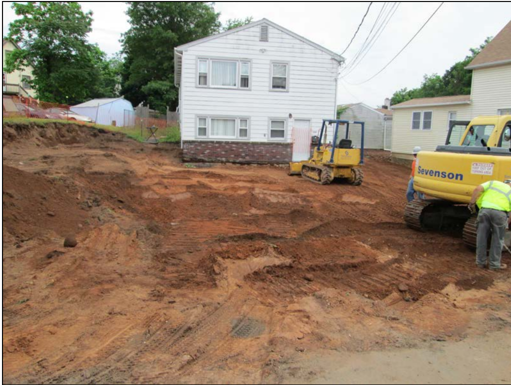
View looking south at excavated front yard.