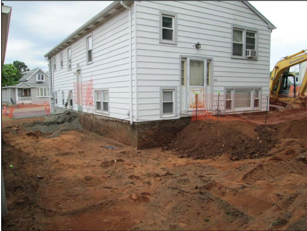
View looking northeast at excavated back and side yards.