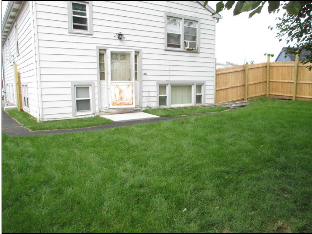
View looking north at restored back yard.