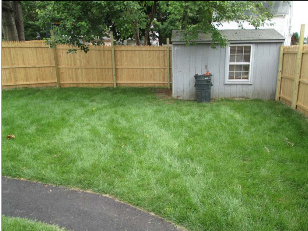
View looking south at restored back yard.