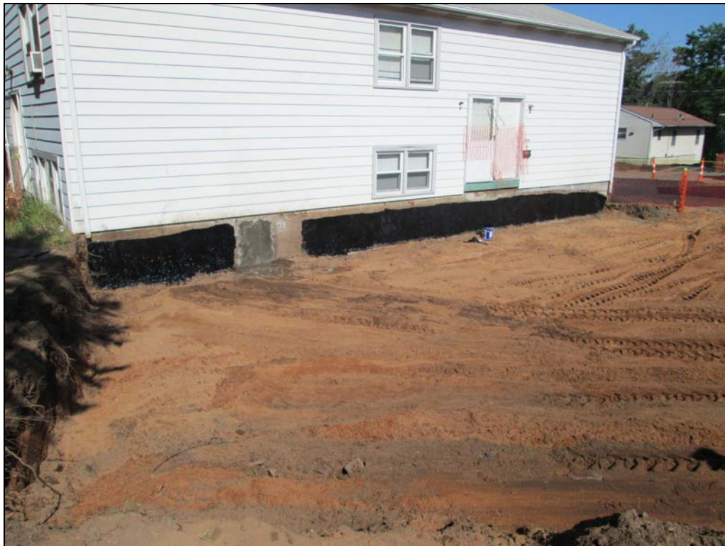
View looking northwest at excavated side yard.