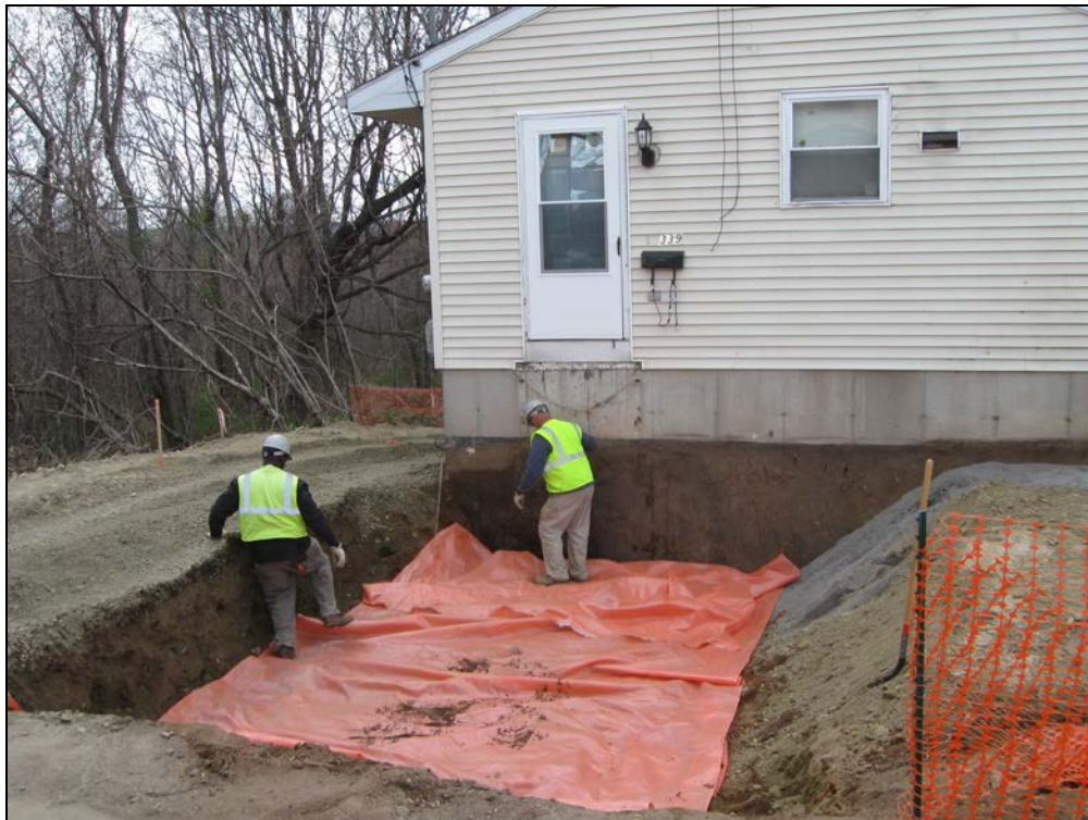
View looking north at excavated front yard with marker barrier being installed.