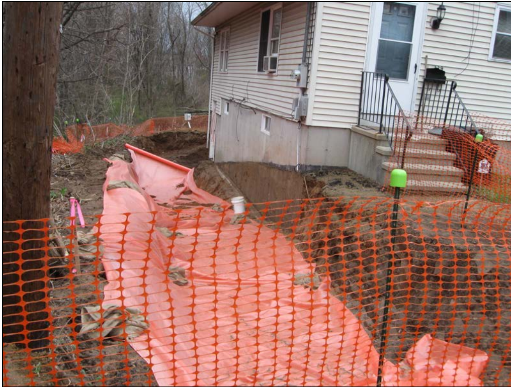
View looking north at excavation of driveway following placement of marker barrier.