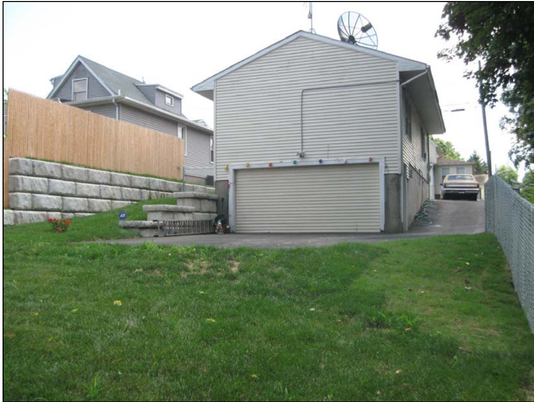
View looking south at restored back yard.