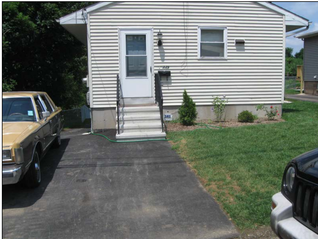
View looking north at restored front yard.