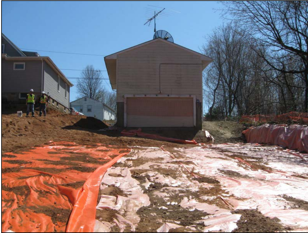
View looking south at marker barrier at the base of excavation.