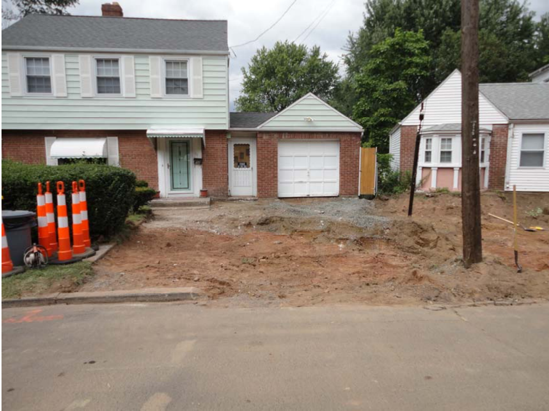
View looking northwest from across Prospect Lane of excavation in the driveway area.