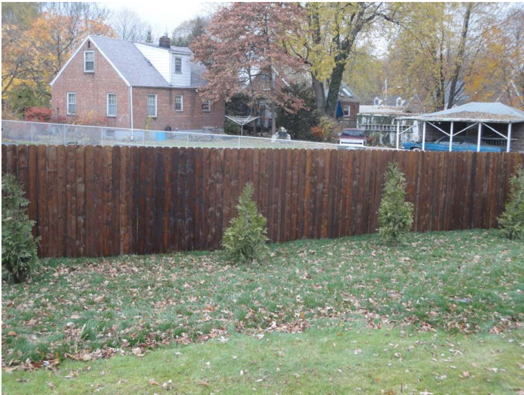
Looking west from backyard, view of restored landscaping and newly-installed fence.