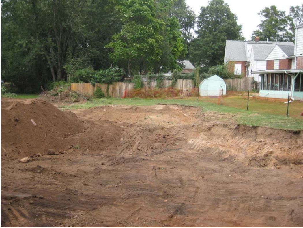
View looking east from adjacent property of extent of excavation in back yard of 34 Prospect Lane.