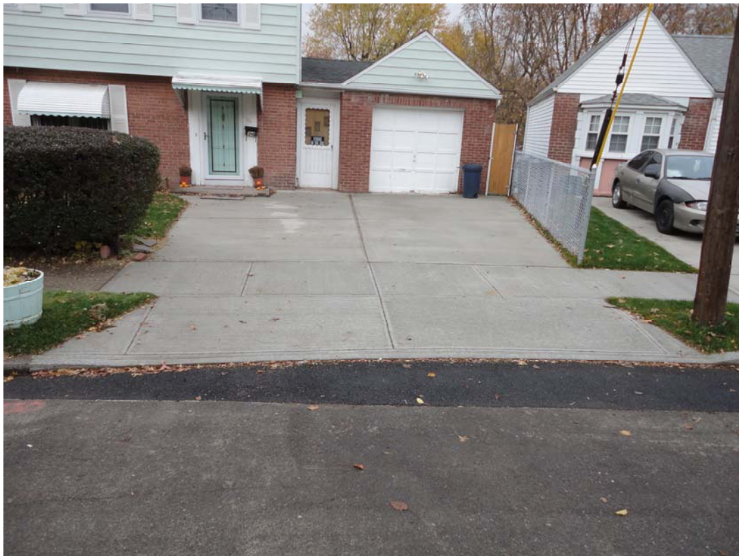
View looking northwest from across Prospect Lane of restored driveway area.