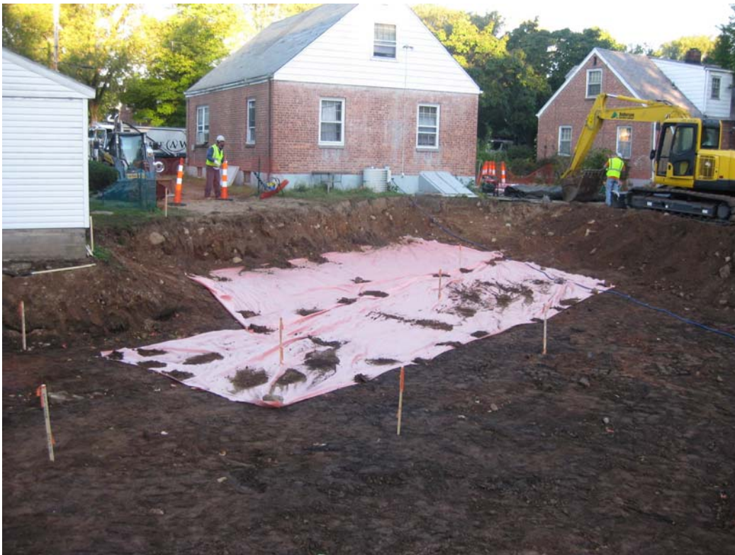
Looking west from adjacent property, view of excavation following placement of marker barrier.