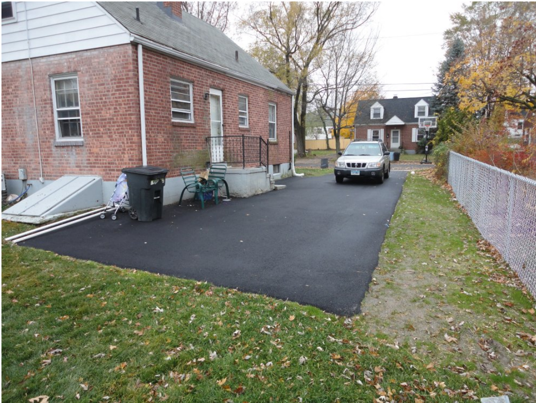
Looking west from back yard, view of restored driveway area.