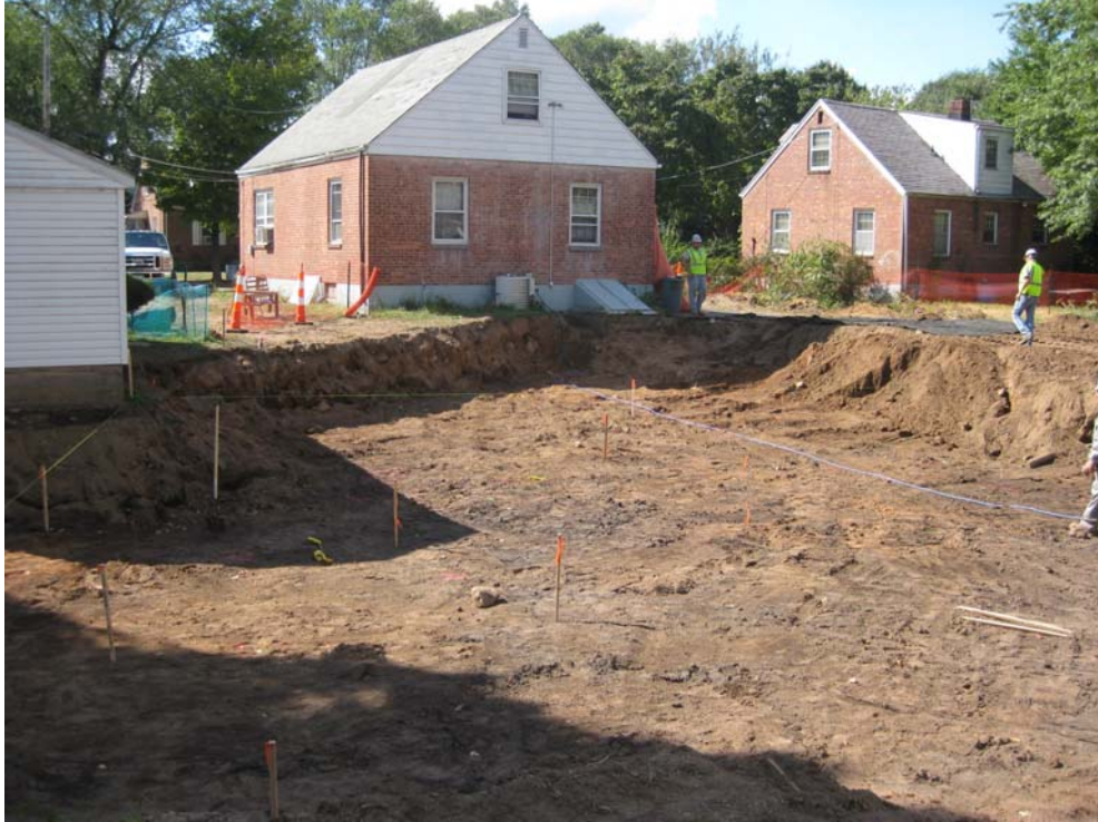
Looking west from adjacent property, view of excavation in back yard.