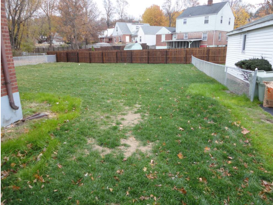
Looking northeast from south side of house, view of restored property and newly-installed sod.