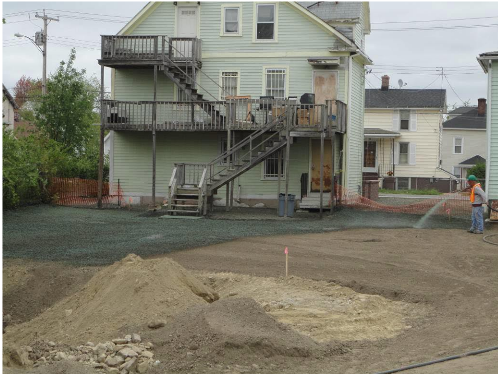
View looking East at partially restored yard