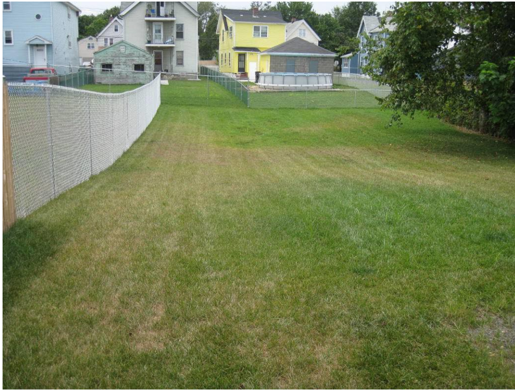
View looking South at restored lawn