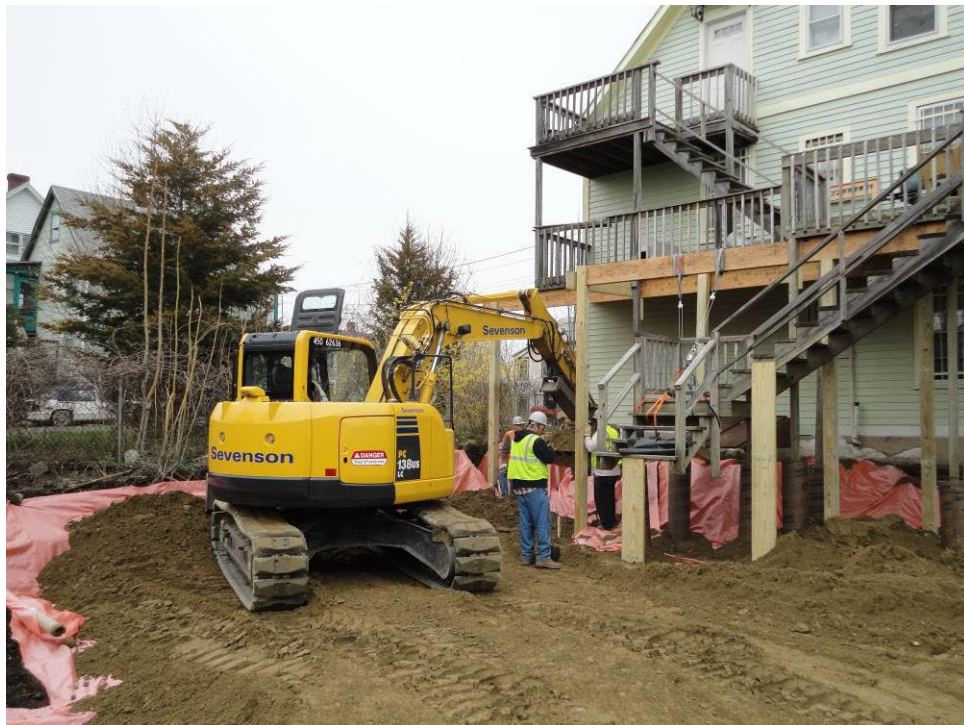
View looking Northeast at partially backfilled property as work is completed around braced stairway to 2 nd and 3 rd floors