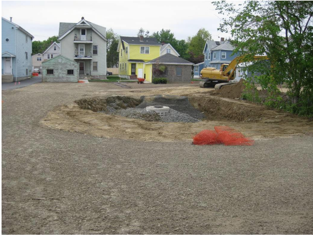
View looking West during installation of drywell in backyard