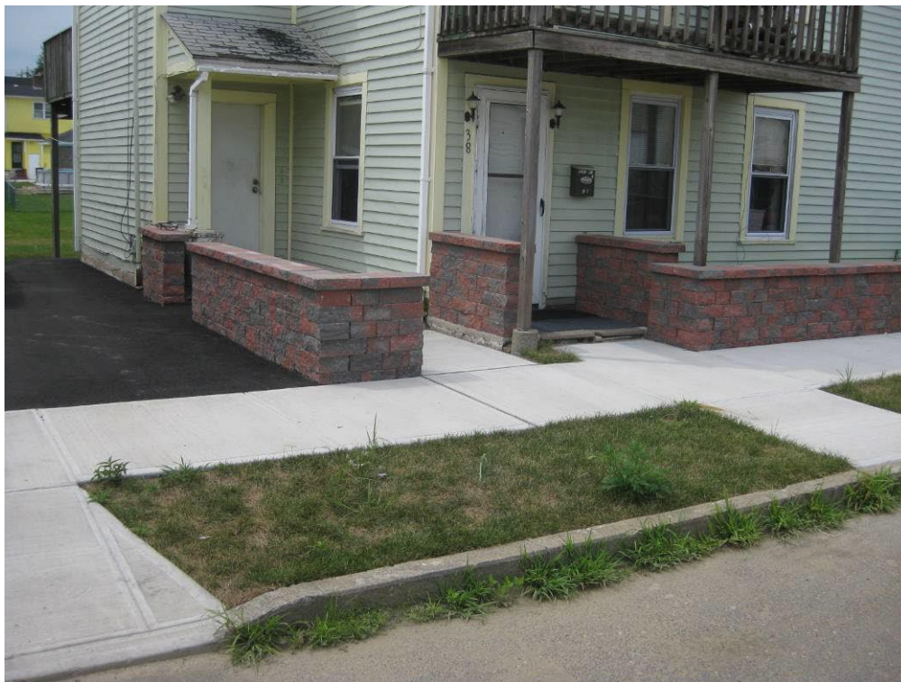
View looking Northwest at restored driveway and sidewalk