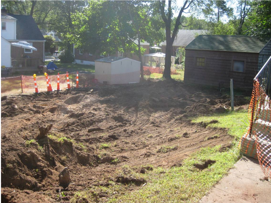
View looking southeast from backyard of 979-981 Winchester Avenue. Excavation on 38 North Sheffield Street was limited to the area lined with orange construction fencing and cones.