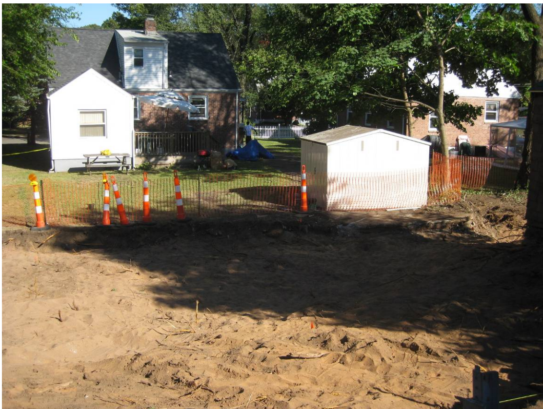
View looking east at extent of excavation on 38 North Sheffield Street.