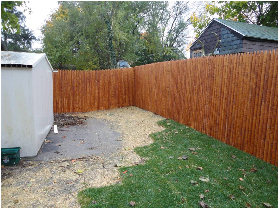
View looking southwest from backyard of 38 North Sheffield Street at newly installed fence and sod.