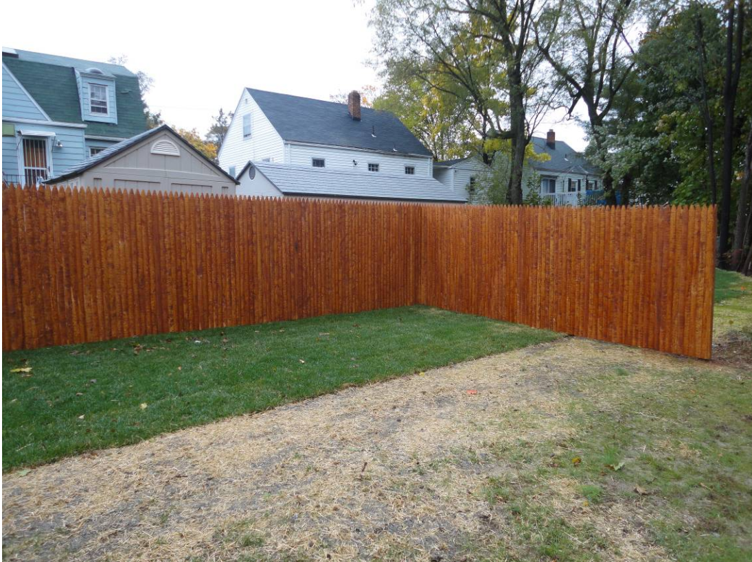
View looking northwest from backyard of 38 North Sheffield Street at newly installed fence and sod.