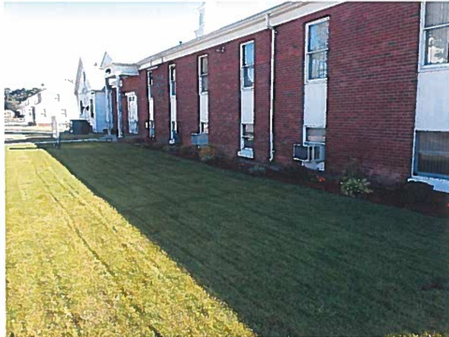
View of Plantings and Landscaping in Front of Church during the Fall 2014 Inspection