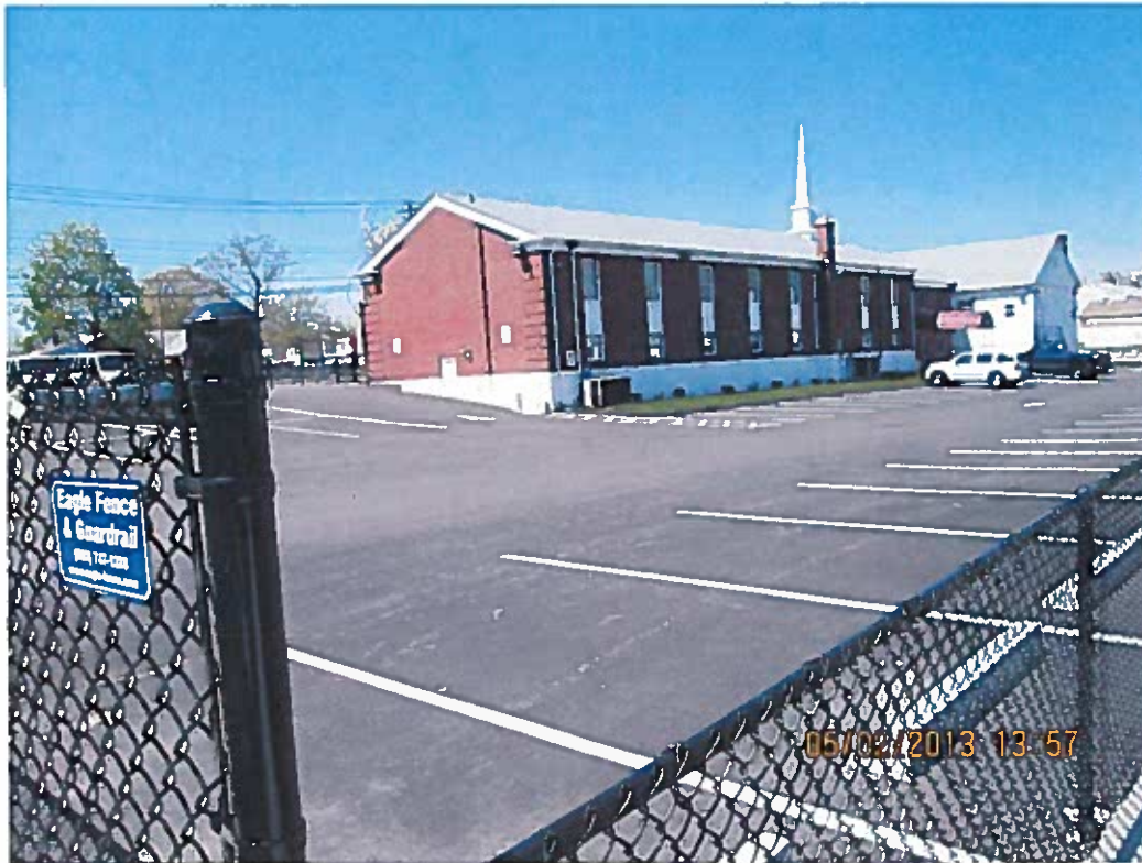
View of back of Church Parking Lot during the Spring 2013 Inspection