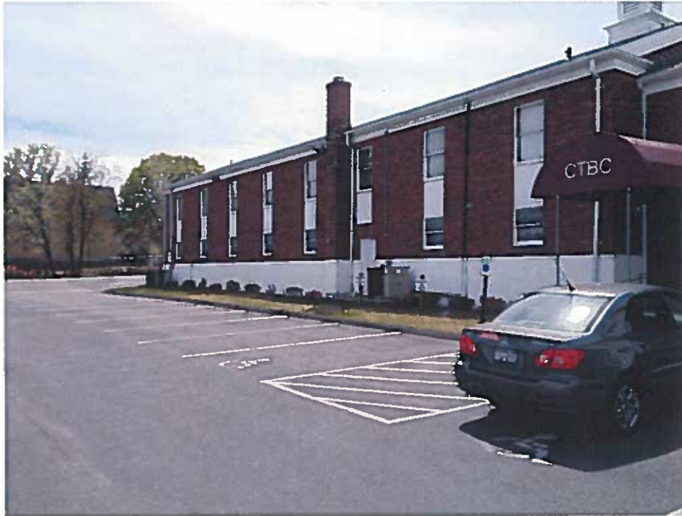
View of Plantings and Parking Area Behind Church during the Spring 2014 Inspection