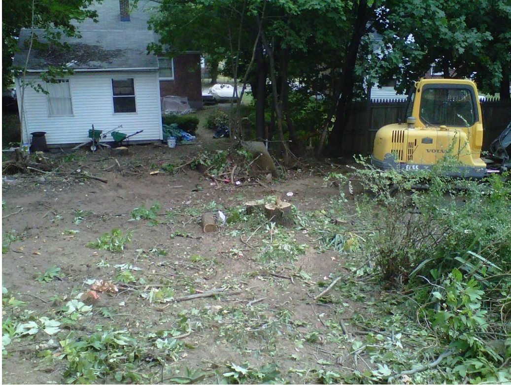
View looking east from backyard of 985 Winchester Avenue at tree removal along property boundary with 44 North Sheffield Street.