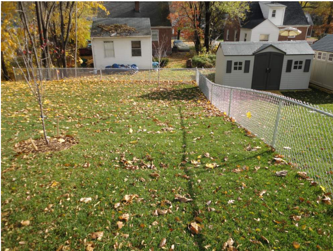
View looking east from backyard of 985 Winchester Avenue at completed restoration activities on 44 North Sheffield Street.