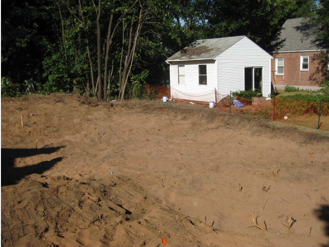
View looking northeast from 979-981 Winchester Ave showing extent of excavation on 44 North Sheffield Street.