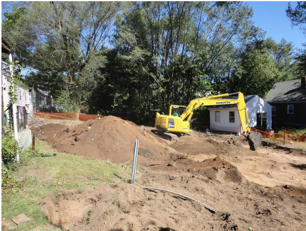
View looking northeast from 979-981 Winchester Ave at excavation extending onto 44 North Sheffield Street.