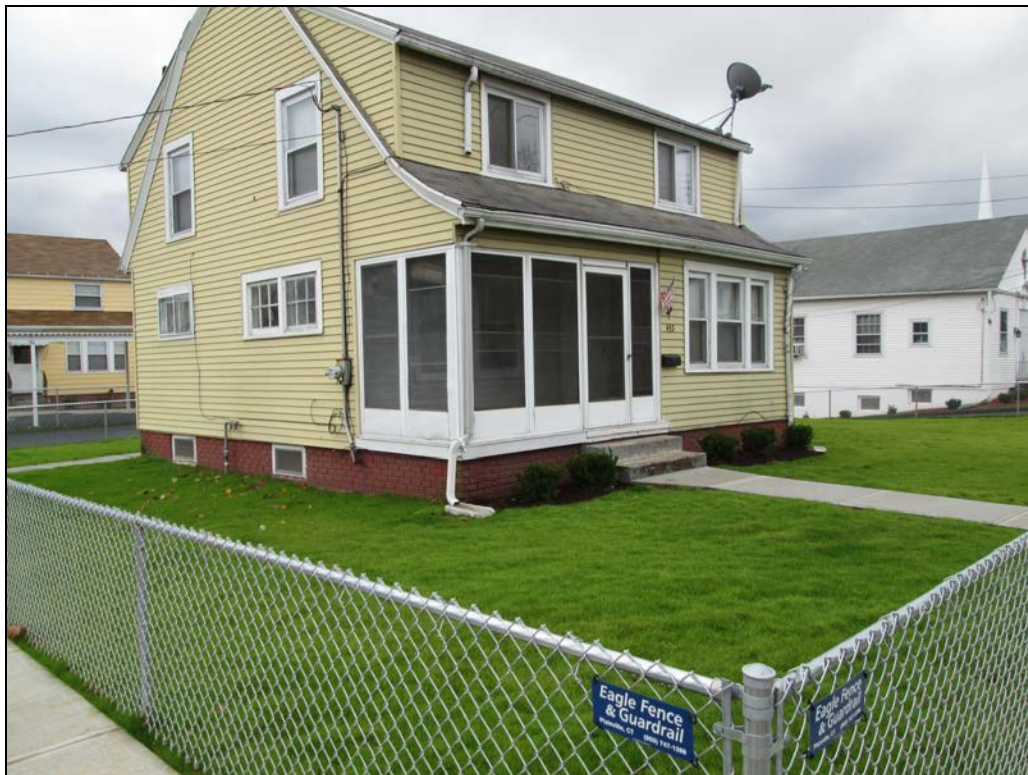
View looking southeast at restored yard.