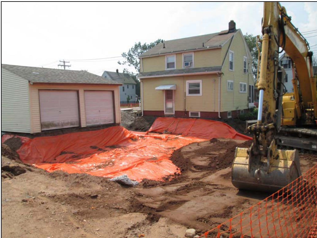
View looking west at excavated back yard during placement of marker barrier.