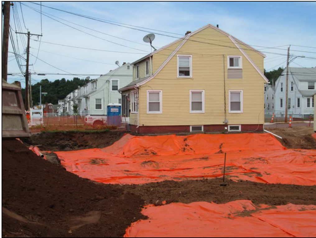
View looking north at excavated side yard.