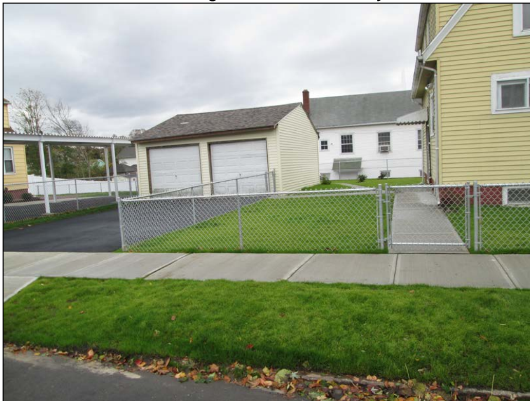
View looking south at back yard.