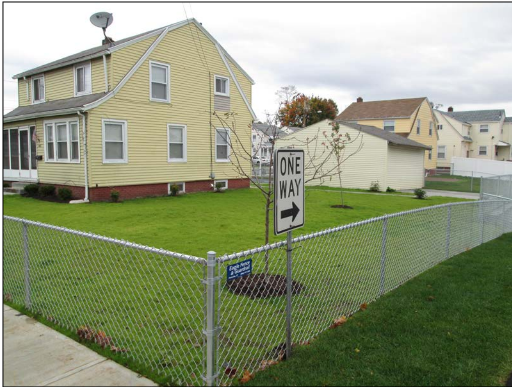
View looking northeast at restored yard.