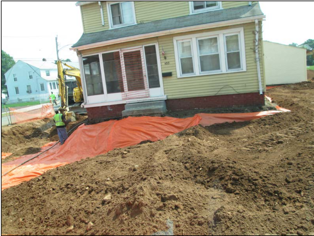
View looking east at partially backfilled front yard.