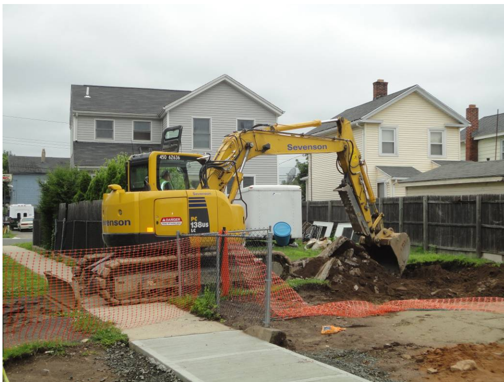
View looking West at excavated back yard