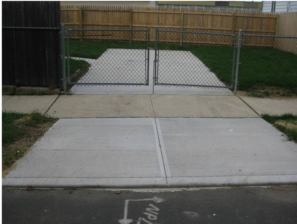
View looking North at restored driveway