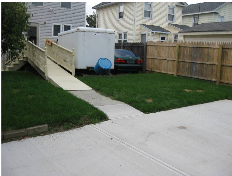
View looking South at restored back yard