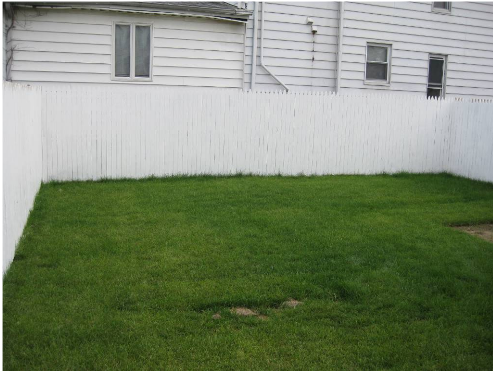
View looking East at partially restored lawn and fencing