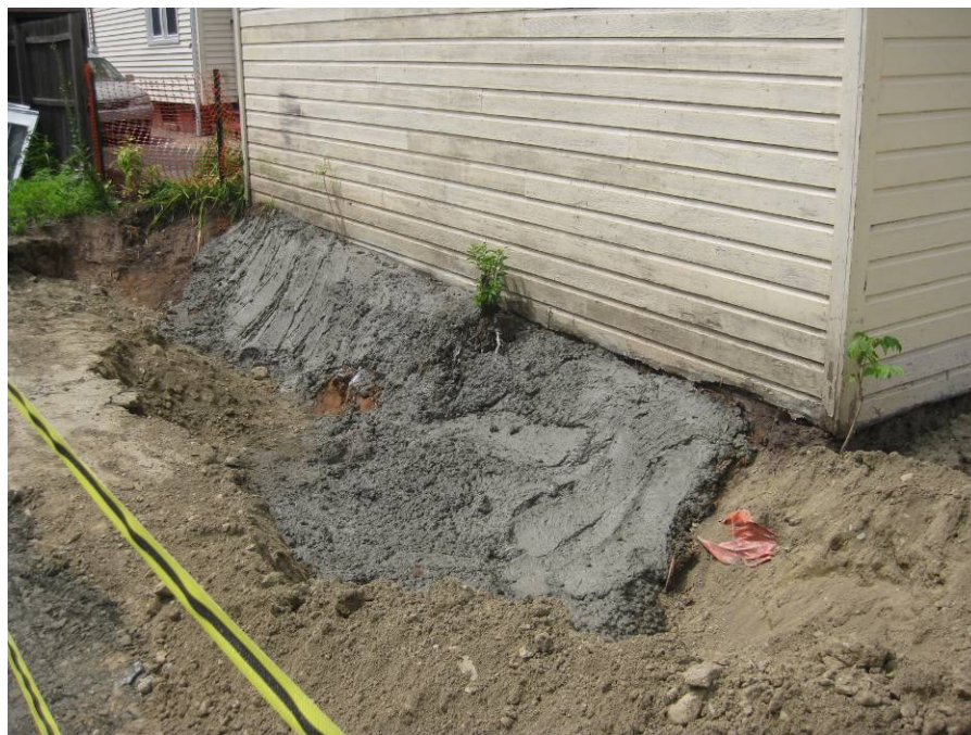
View looking Northwest excavation along south side of garage following placement of marker barrier