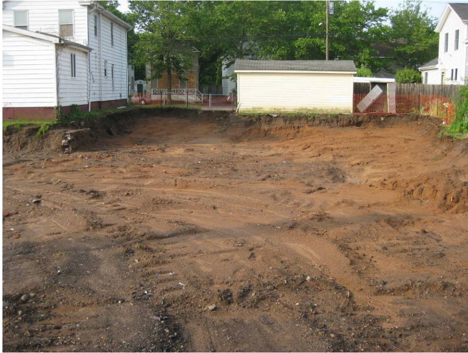
View looking South at back yard excavation area from the adjacent property