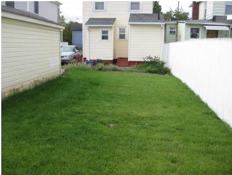
View looking West at partially restored back yard