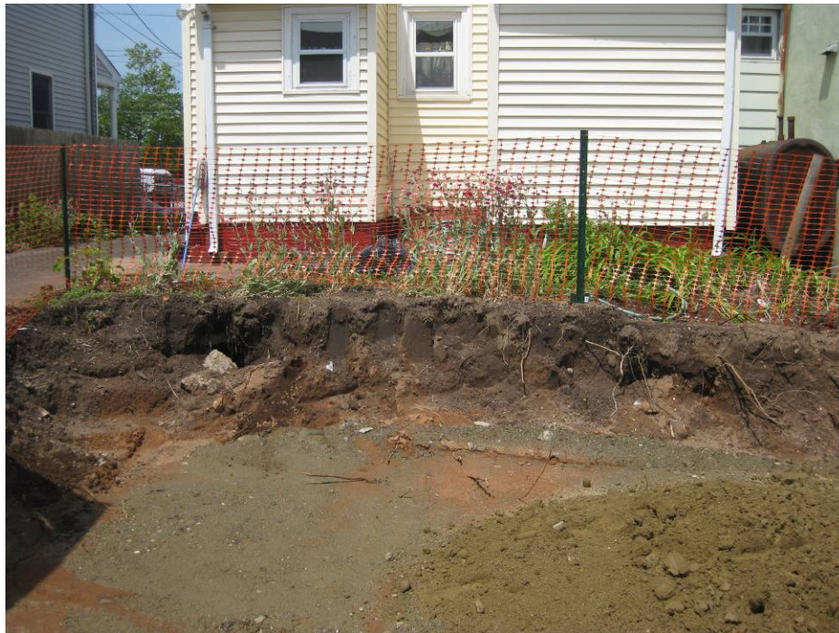
View looking West at excavation area behind house