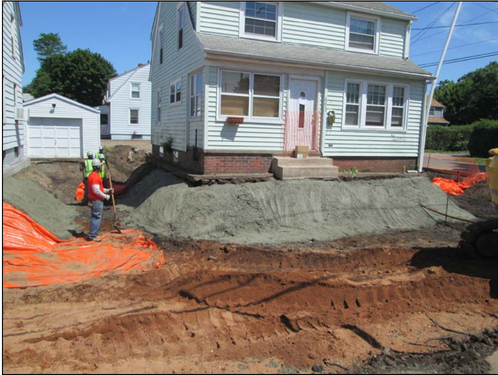
View looking east at excavated front yard.