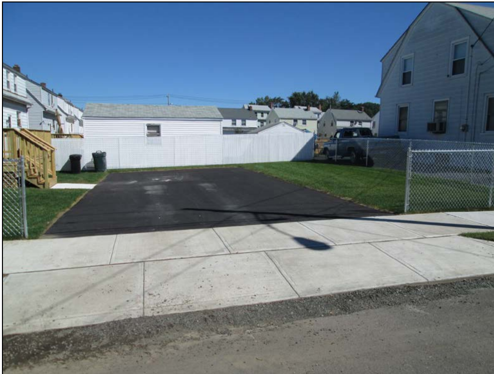
View looking north at restored driveway.