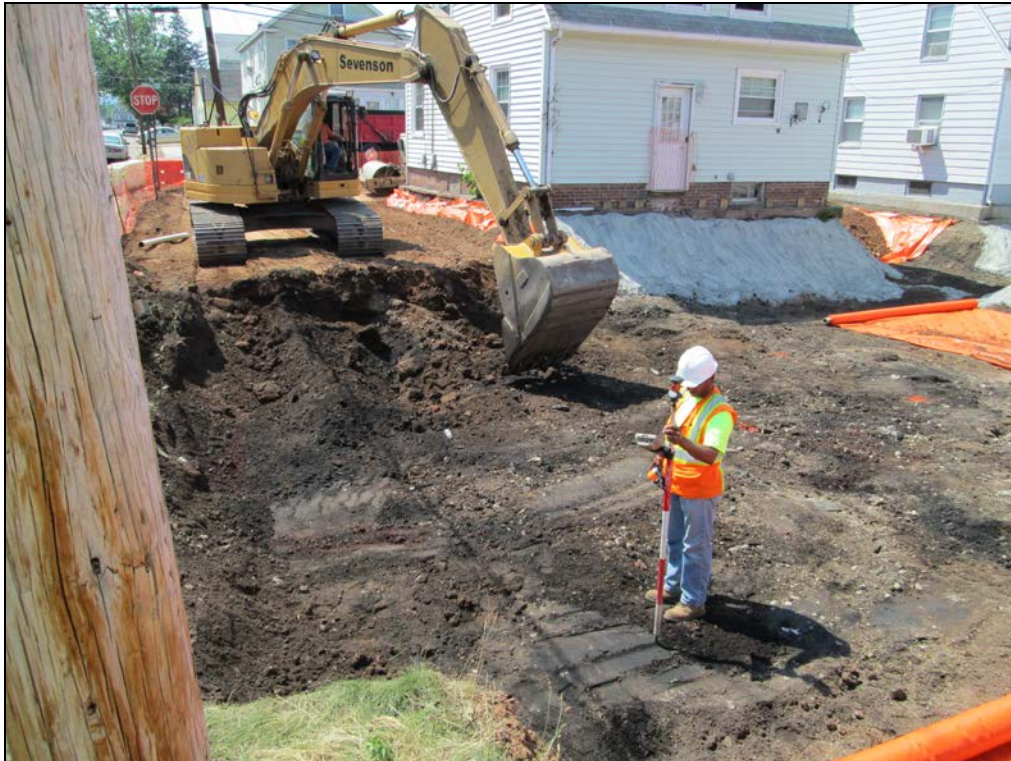
View looking northwest at excavated back yard.