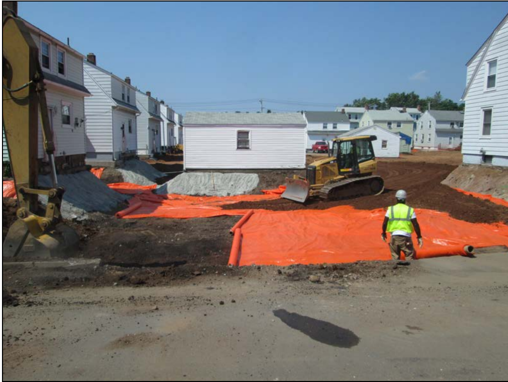
View looking north at excavated driveway area.