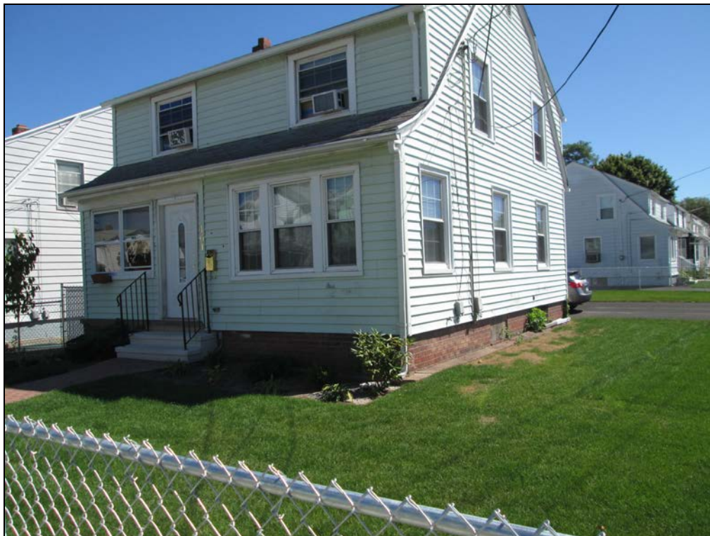
View looking northeast at restored side yard.