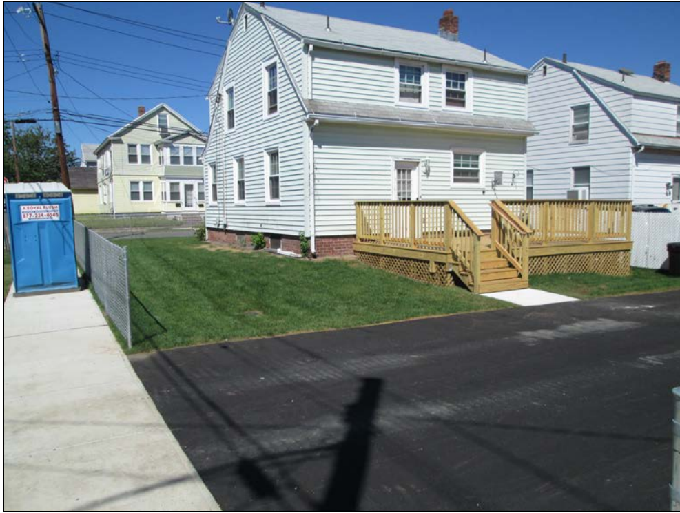
View looking west at restored back yard.