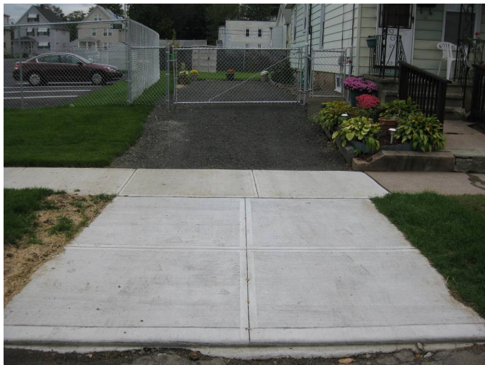
View looking East at restored driveway