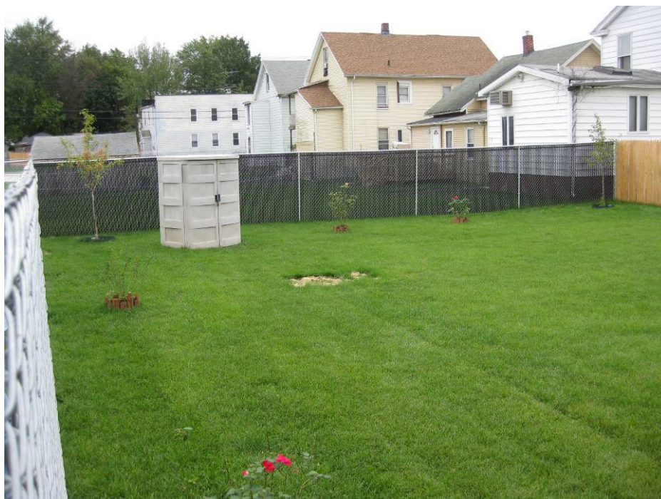
View looking East at restored back yard