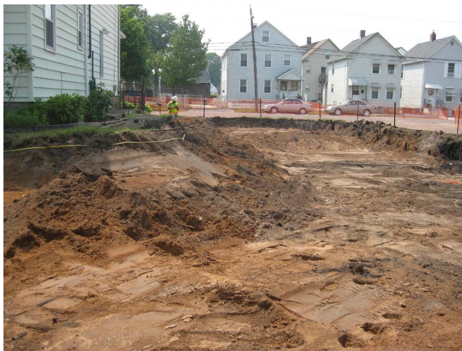
View looking West at excavated side yard and driveway area