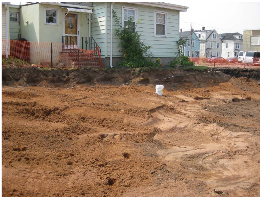
View looking Northwest at excavated back yard