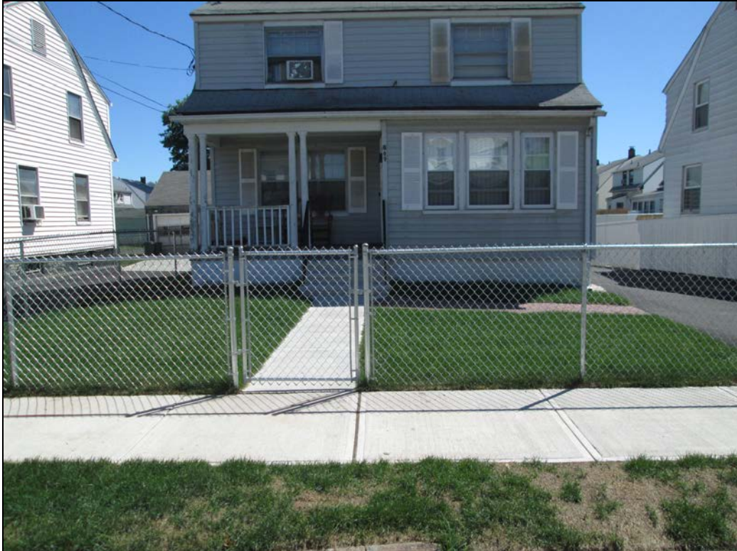
View looking east at restored front yard.