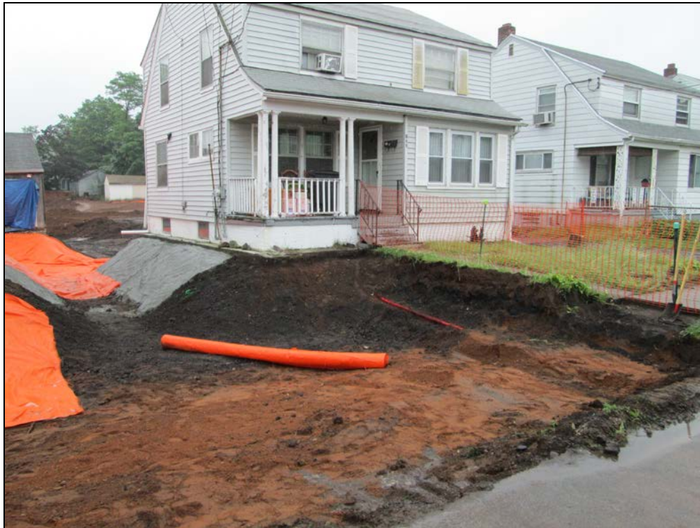
View looking southeast at excavated front yard.