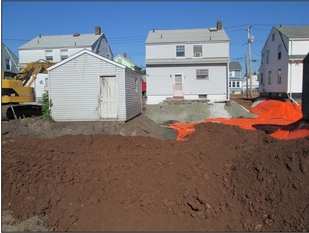
View looking west at partially backfilled back yard.