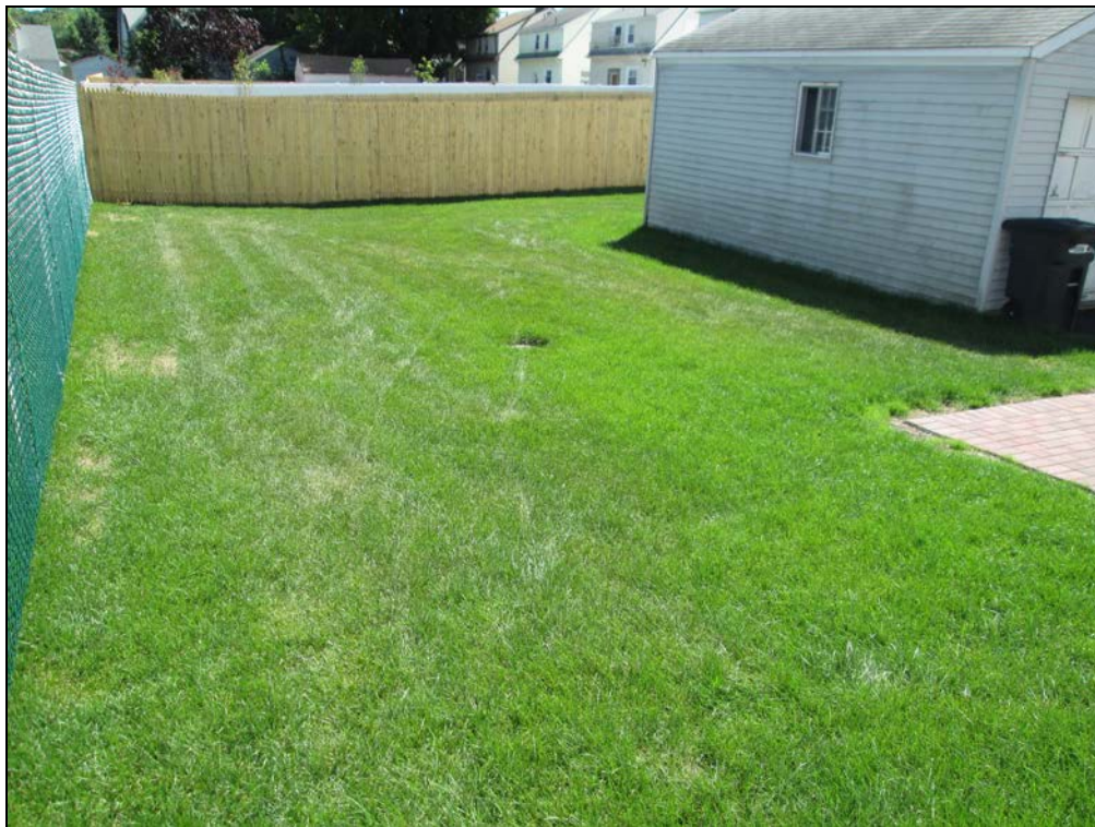
View looking east at restored back yard.