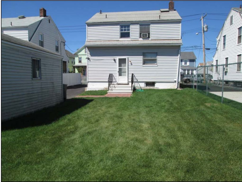
View looking west at restored back yard.