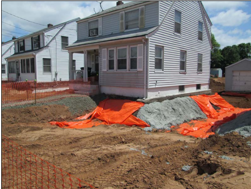
View looking northeast at excavated front yard.