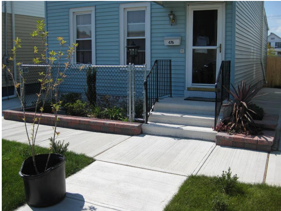
View looking West at partially restored front yard