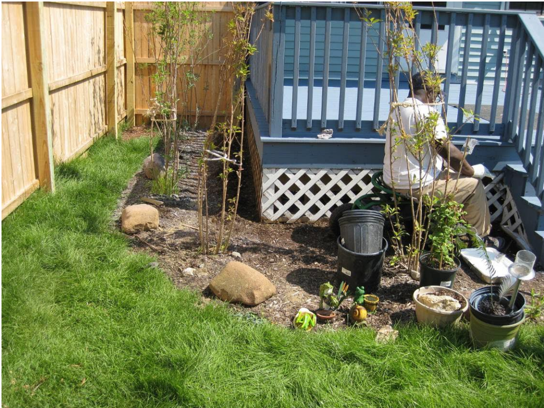
View looking East at restored rear of house