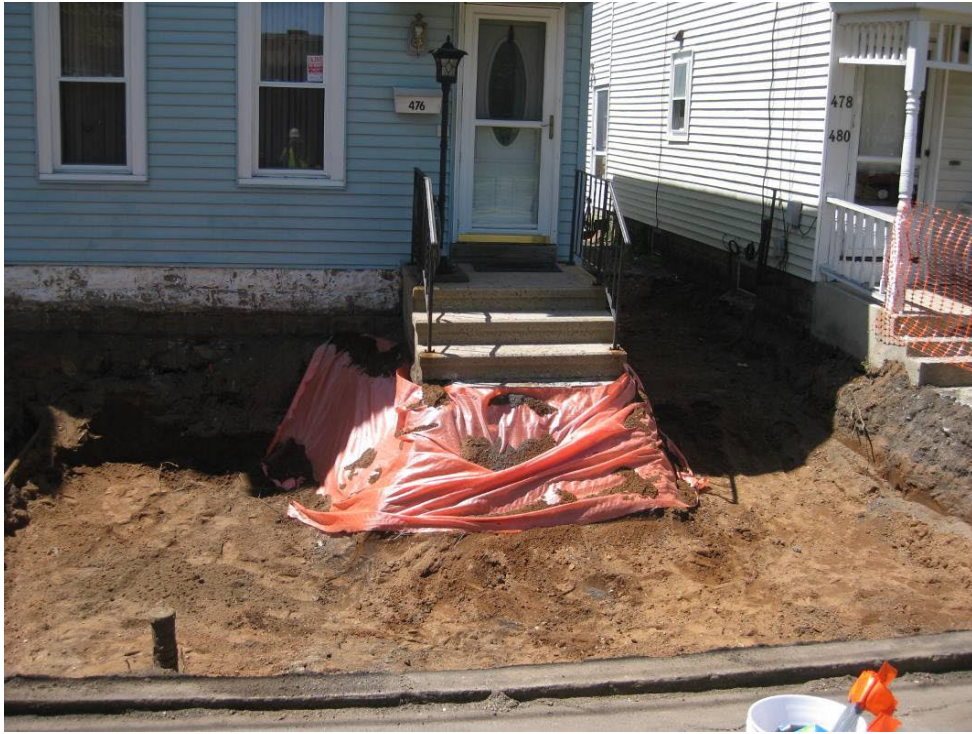
View looking West at excavated front yard following placement of marker barrier around front steps