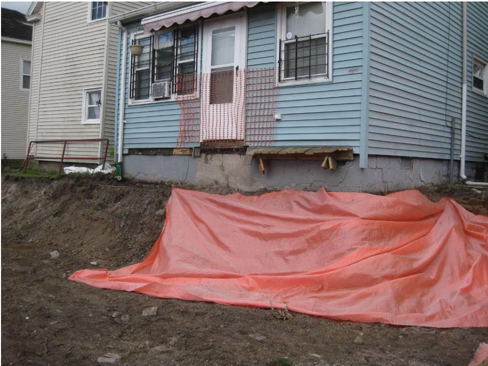
View looking East at excavated back yard following placement of marker barrier under former deck