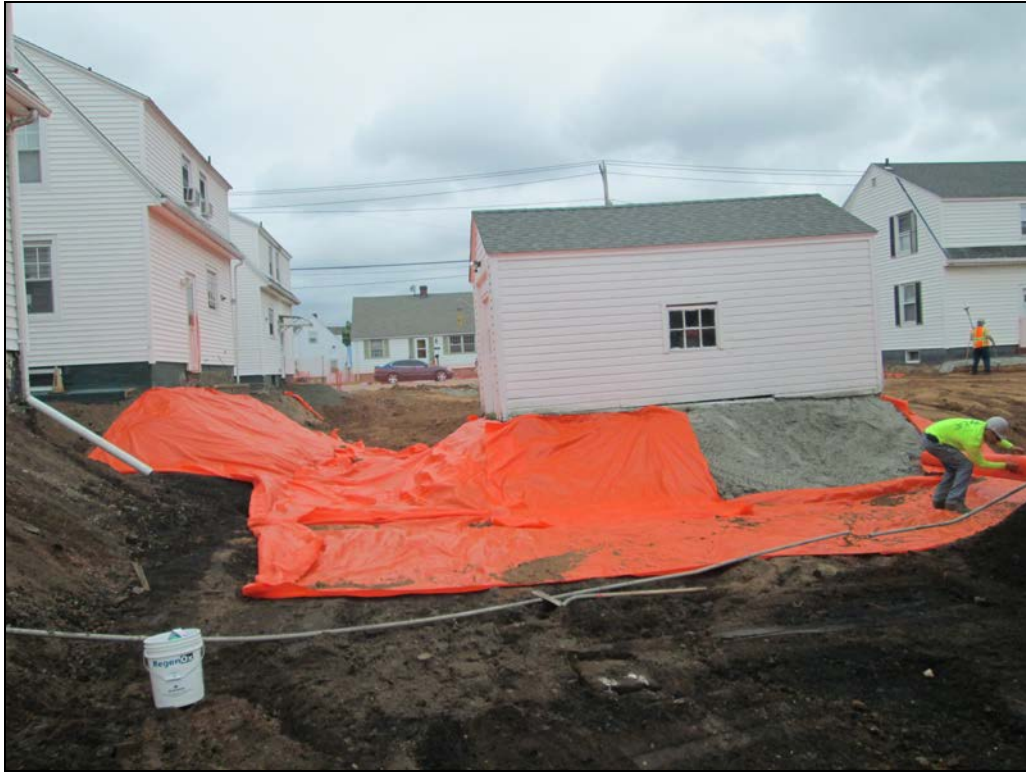
View looking north at excavated back yard.