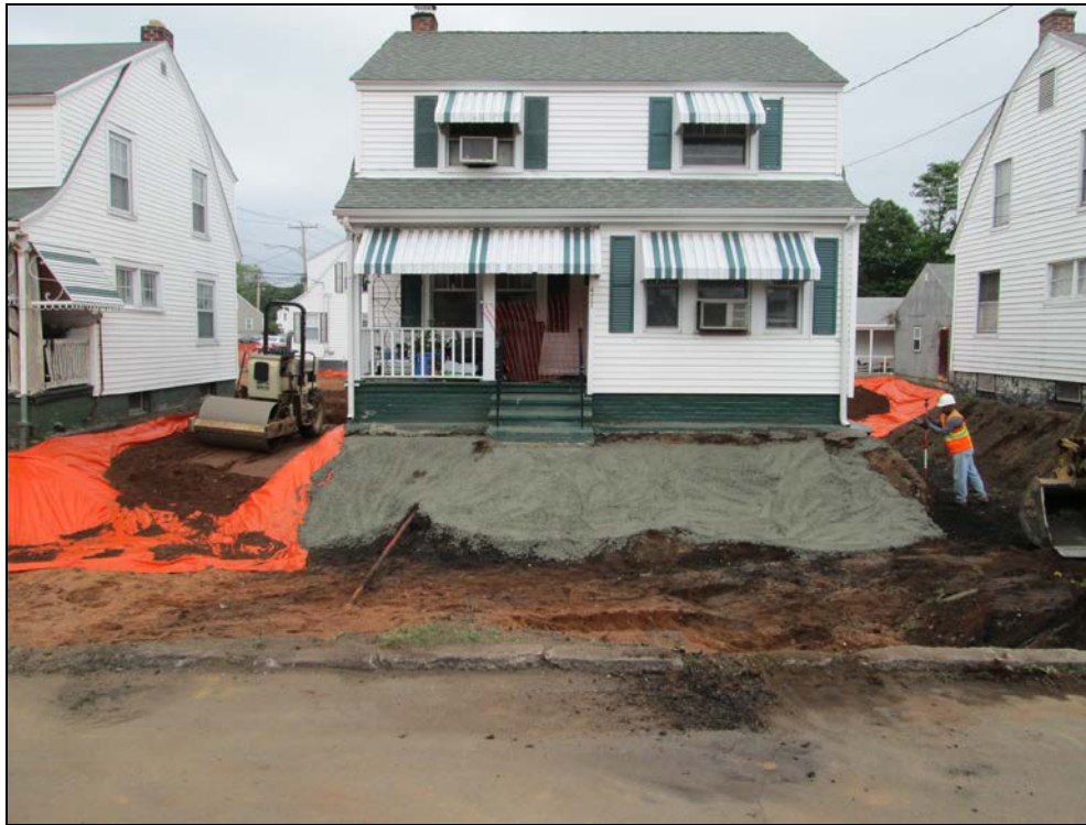
View looking east at excavated front yard.