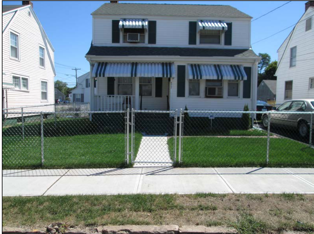
View looking east at restored front yard.