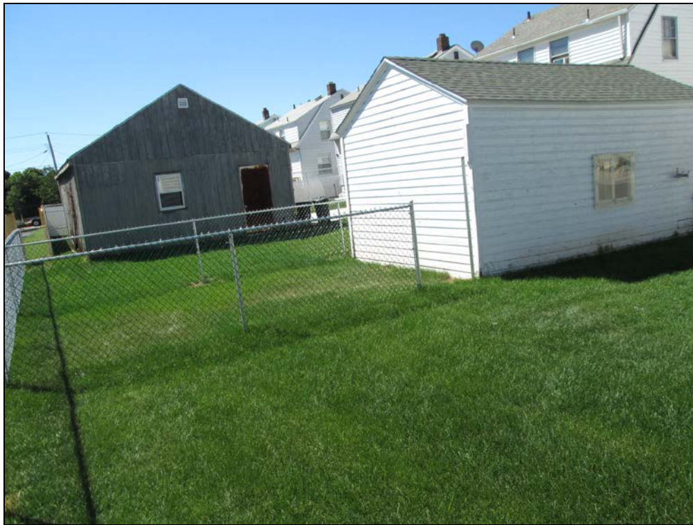
View looking southwest at restored back yard.