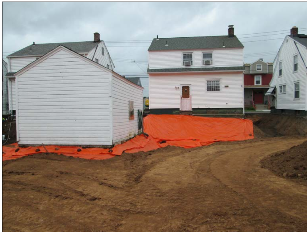
View looking southwest at partially backfilled back yard.