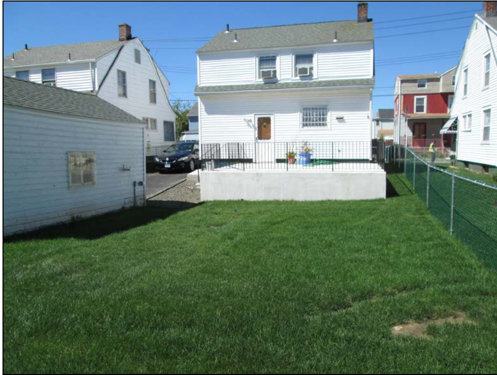
View looking west at restored back yard.