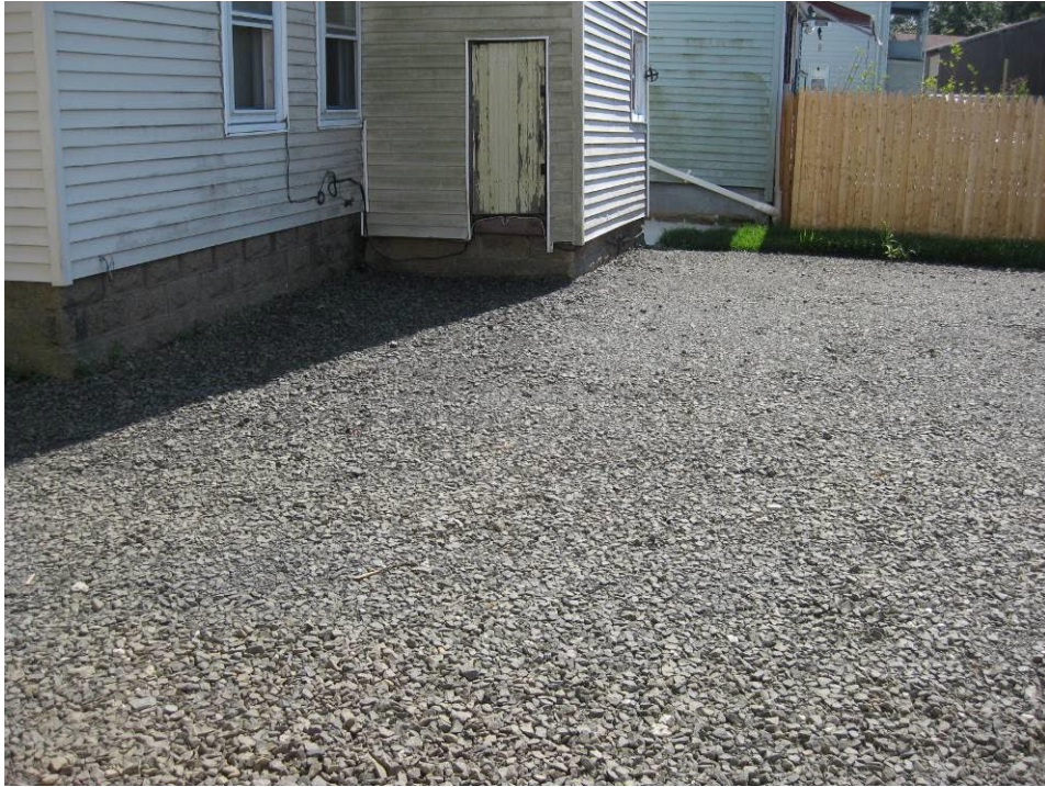
View looking South at restored parking area behind house