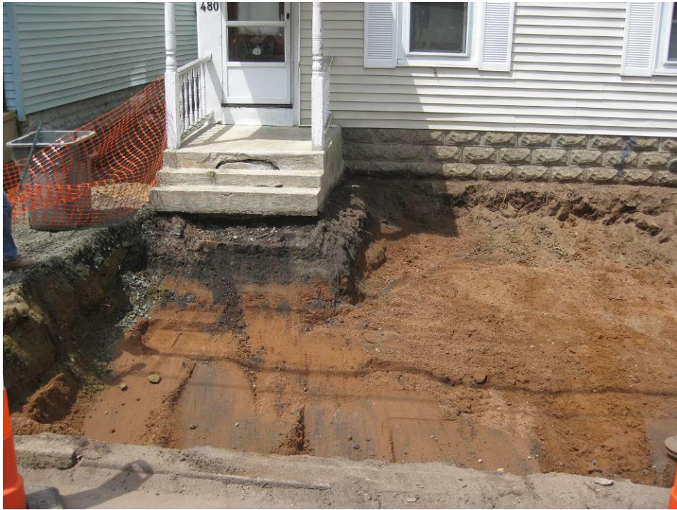
View looking West at excavated front yard