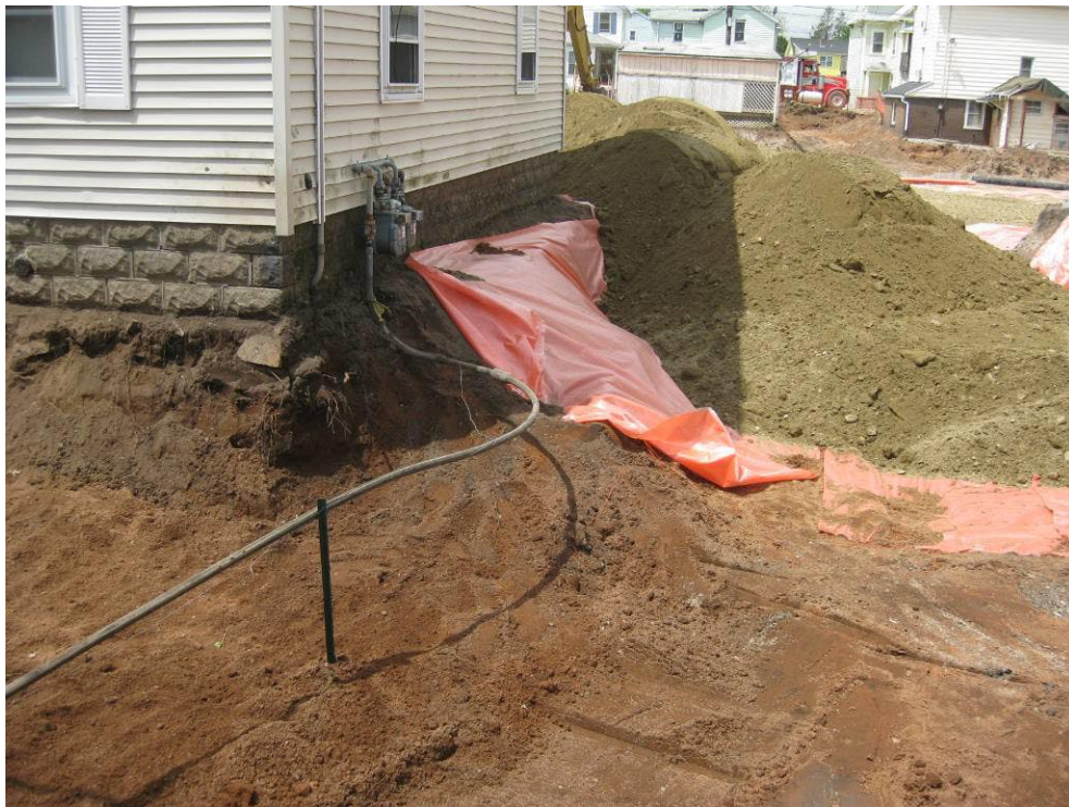
View looking Northeast at excavated side yard during placement of marker barrier