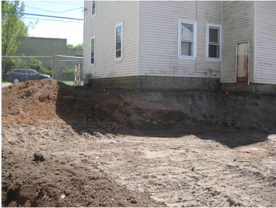
View looking Southeast at excavated back yard of house