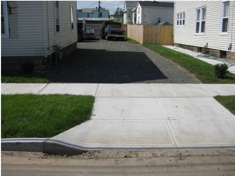
View looking West at restored driveway