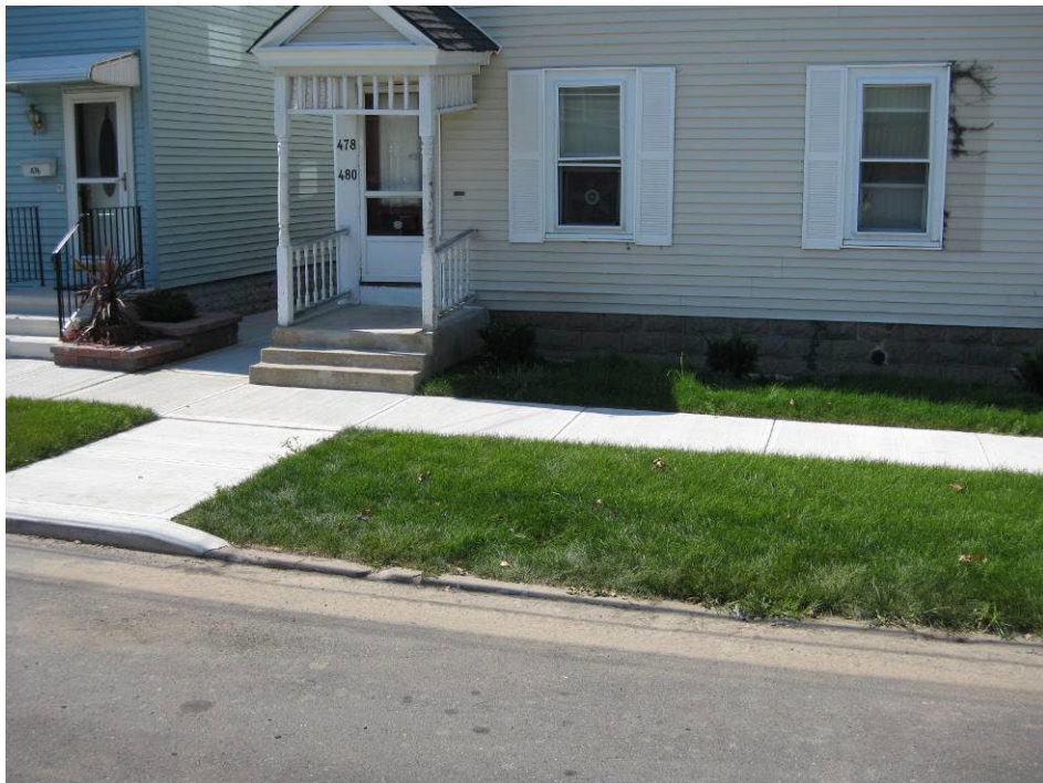
View looking West at restored front yard