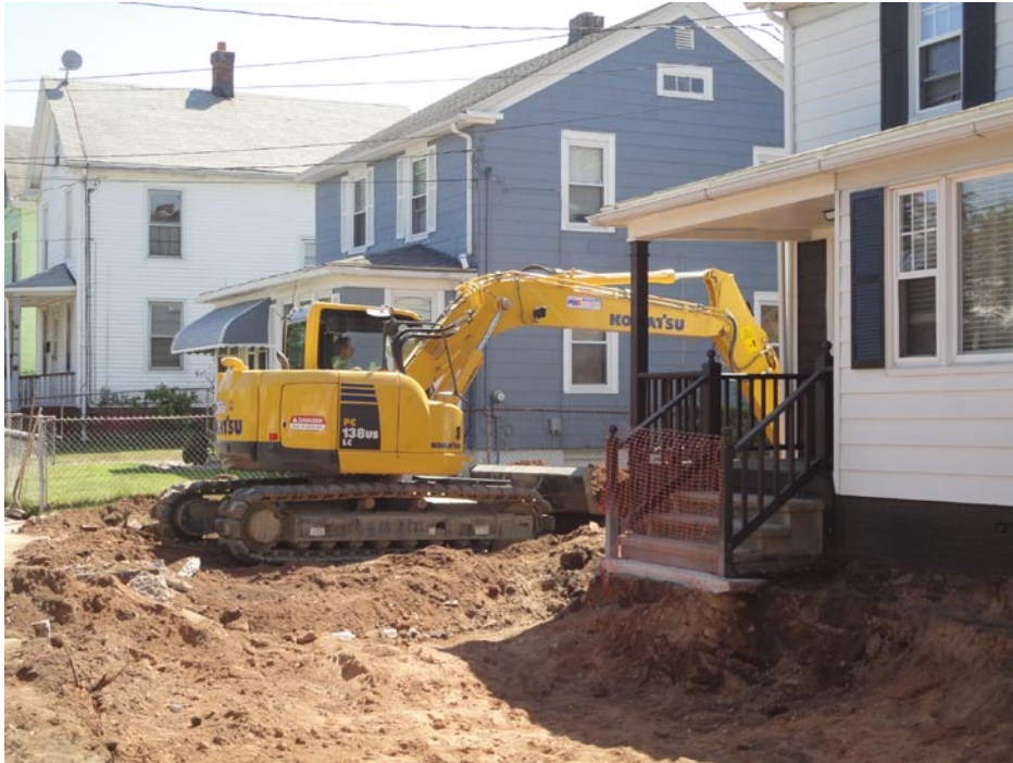
View looking Southwest at excavation in front and side yards