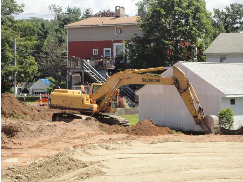
View looking east at excavation in side yard with view of 484-486 Newhall in background