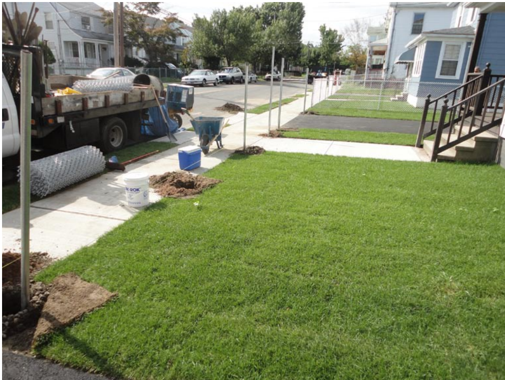
View looking South at front yard during restoration and installation of new fencing