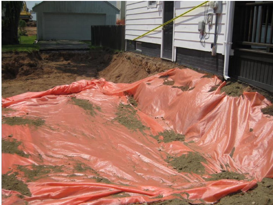
View looking West at excavation in driveway area following placement of marker barrier