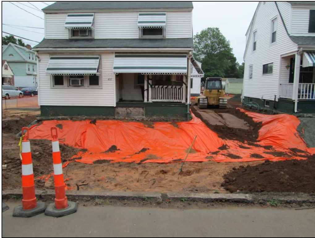
View looking east at excavated front yard.