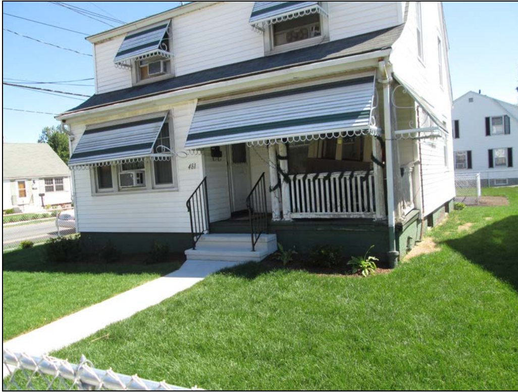
View looking east at restored front yard.