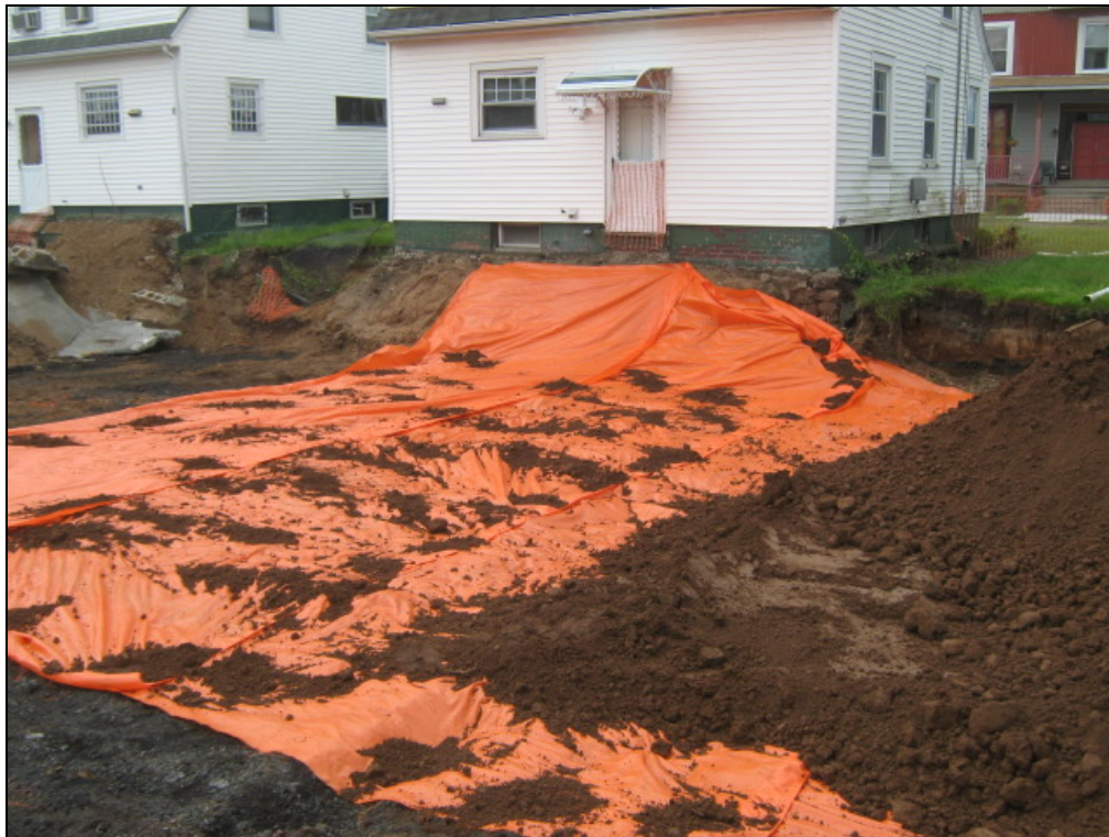
View looking southwest at excavated back yard.