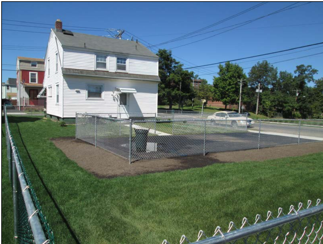
View looking west at restored back yard.