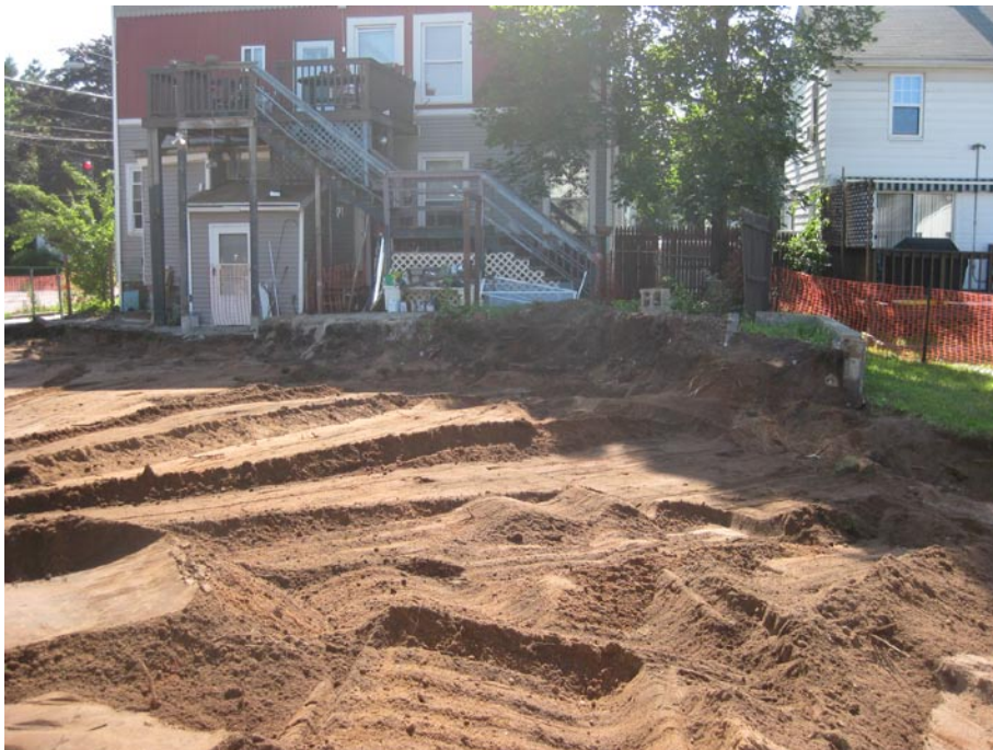
View looking East at excavation area behind house