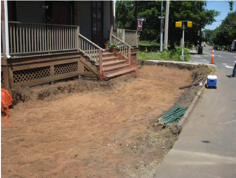
View looking North at excavation area in front of house