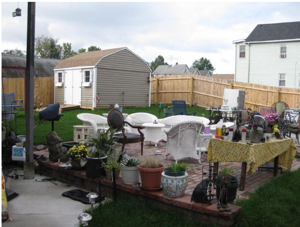
View looking Southwest at restored back yard