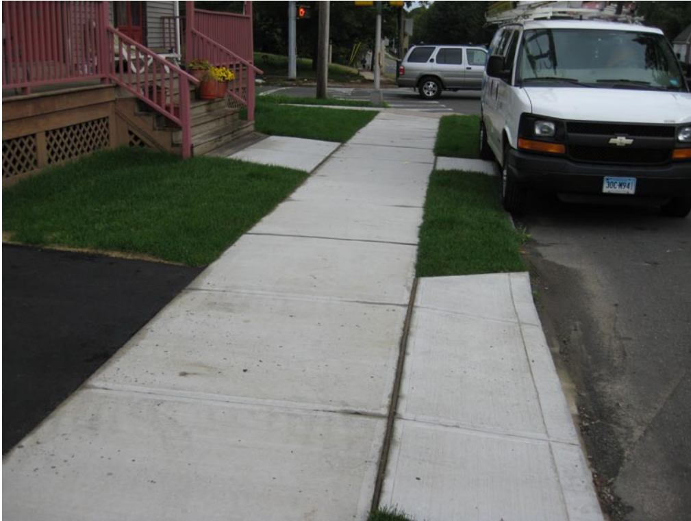
View looking North at restored sidewalk