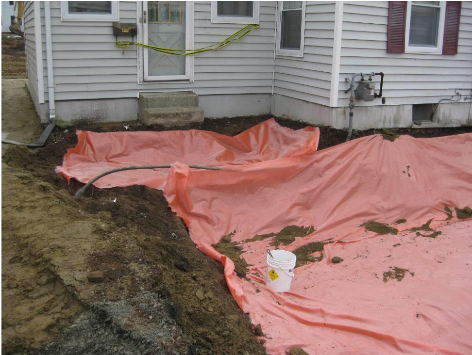
View looking West at excavated front yard during placement of marker barrier