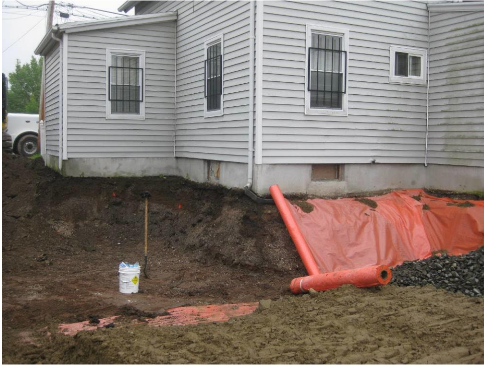
View looking East at excavated back yard