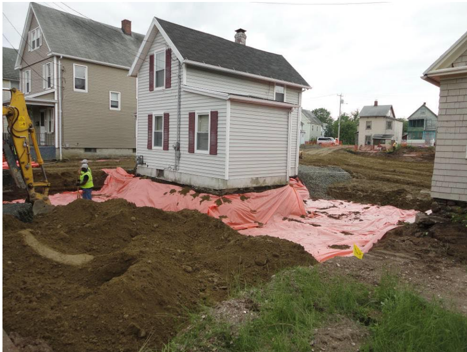
View looking Southwest at excavated back and side yards