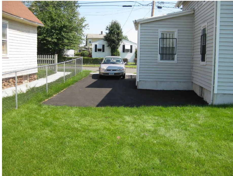
View looking East at restored back yard and driveway