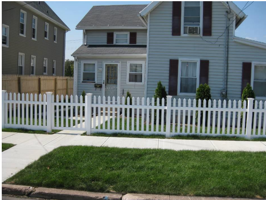
View looking West at restored front yard