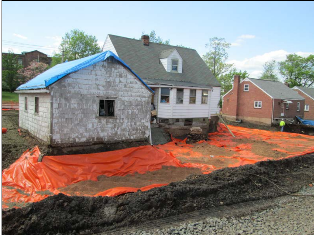
View looking northwest at excavated back yard.