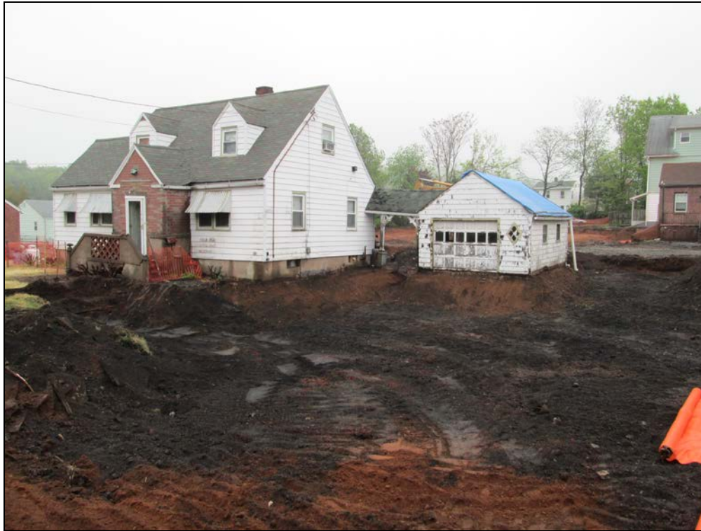
View looking northeast at excavated front yard.