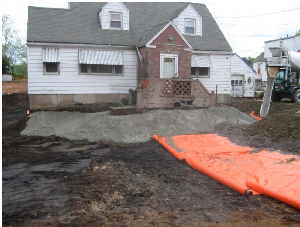
View looking east at marker barrier being placed over fill material left in place.