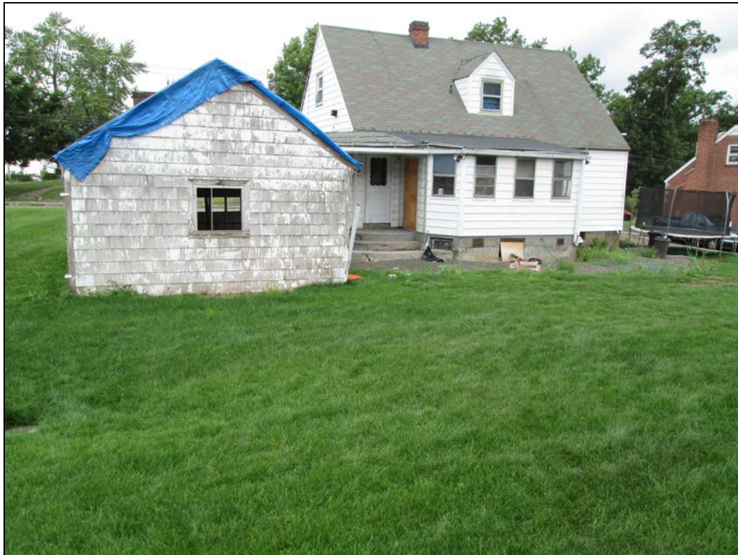
View looking west at restored back yard.