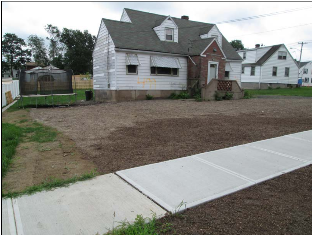
View looking southeast at restored front yard prior to application of hydroseed.