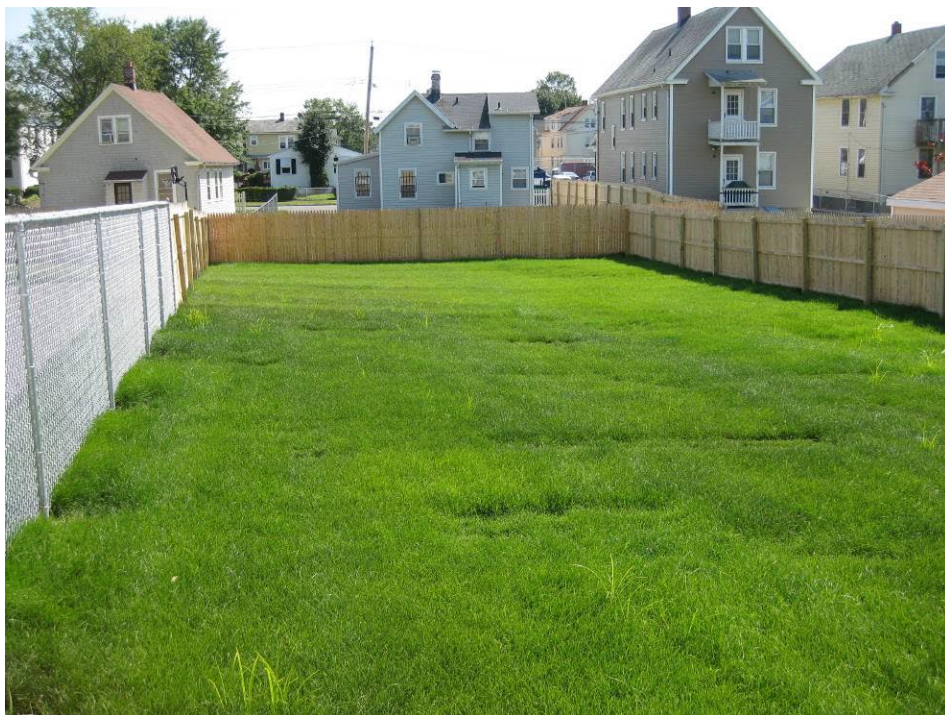
View looking East at restored property