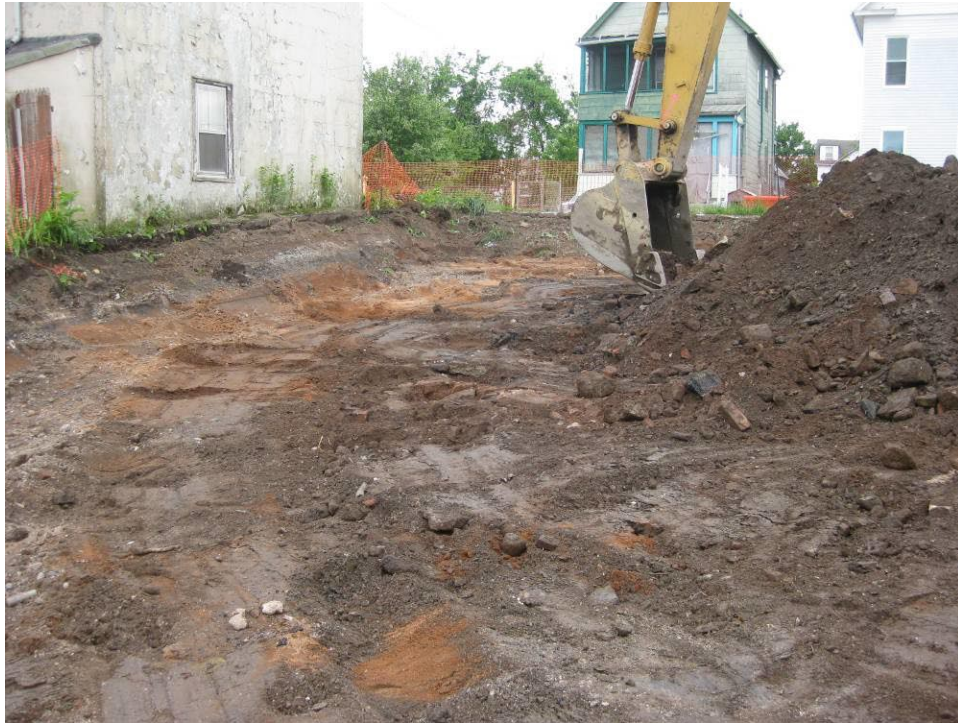
View looking Southwest at excavation area