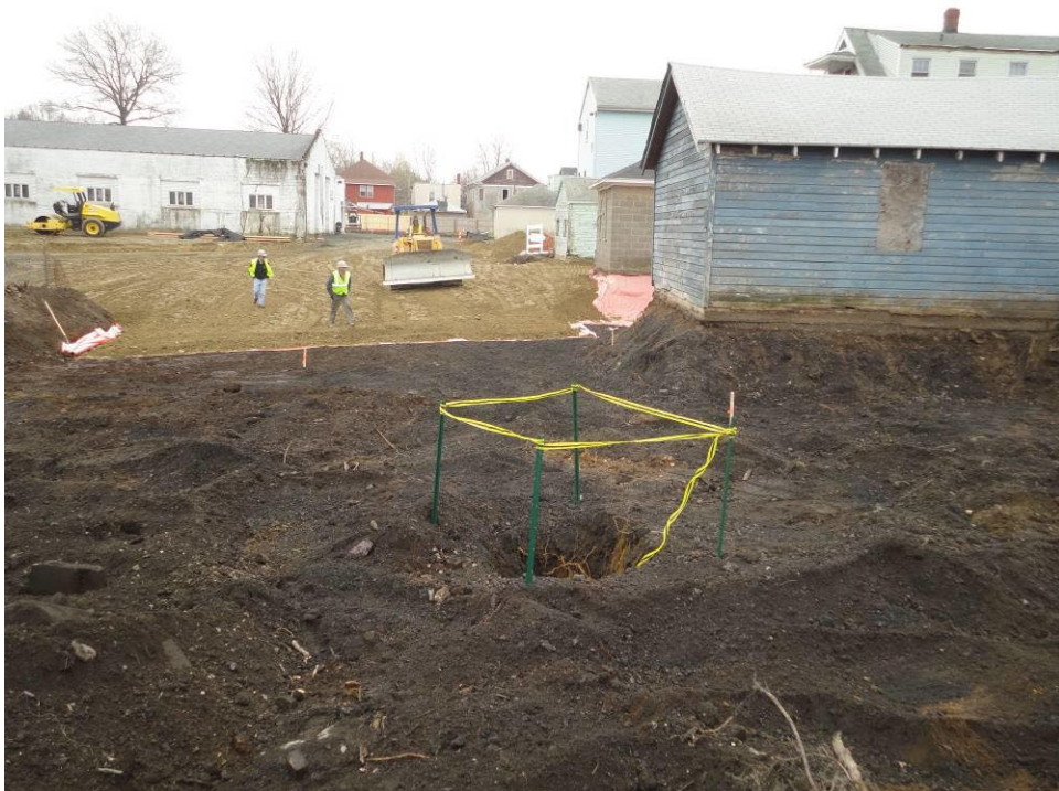
View looking South at existing drywell that was left in place during excavation