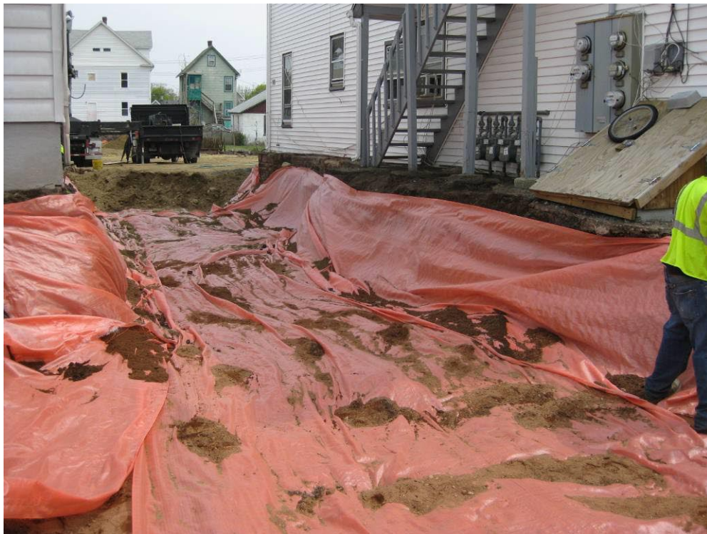
View looking Southeast at excavated side yard following placement of marker barrier