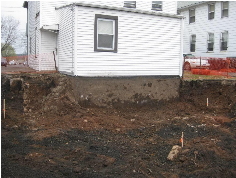
View looking Northwest at extent of excavation prior to placement of marker barrier