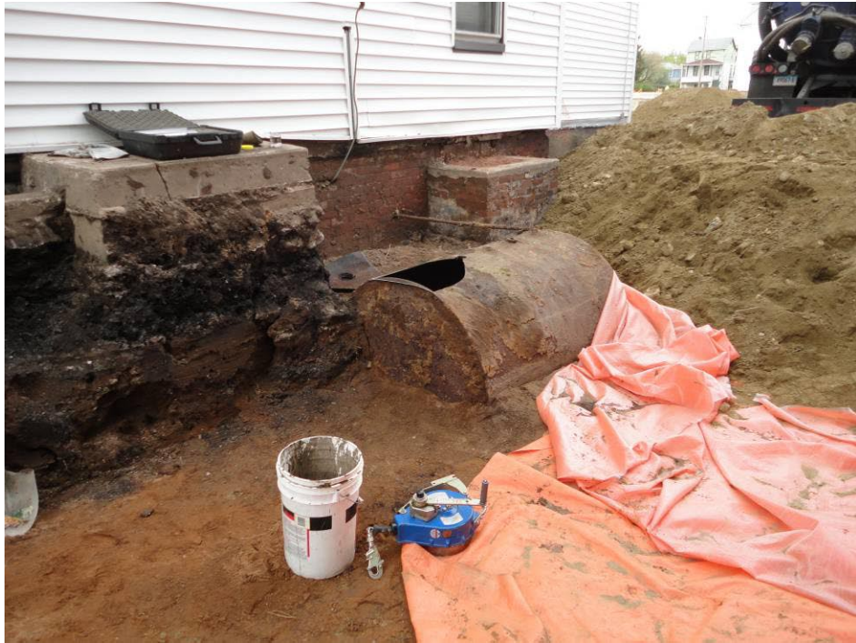
View looking Northeast at inactive UST prior to permanent abandonment