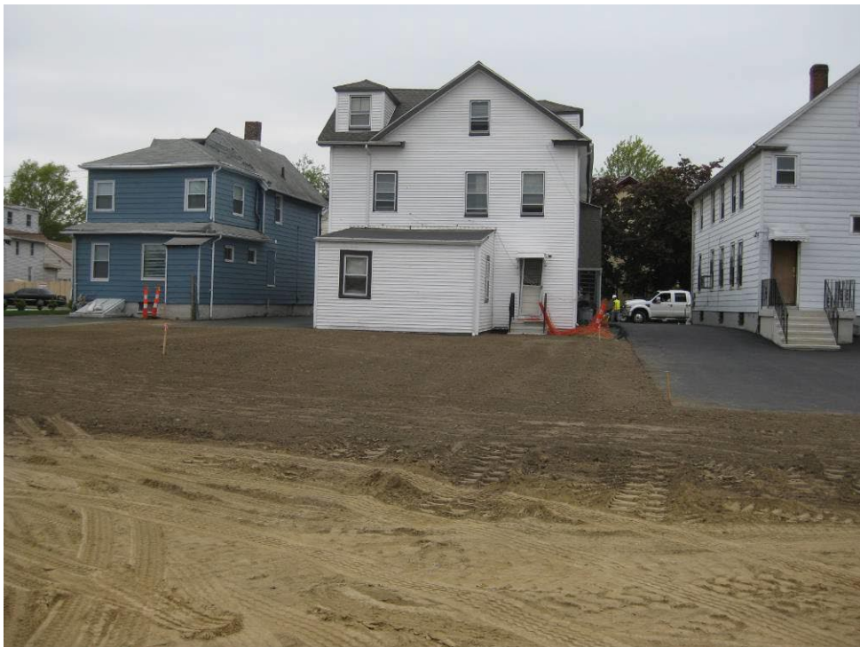
View looking West at backfilled property