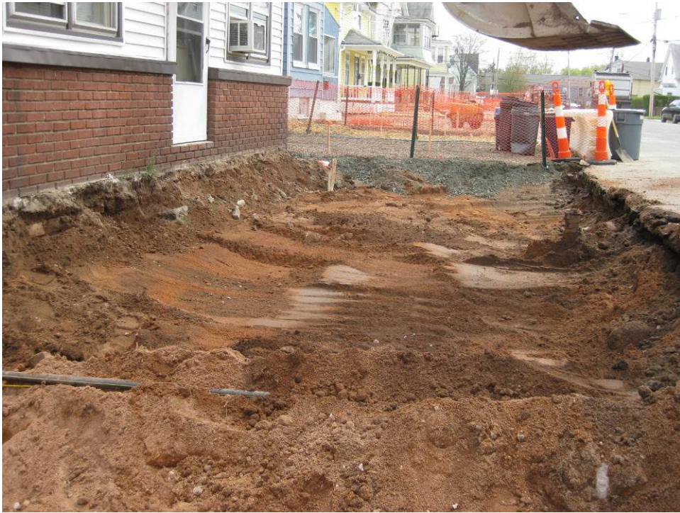
View looking South at excavated front yard