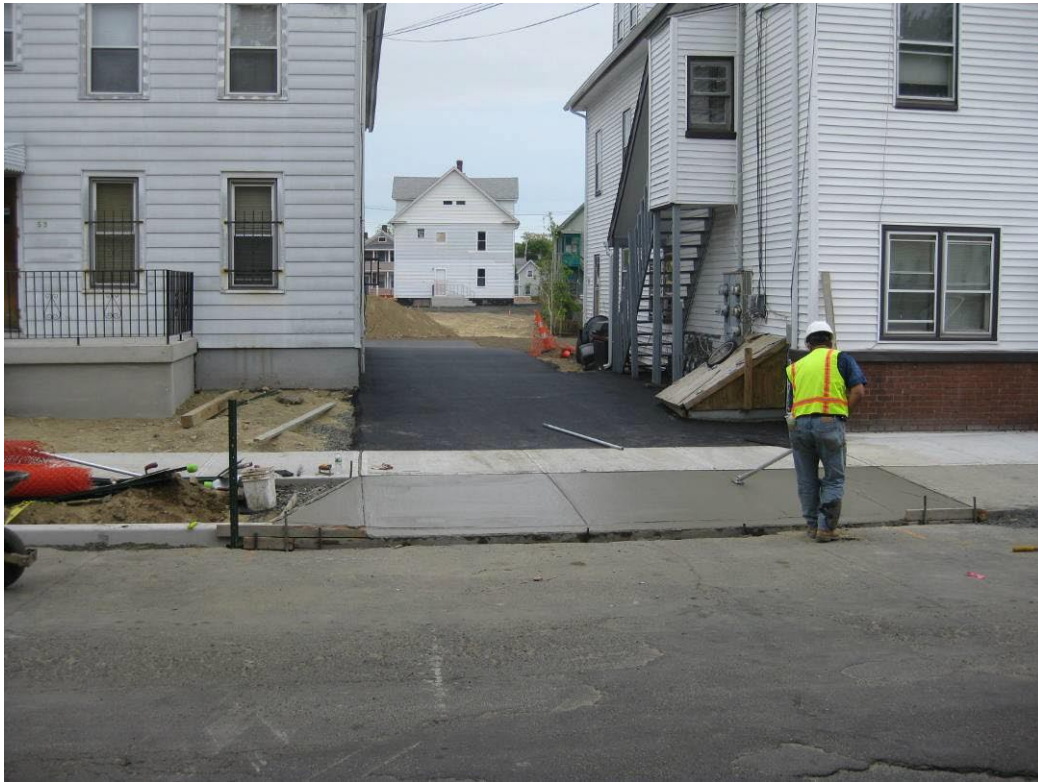
View looking East at partially restored property