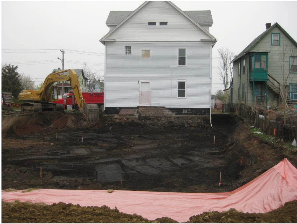
View looking East at excavated back yard