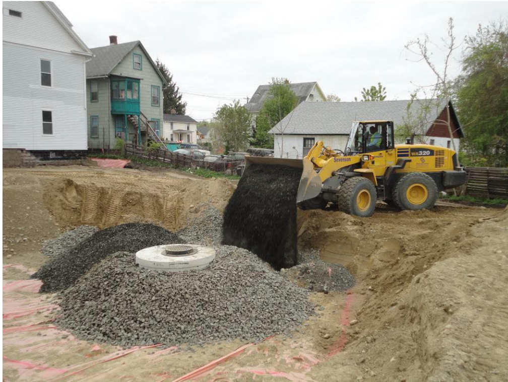
View looking Southeast at drywell installed in backyard