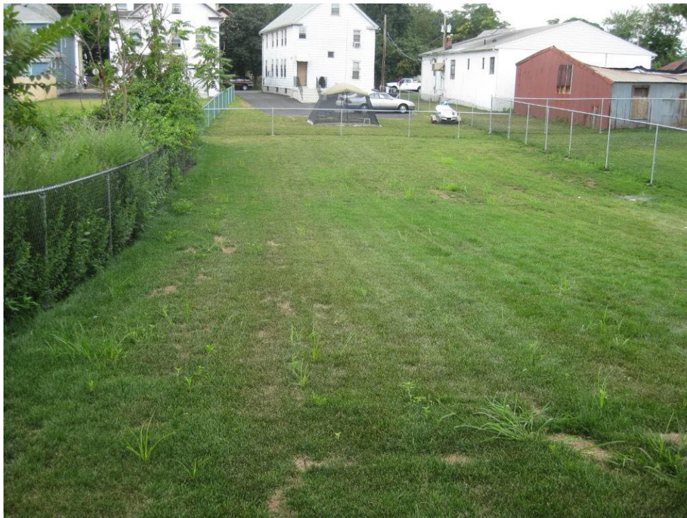
View looking West at restored yard