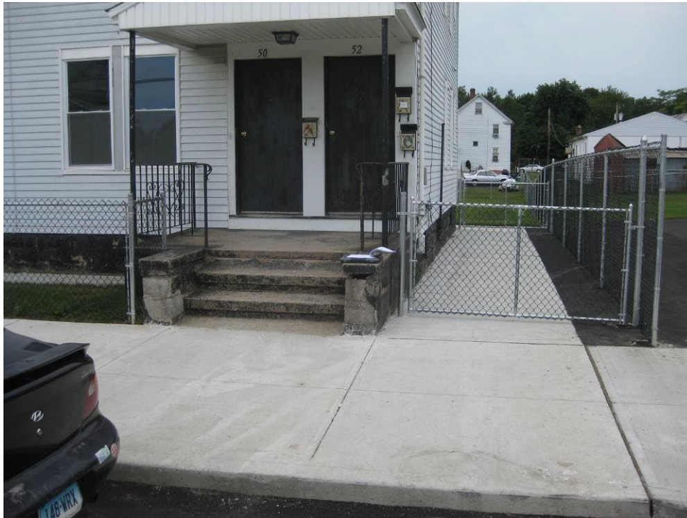
View looking West at restored driveway and sidewalk