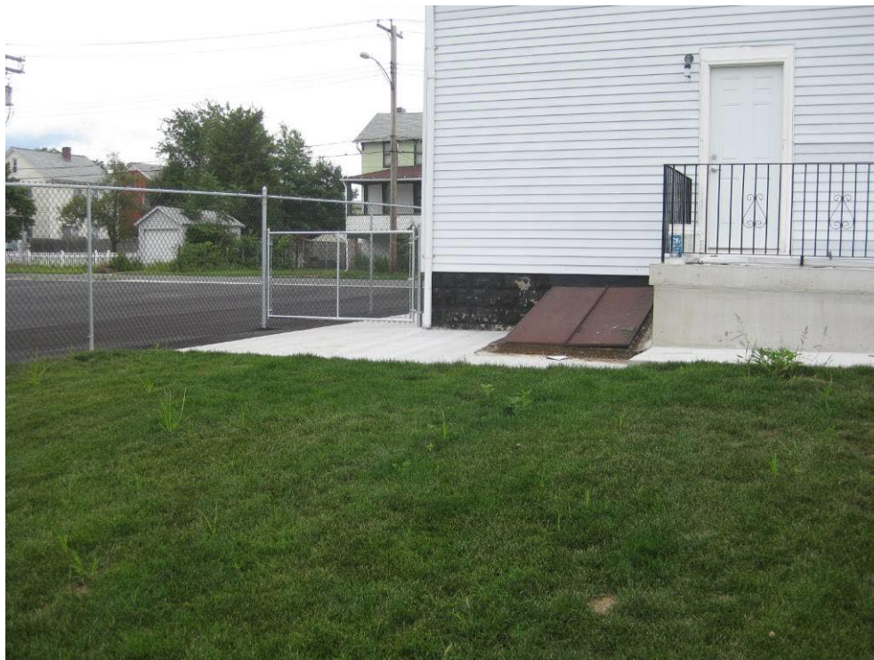
View looking East at restored back yard