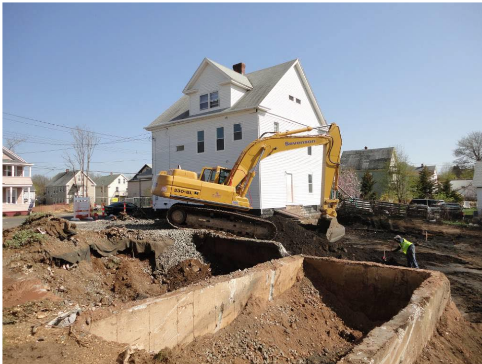
View looking Northeast at excavation from rear of adjacent property