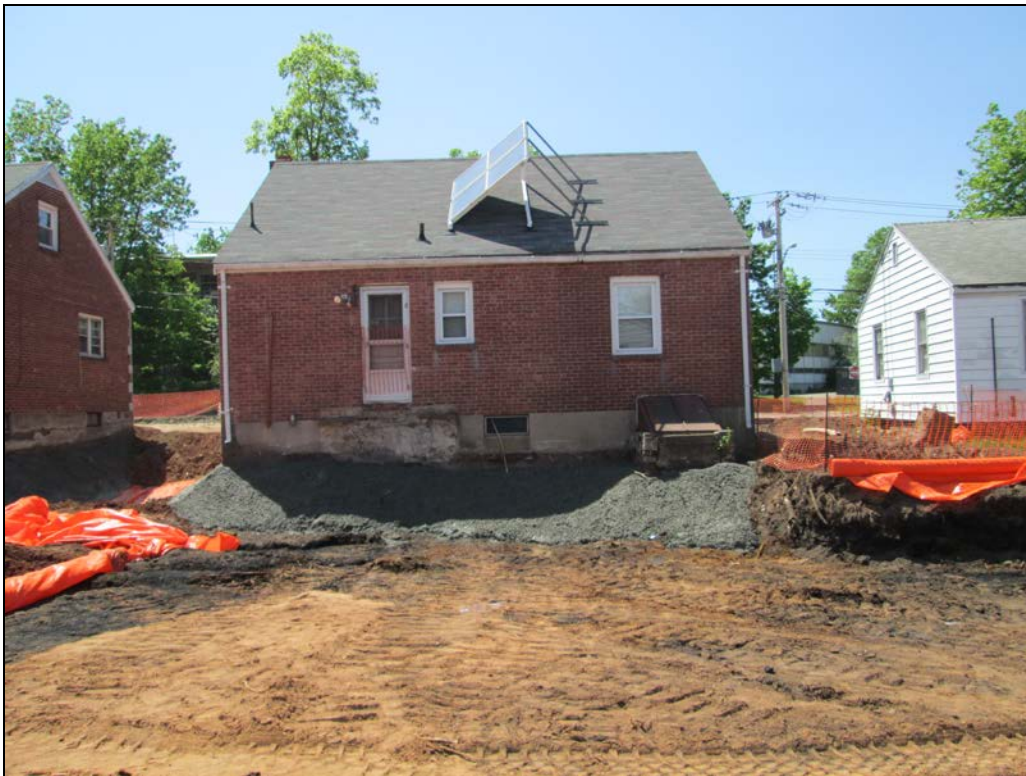
View looking west at excavated back yard.