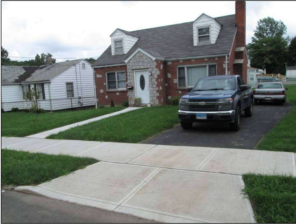
View looking northeast at restored front yard.