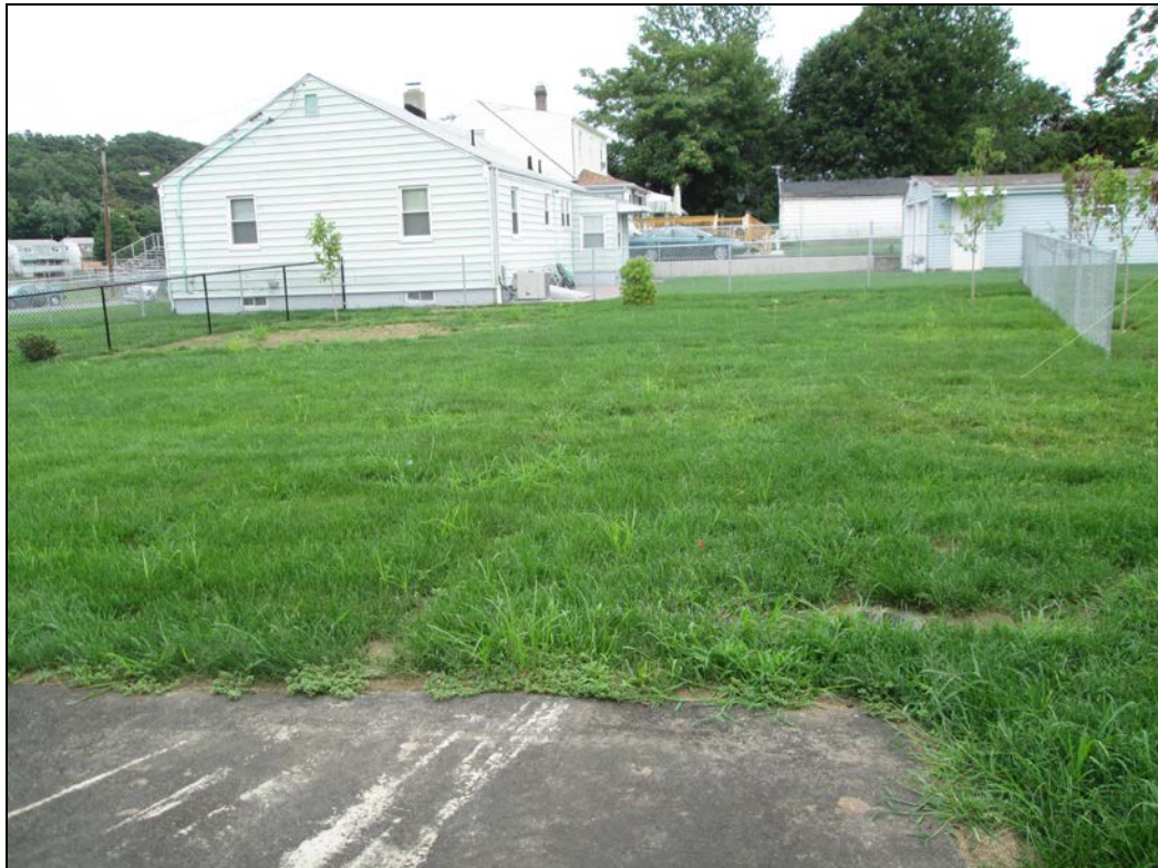
View looking east at restored back yard.