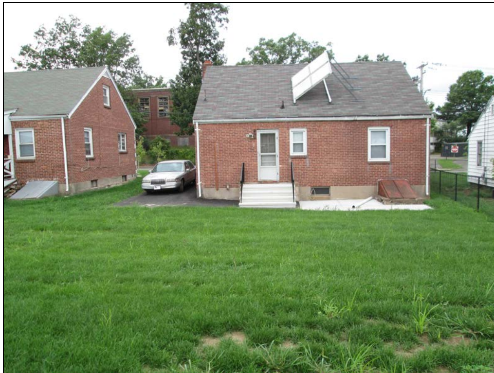
View looking west at restored back of house.