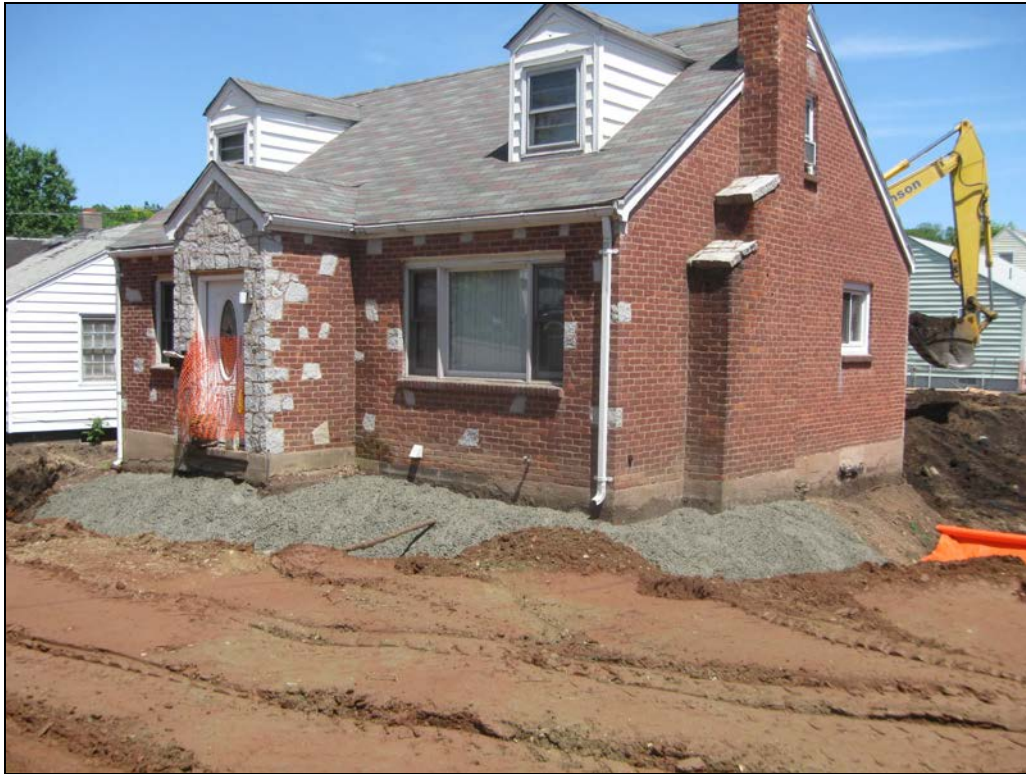
View looking northeast at partially backfilled front yard.