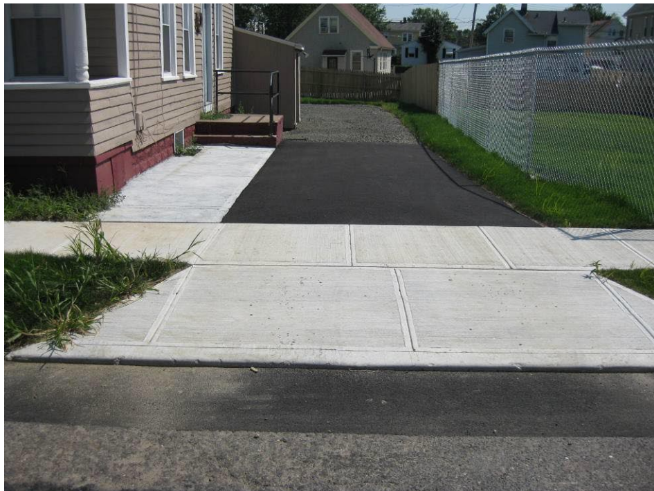
View looking South at restored front yard and driveway