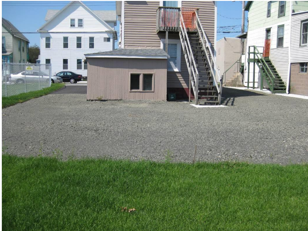
View looking West at restored back yard and gravel parking area