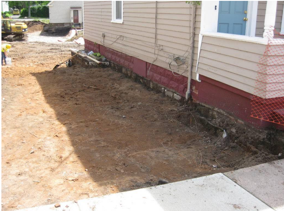
View looking Southeast at excavated side yard on the North side of house