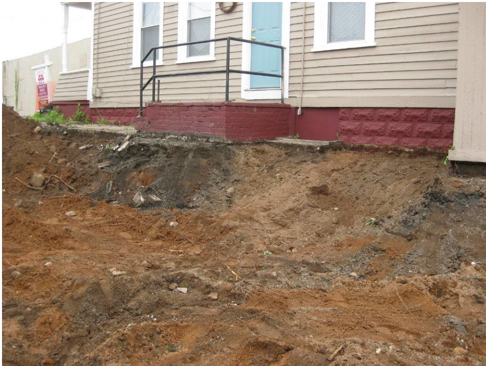
View looking Northwest at excavated side yard on the South side of house