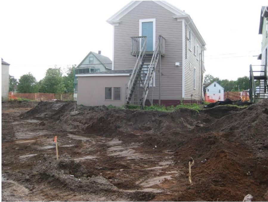
View looking West at excavated back yard