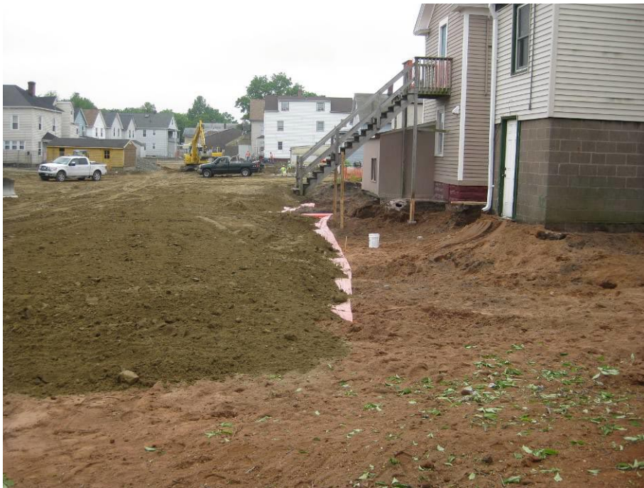
View looking South at partially backfilled yard following placement of marker barrier