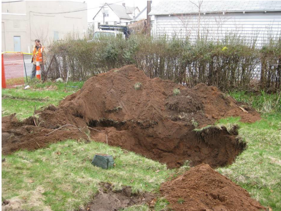
View looking Northwest at excavation of inactive UST