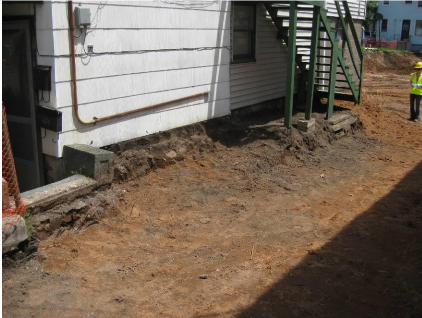
View looking Northeast at excavated side yard