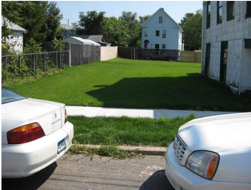
View looking West at partially restored side yard