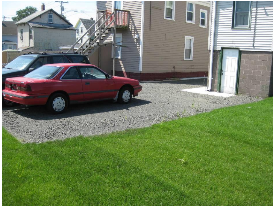
View looking Southwest at restored back yard and parking area