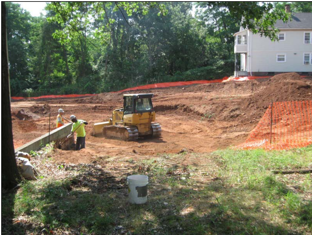
View looking west at excavated back yard.