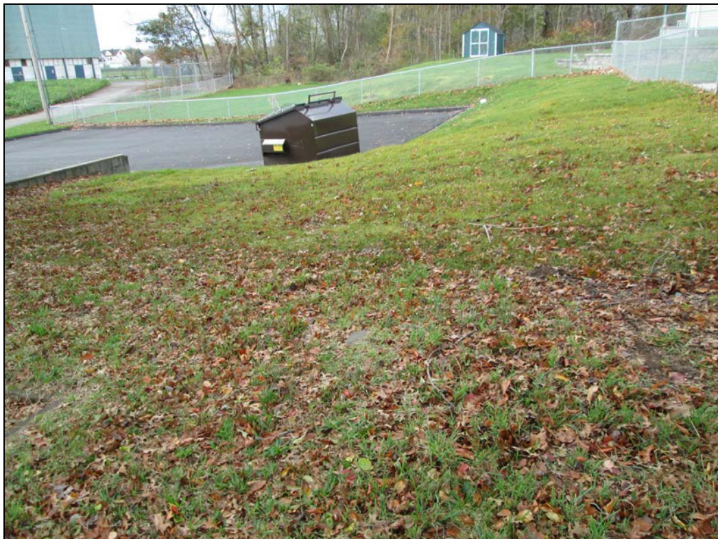
View looking west at restored back yard.