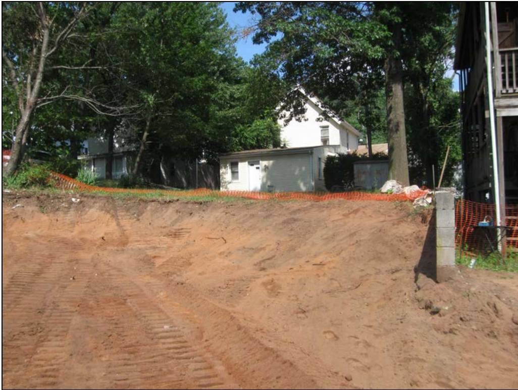
View looking east at excavated back yard.