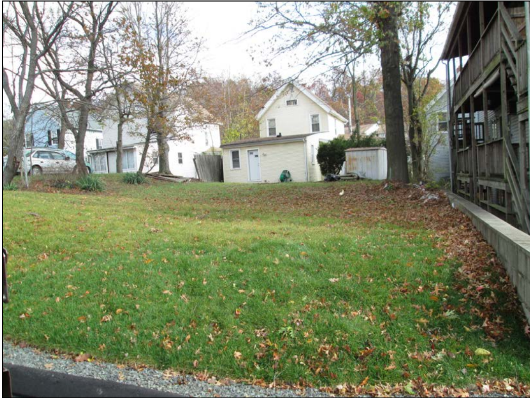
View looking east at restored back yard.