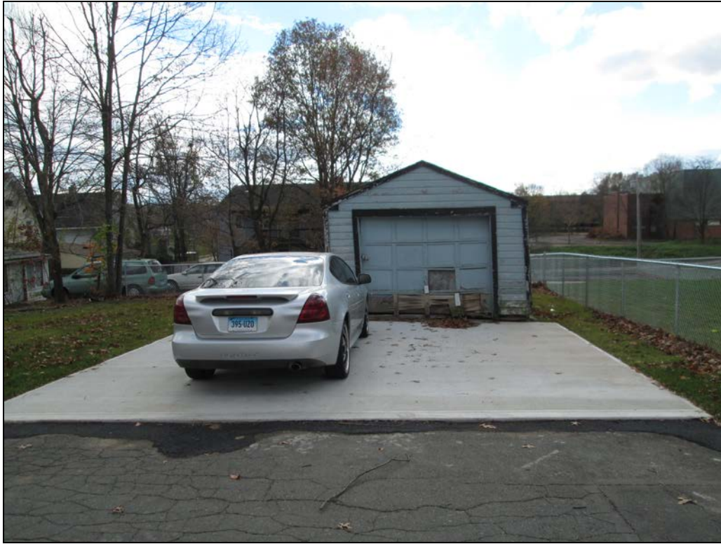
View looking northeast at restored parking area.