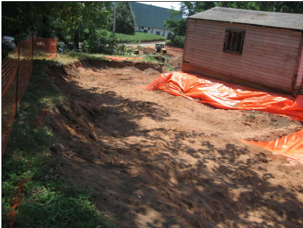
View looking west at excavated yard.