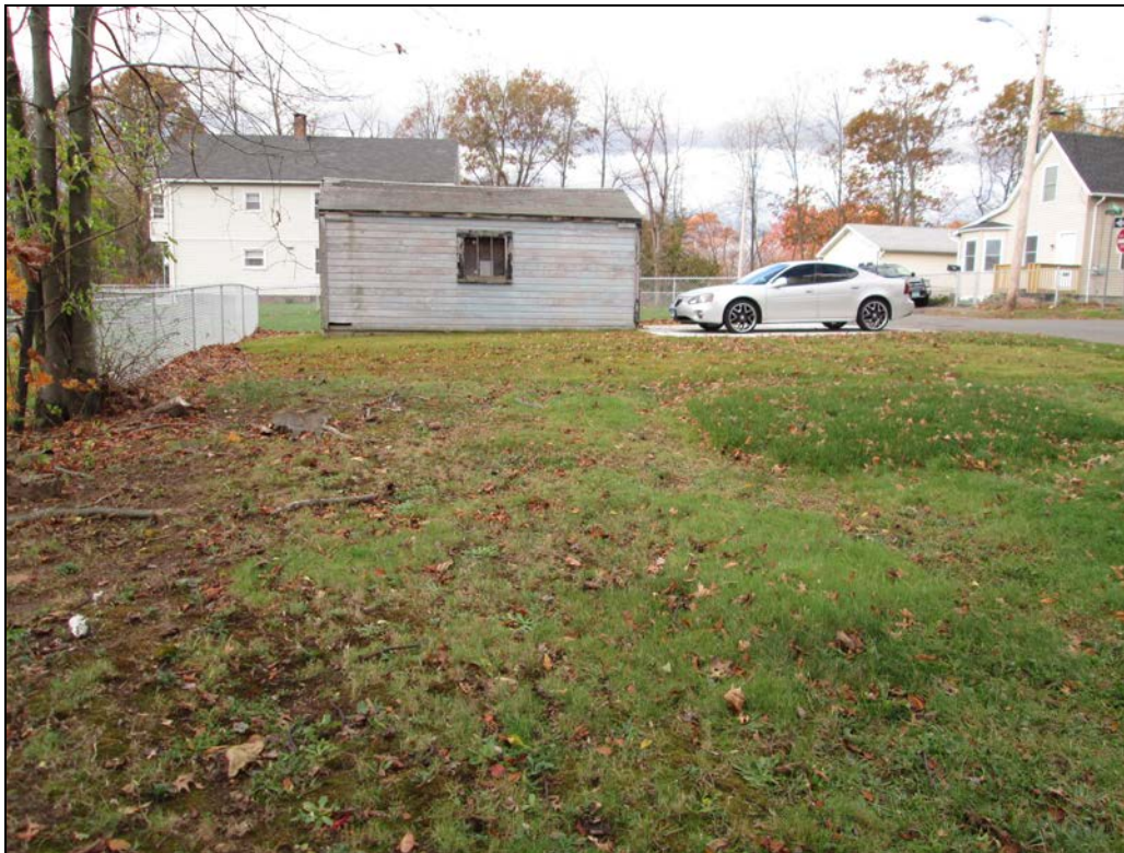
View looking west at restored back yard.