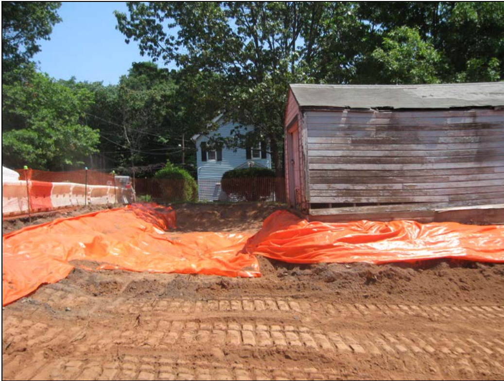
View looking east at excavated yard after placement of marker barrier.