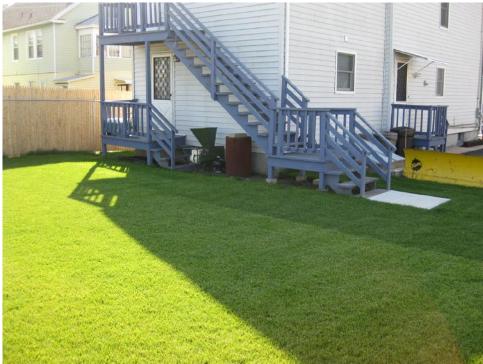
View looking Southeast at restored yard at back of house