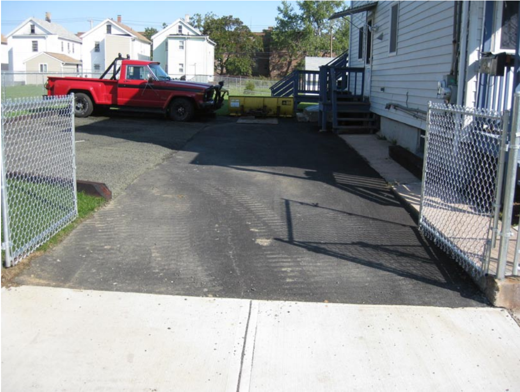
View looking North at restored driveway