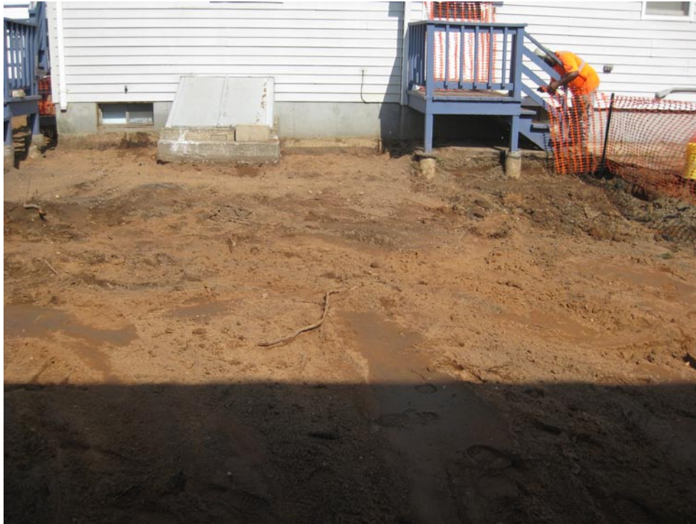
View looking East at excavated side yard