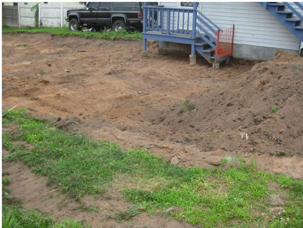
View looking Southeast at excavation area at back of house