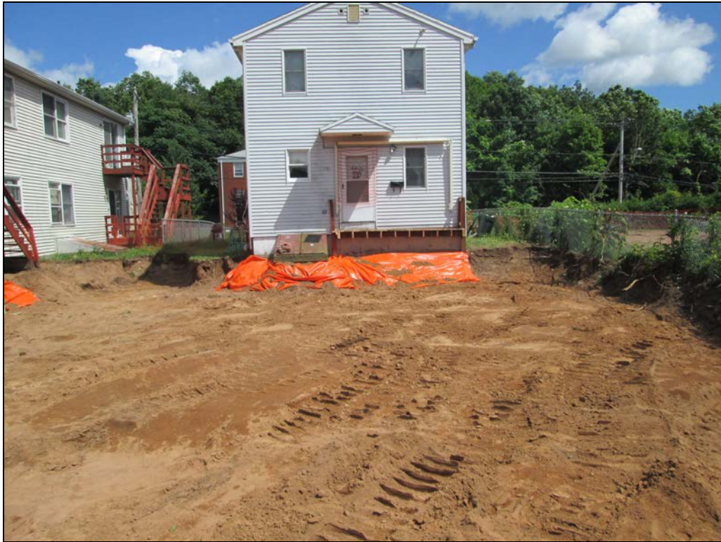
View looking east at excavation in back yard.