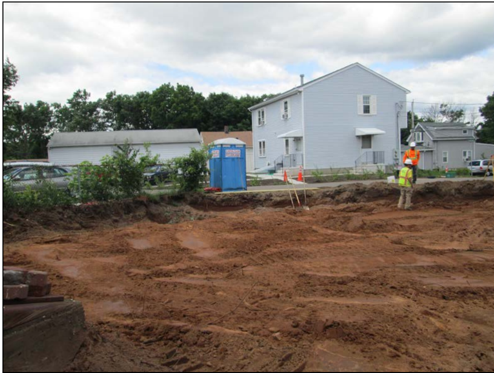
View looking west at excavation along Remington Street.