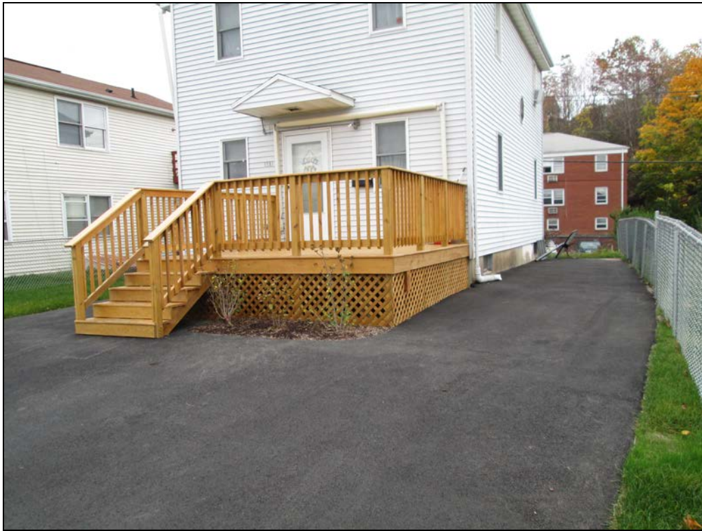
View looking east at restored deck and parking area.