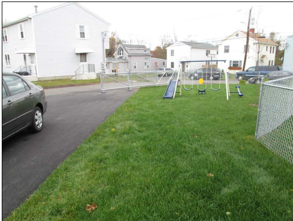
View looking west at restored side yard.