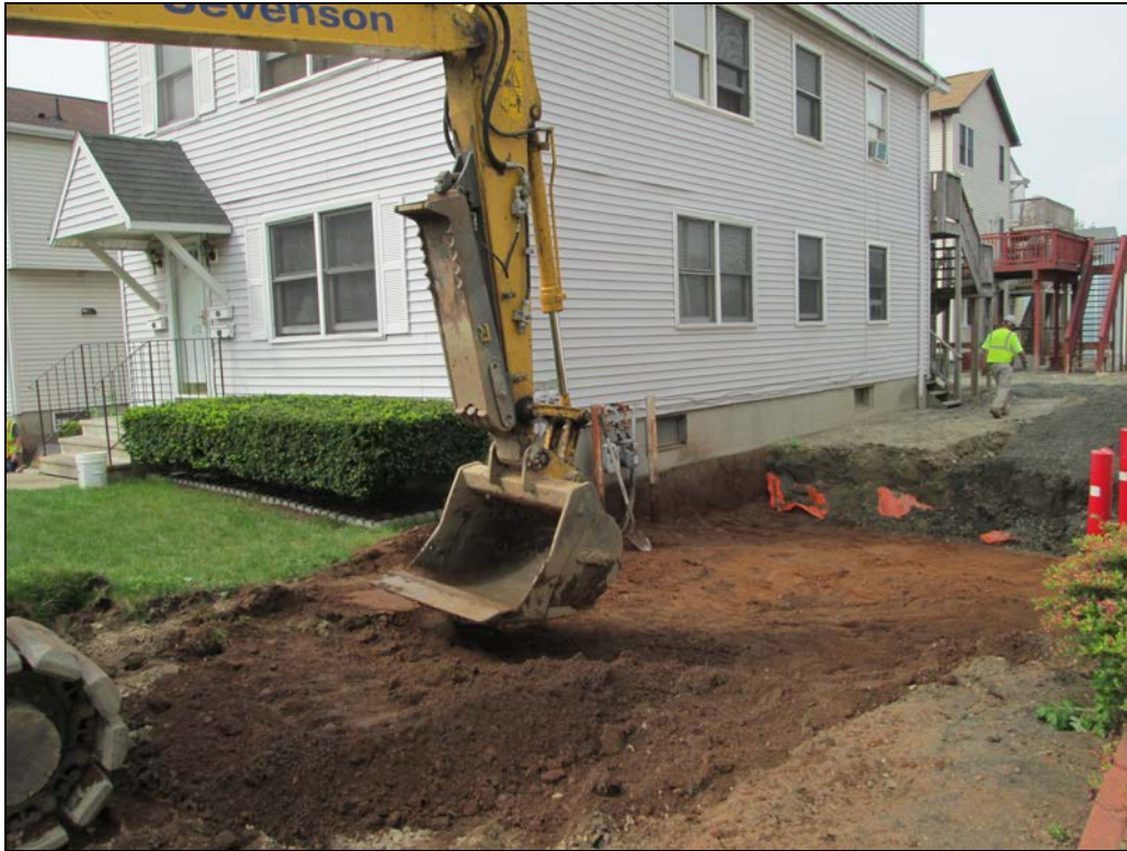
View looking southwest at excavation activities in side yard.