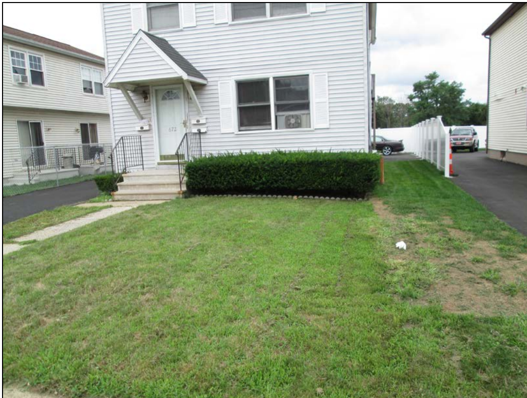
View looking west at restored front yard.