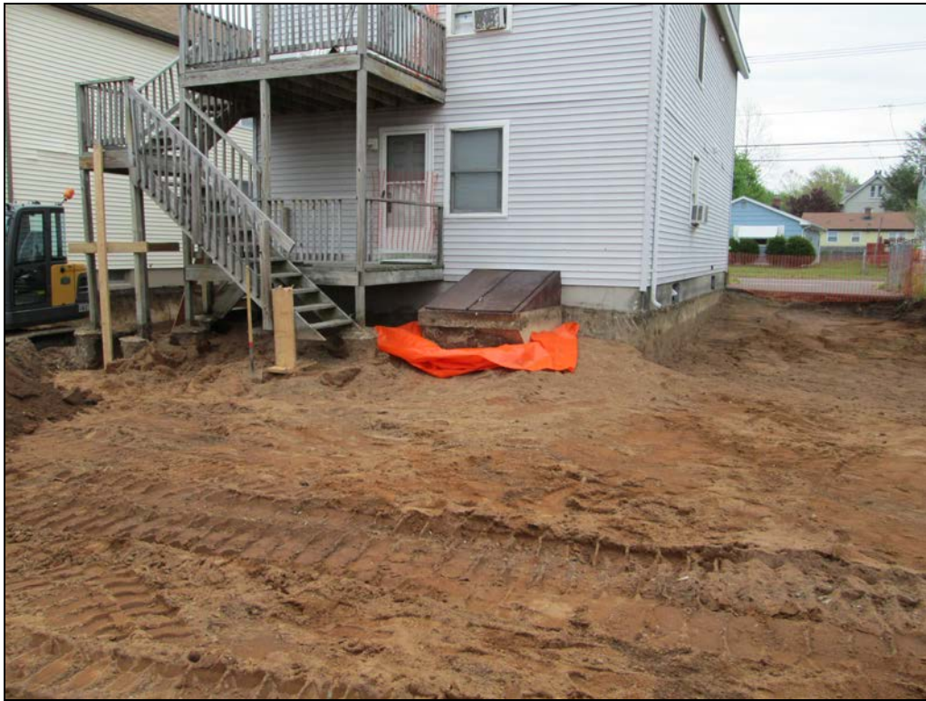
View looking east at excavated back yard.