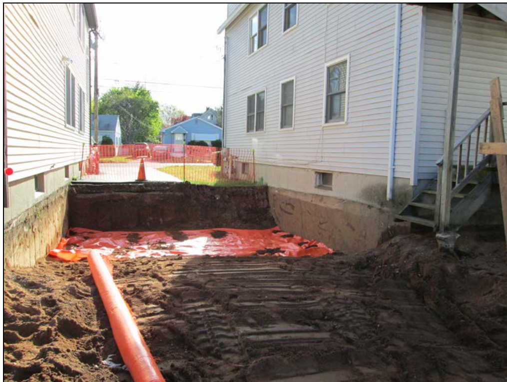
View looking west at excavated side yard during placement of marker barrier.