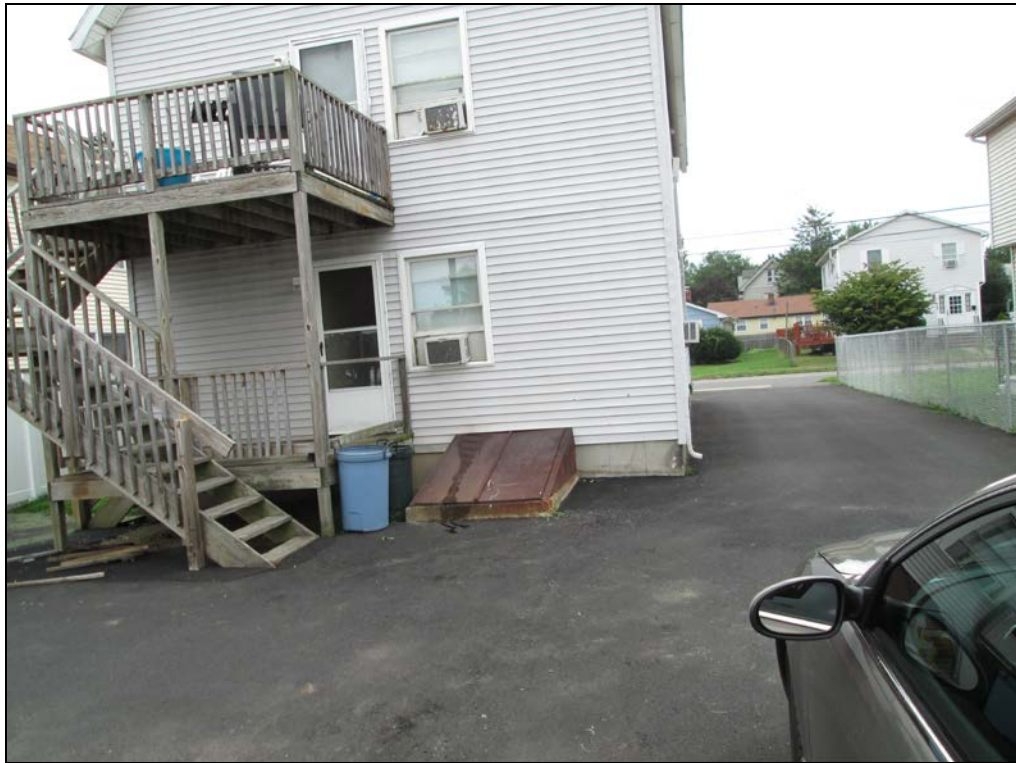
View looking east at restored driveway.