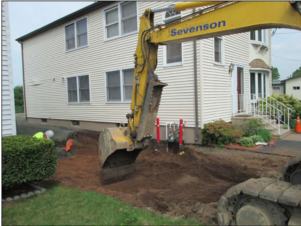
View looking northwest at excavation activities in driveway area.