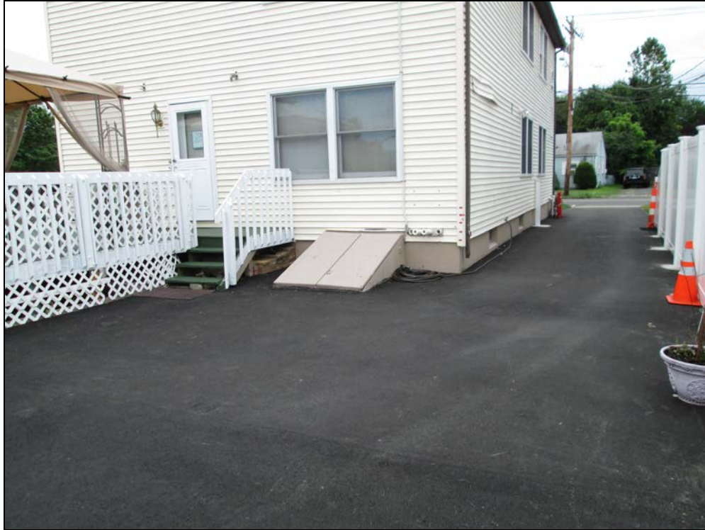
View facing east at restored driveway.