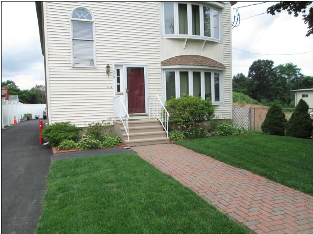
View looking west at restored front yard.