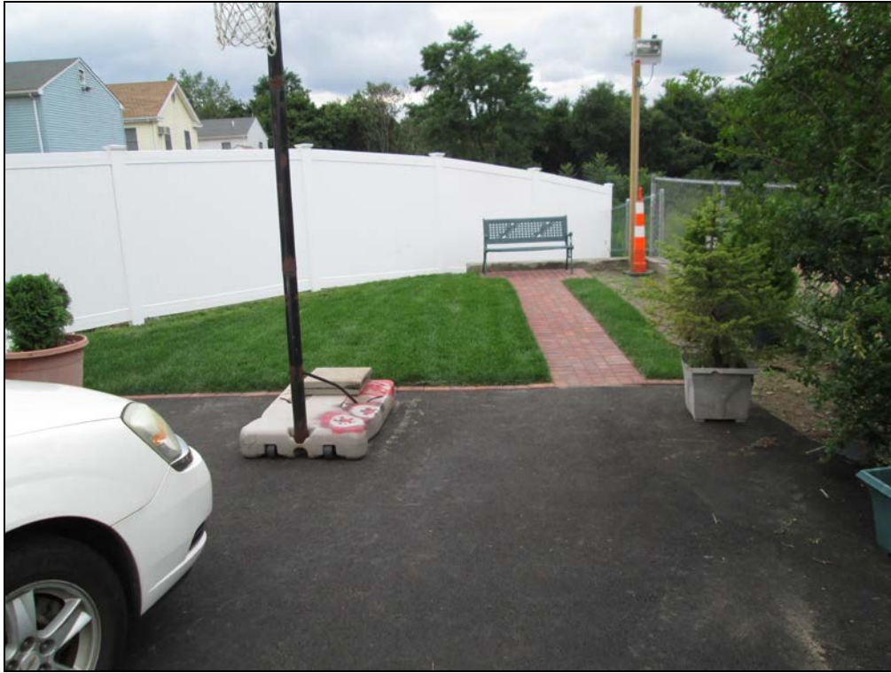
View looking west at partially restored back yard.