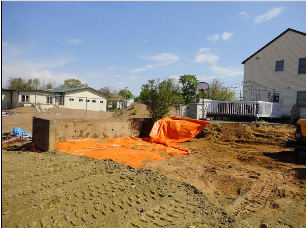
View looking northeast at excavated back yard during placement of marker barrier.