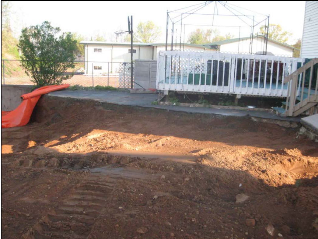
View looking north at extent of excavation in parking area.