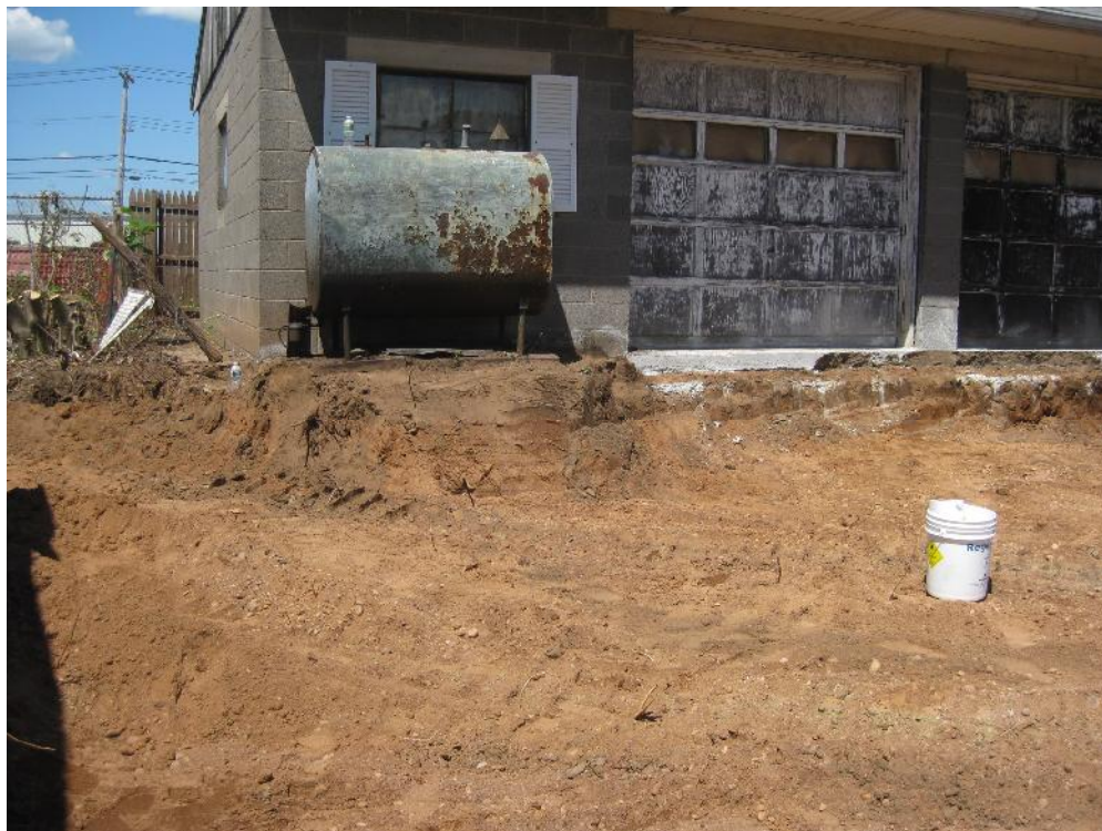
View looking North at excavation along garage