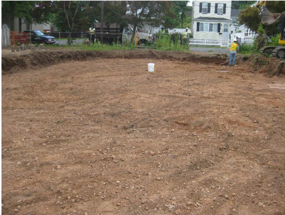
View looking South at excavation area