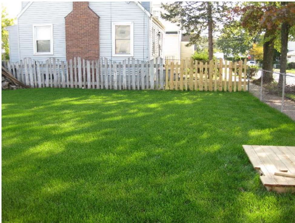
View looking East at restored side yard