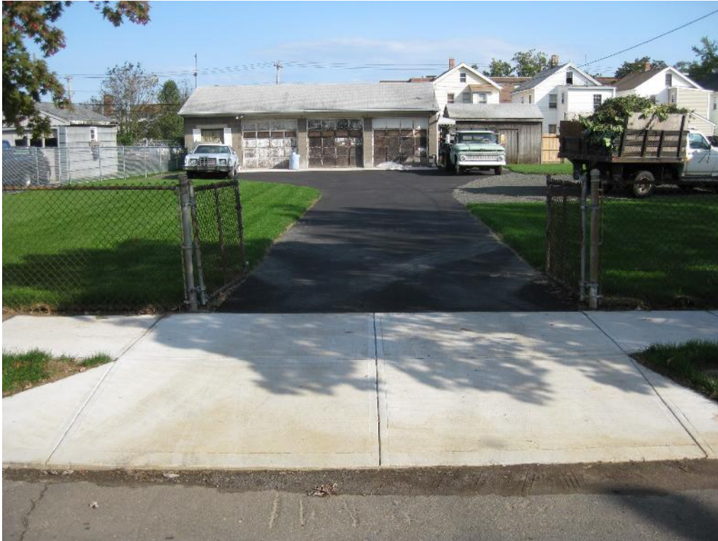
View looking North at restored driveway