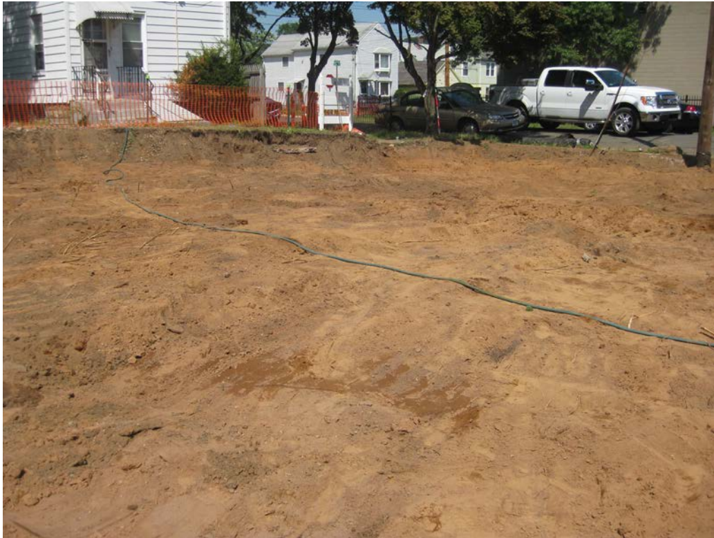
View looking Northeast at excavated side yard