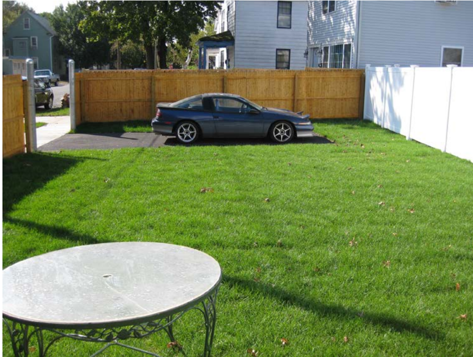
View looking South at restored side yard