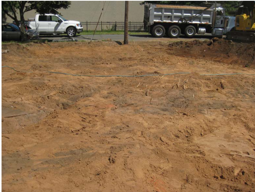
View looking East at excavated side yard