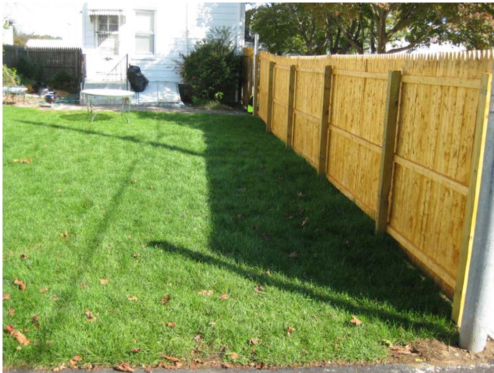
View looking North at restored yard