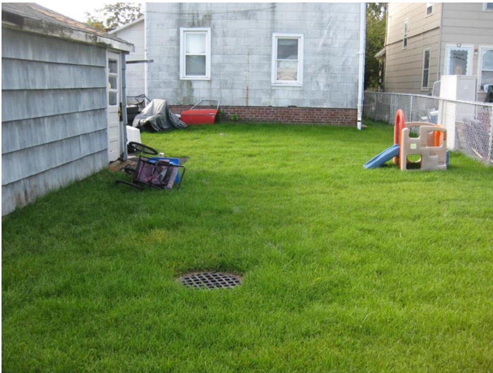
View looking South at newly installed drywell and restored back yard