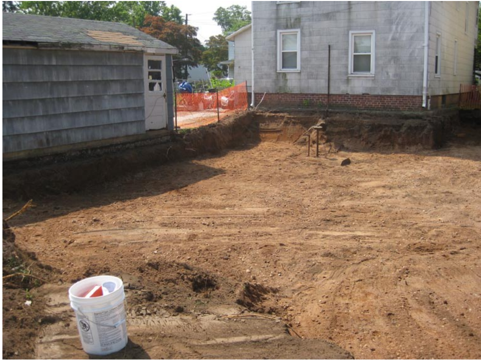
View looking South at excavation of back yard