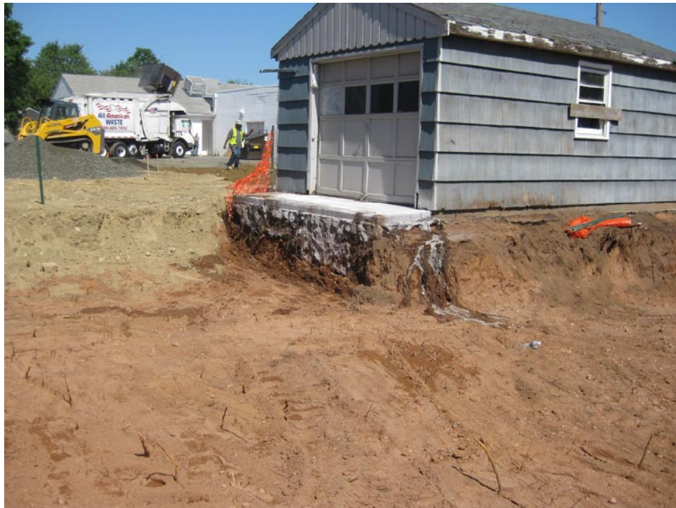
View looking Southeast at excavation along garage