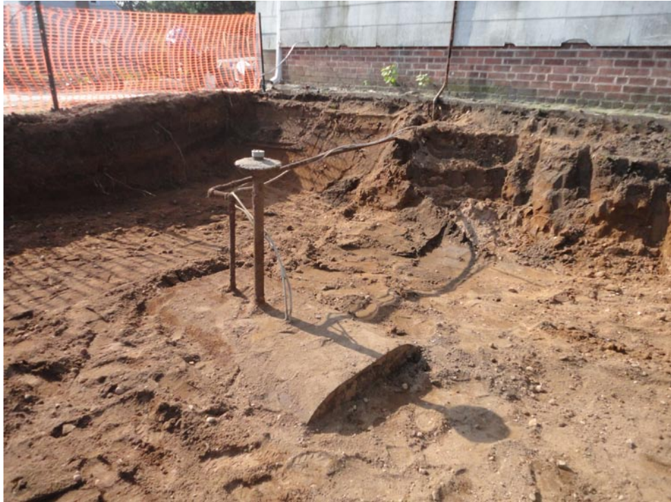
View looking Southeast at UST to be removed by rear of house