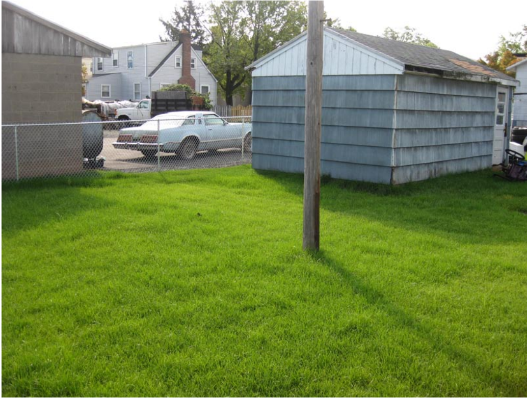
View looking Southeast at restored back yard