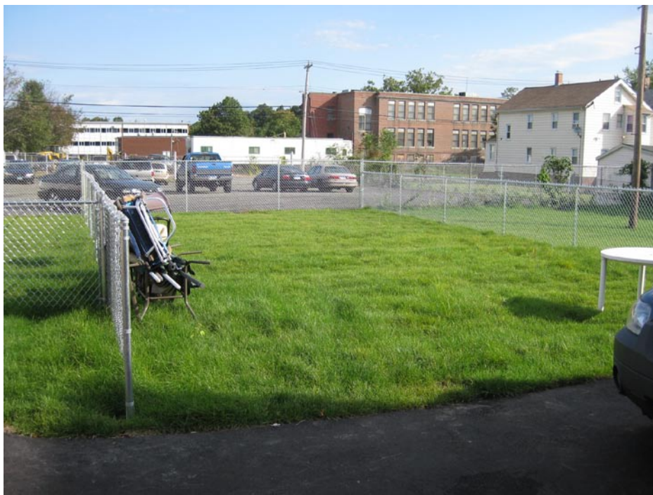
View looking North at partially restored back yard