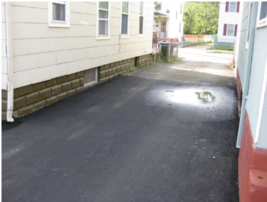
View looking South showing replaced portion of driveway