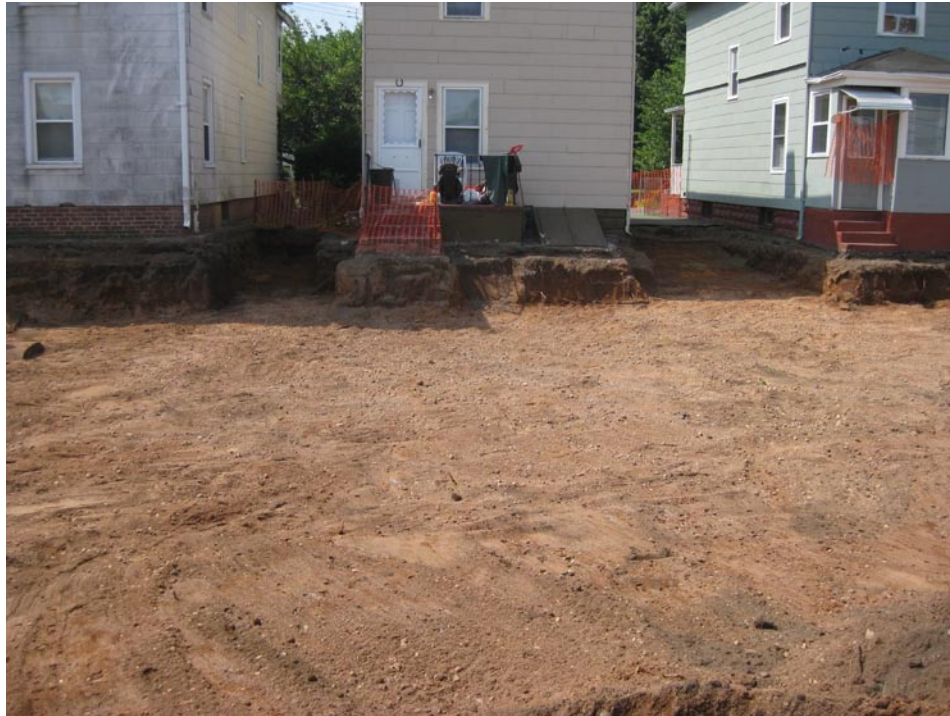
View looking South at full excavation area