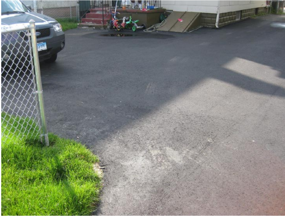
View looking Southeast at restored driveway and parking area