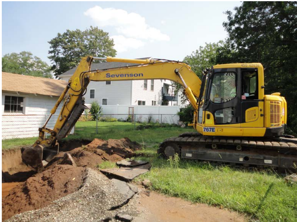
View looking Southeast at excavated back yard