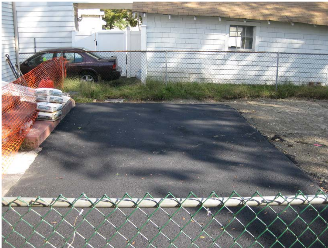
View looking South at restored back yard