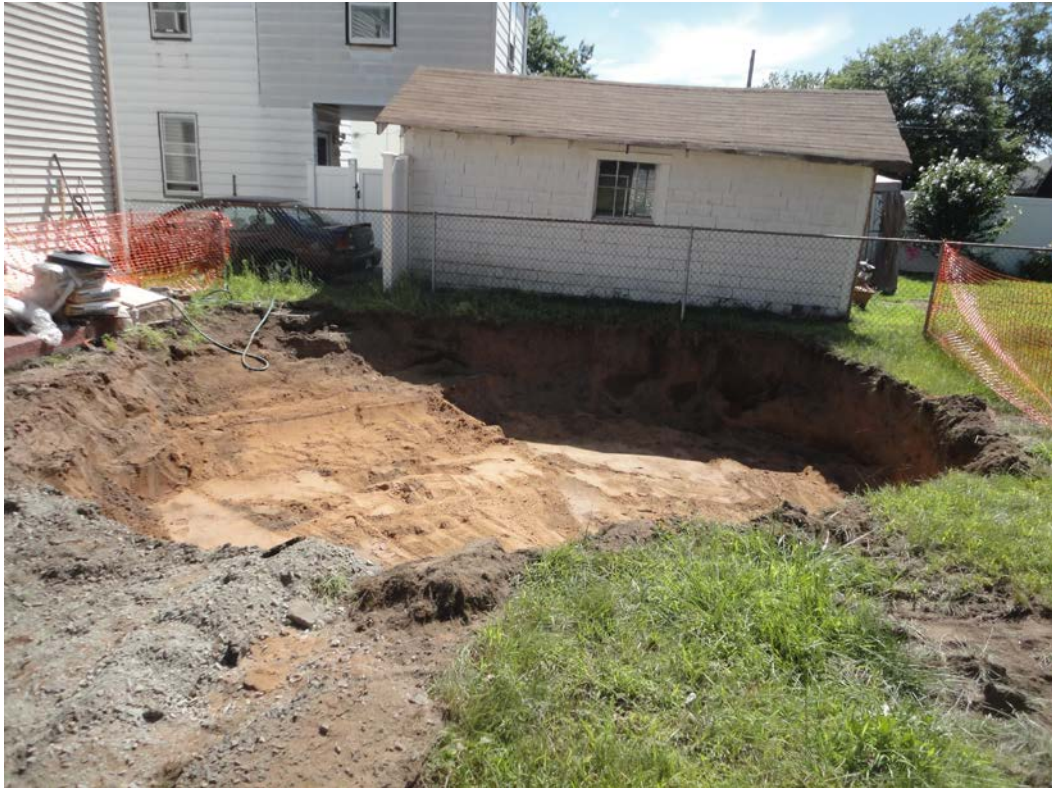
View looking East at excavated back yard