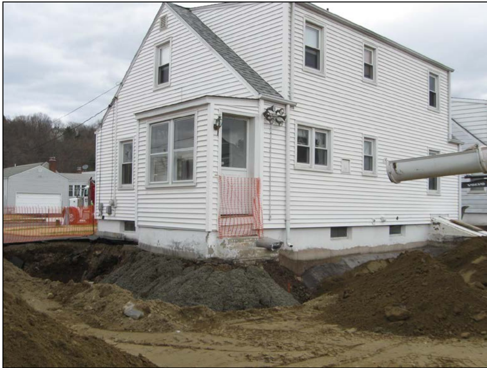
View looking northeast at concrete marker barrier being installed around remaining fill.