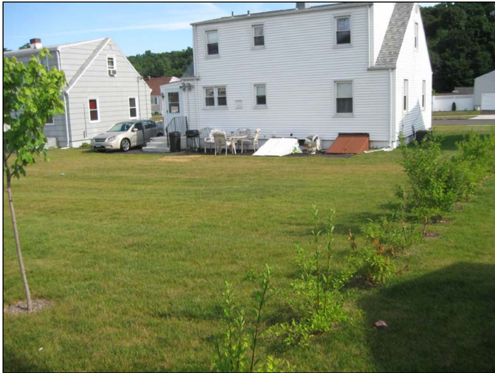
View looking northwest at restored back yard.