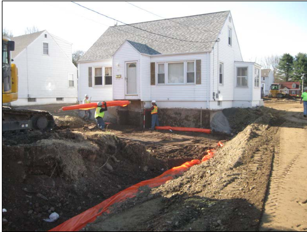
View facing southeast at marker barrier being installed in front yard.