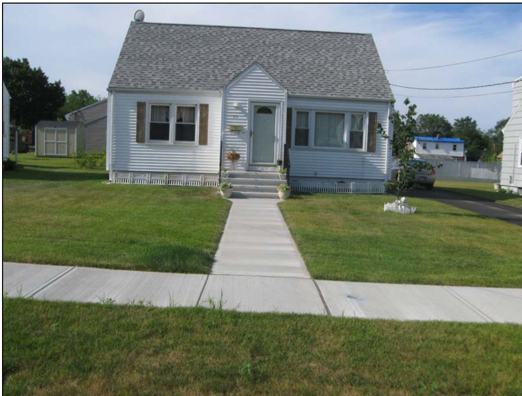
View looking south at restored front yard.