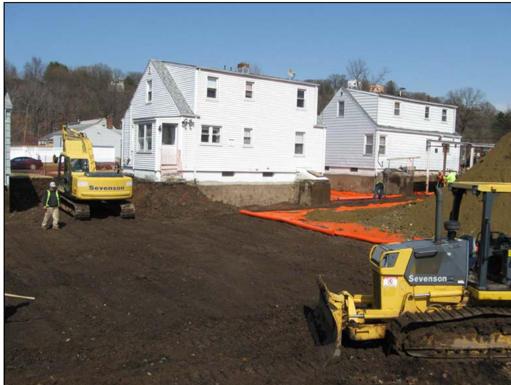
View looking northeast at excavated back yard.