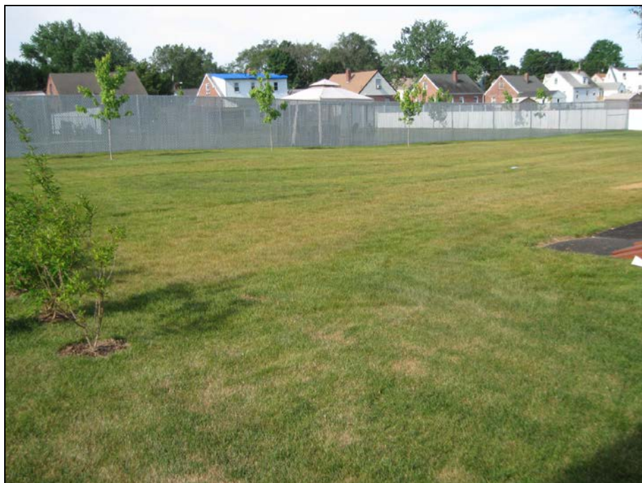
View looking southwest at restored back yard.