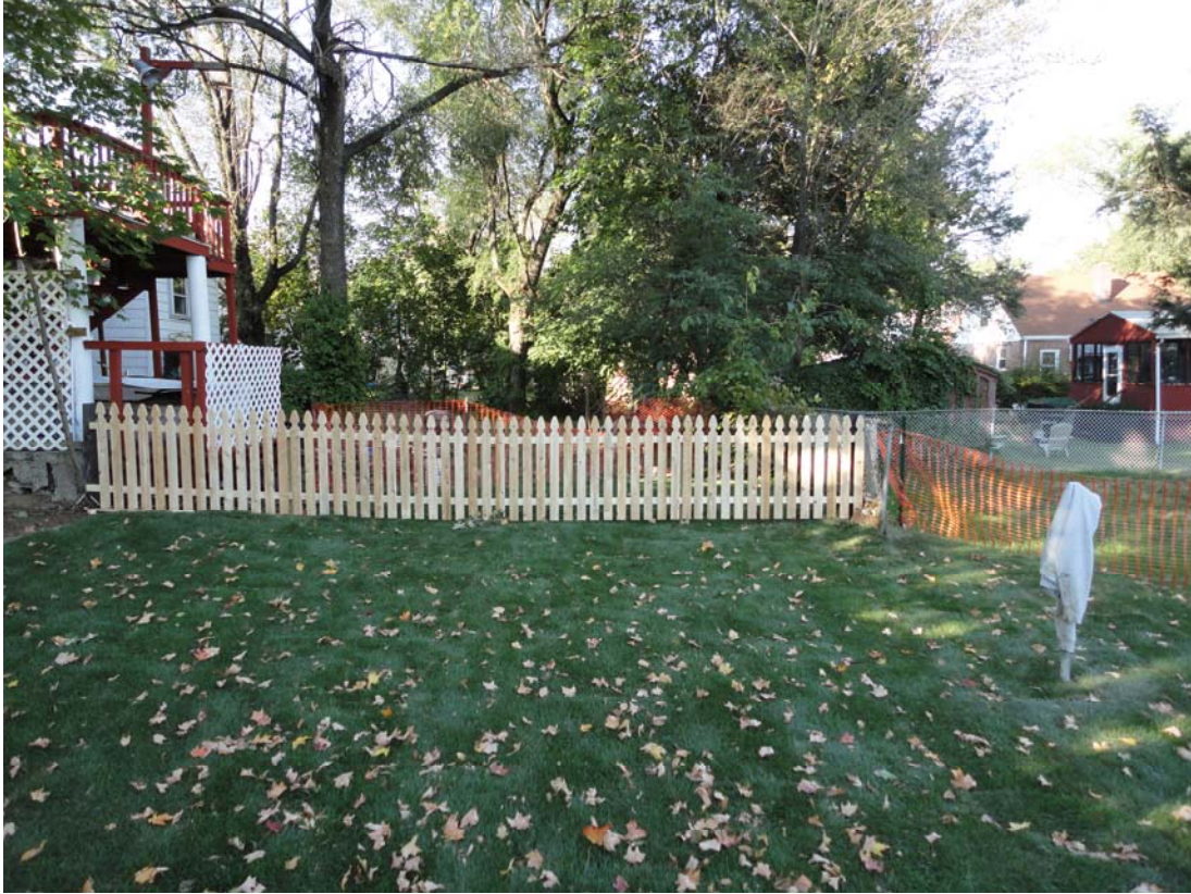
View looking north from backyard of adjacent property at fencing installed following restoration of 965 Winchester Ave.