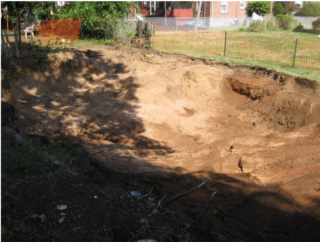
View looking northeast from backyard of 957-959 Winchester Avenue. Excavation at 965 Winchester Ave was limited to area in the vicinity of orange construction fencing.