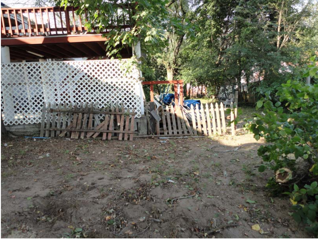
View looking north from backyard of adjacent property at fencing removed to allow excavation.