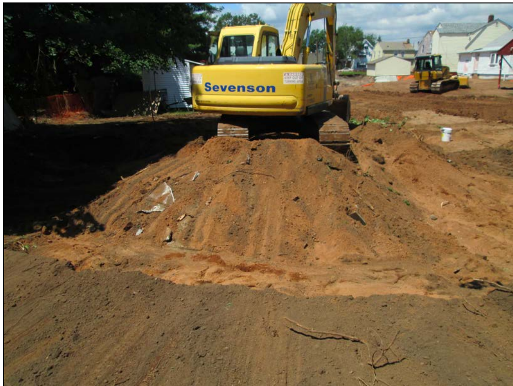
View looking west at excavated back yard.