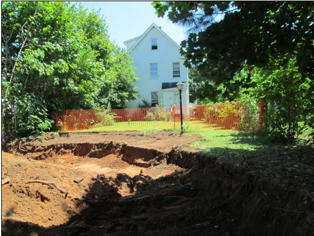
View looking east at extent of excavation in back yard.