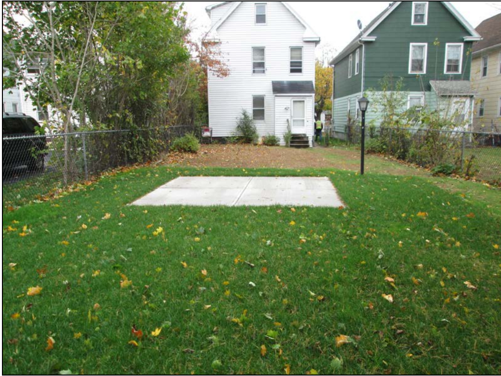
View looking east at restored back yard.