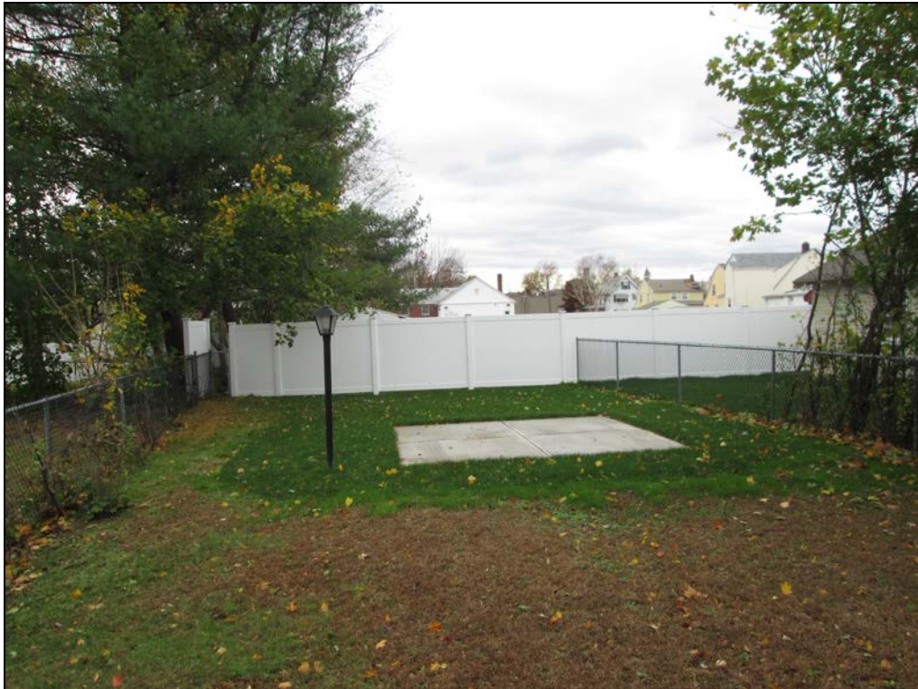
View looking west at restored back yard.